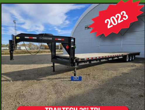
TRAILTECH 36' TRI