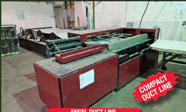
ENGEL DUCT LINE

PLACE: 27278 HWY 628, ACHESON, AB • PREVIEW: MON., NOV, 18TH, 2024 - 9AM TO 5 PM