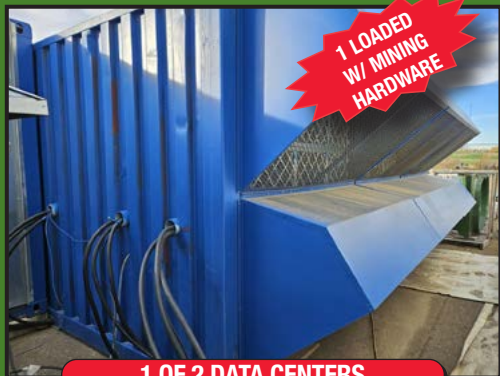
1 OF 2 DATA CENTERS