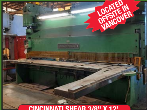
CINCINNATI SHEAR 3/8" X 12',