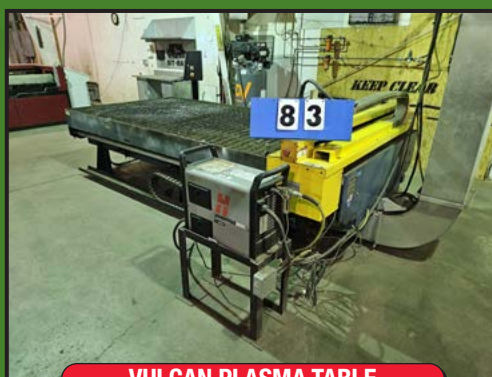
VULCAN PLASMA TABLE