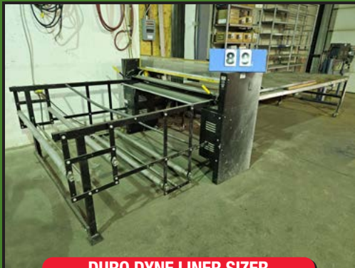
DURO DYNE LINER SIZER