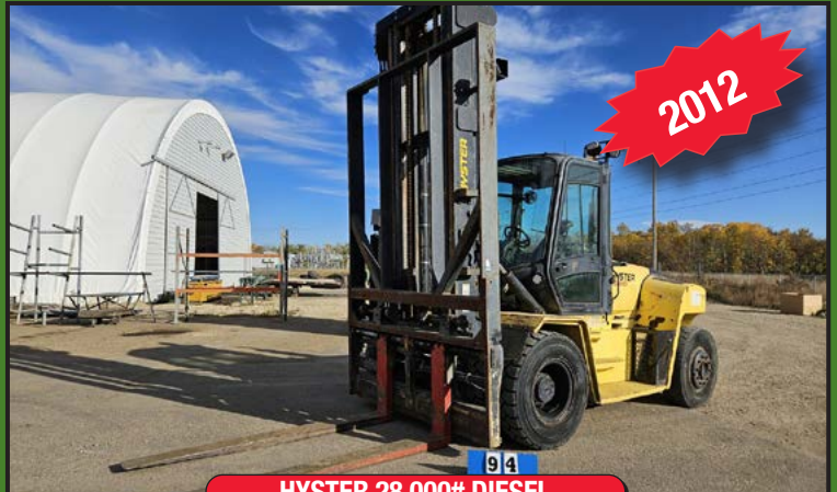
HYSTER 28,000# DIESEL