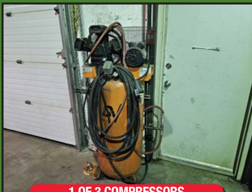
1 OF 3 COMPRESSORS

VISIT www.joinersales.com FOR MORE PHOTOS AND INFORMATION