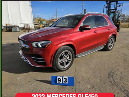
2022 MERCEDES GLE450