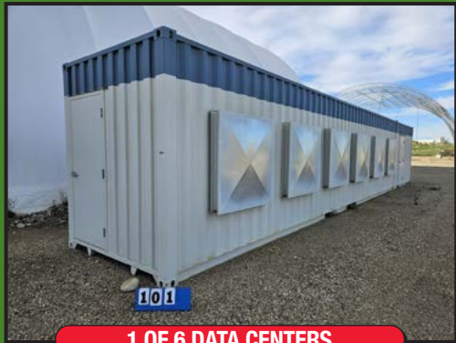
1 OF 6 DATA CENTERS