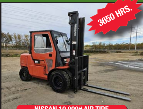
NISSAN 10,000# AIR TIRE