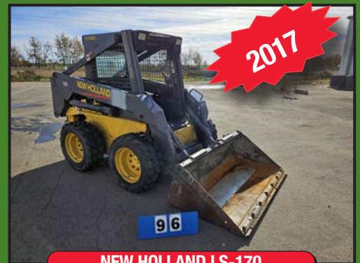
NEW HOLLAND LS-170