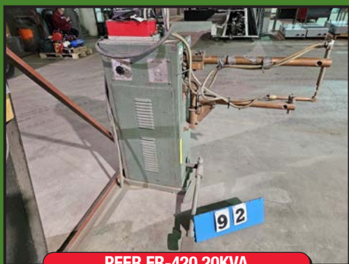
PEER FR-420 20KVA