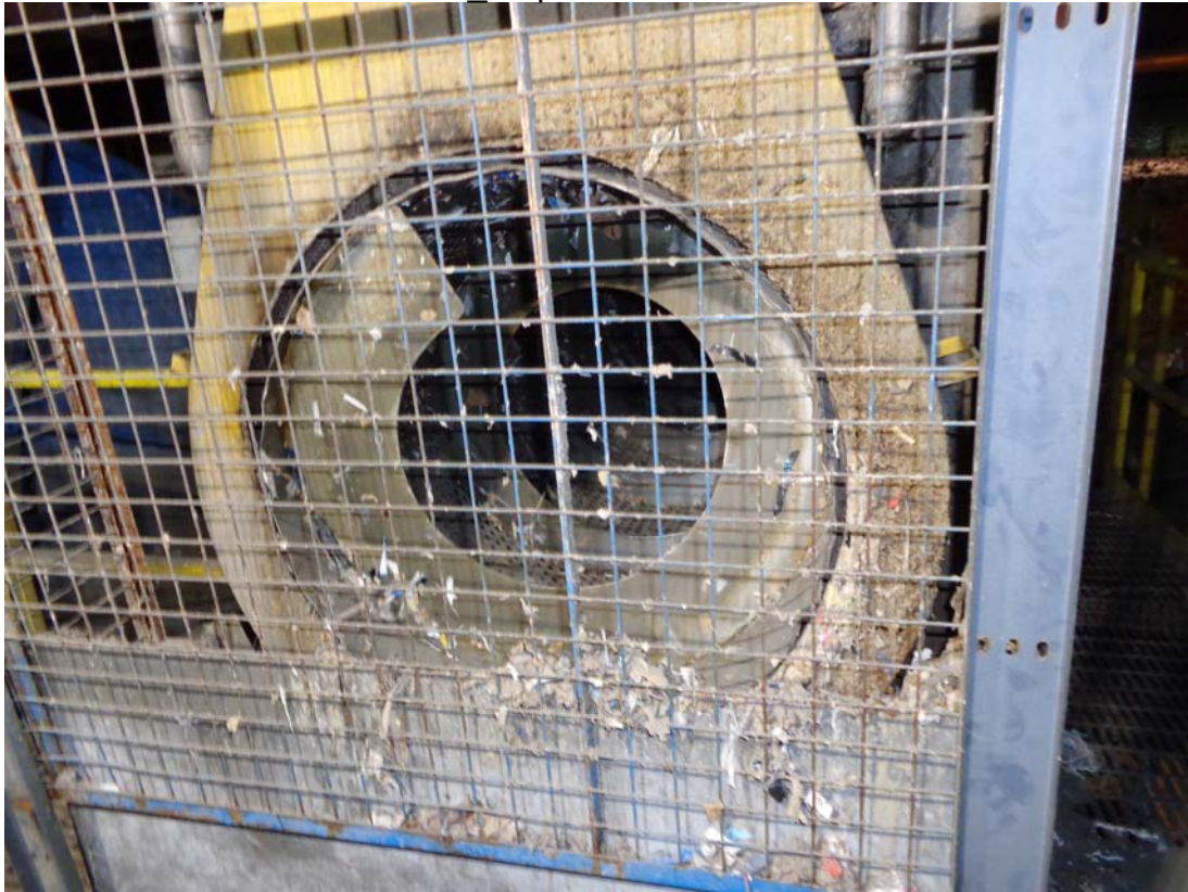
42117d Pulper HD 24 Contaminex Detrasher 1