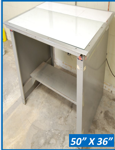
50" X 36"