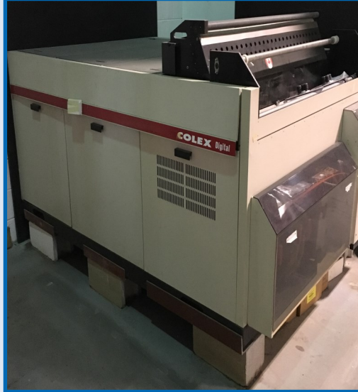
CYMBOLIC SCIENCES LIGHTJET 430 WIDE FORMAT PRINTER W/ COLEX DIGITAL PROCESSOR