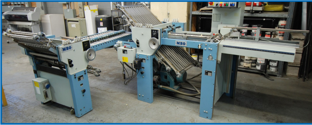
MBO T49 FOLDER & 4 PAGE ROLL-A-WAY