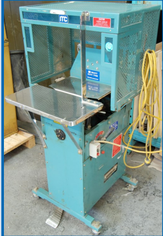
MALOW HEAVY DUTY TYER