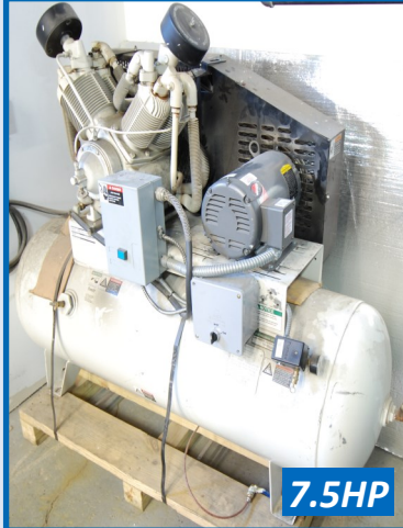
CHAMPION AIR COMPRESSOR