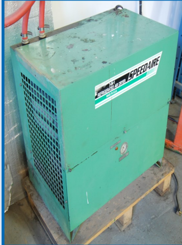
ARROW SPEEDAIR DRYER