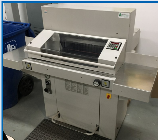
EBA 550 CUTTER

Visit infinityassets.com to view complete specs & additional photos