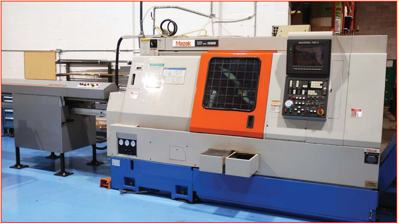
MAZAK MODEL SQT -SUPER QUICK TURN 15MS CNC LATHE, INTERFACED WITH SAMECA MULTISAM 12.65 BAR FEED