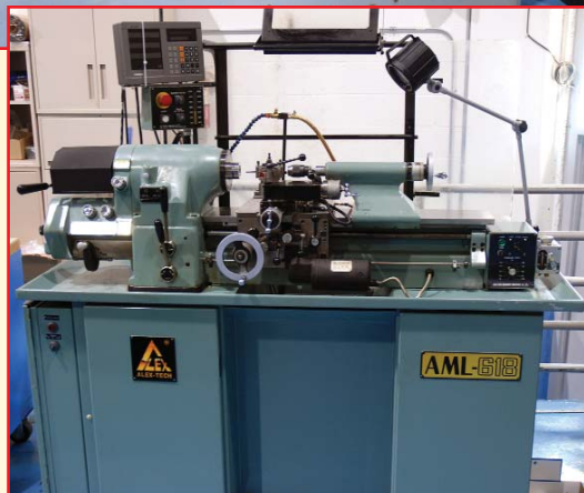
ALEX TECH AML-618 PRECISION LATHE