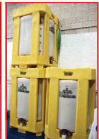
SPIDER TANK STORAGE TOTES