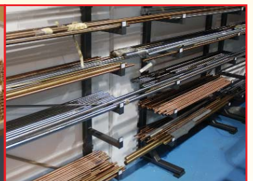
PARTIAL VIEW: LARGE QUANTITY OF RAW MATERIAL & NOZZLE INVENTORY