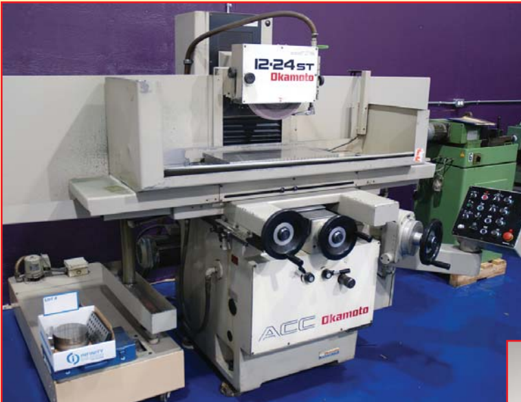
ACC OKAMOTO MODEL ACC-12.24ST, 12"x24" SURFACE GRINDER