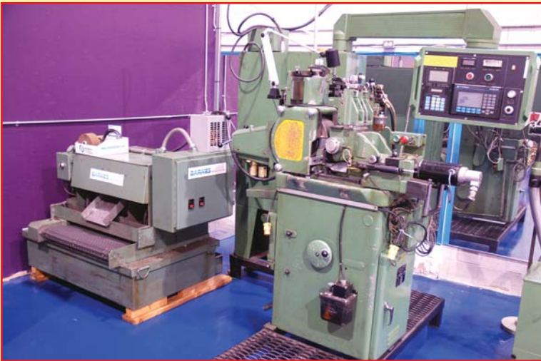
ROYAL MASTER MODEL CG-12X4 CNC CENTERLESS GRINDER