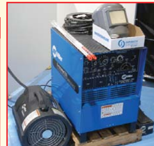
MILLER SYNCROWAVE 250 WELDER

Tuesday June 26th 10:30 am Oxford Web Printing Complete Newspaper & Custom Printing Facility & Real Estate