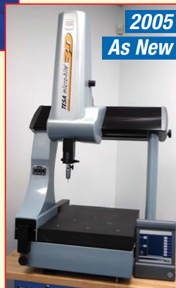
TESA MICRO HITE 3D COORDINATE MEASURING MACHINE