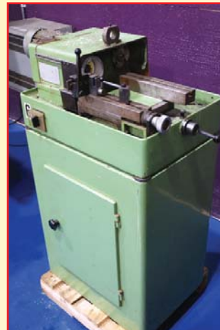
DME PRECISION PIN CUT OFF & GRINDING MACHINE MODEL PPC750