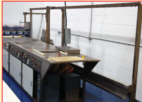
CREST ULTRASONIC 5 STATION ROBOTIC DIPPING LINE

Behind each Infinity appraisal stands over 3 decades of industrial knowledge and expertise. Let our CPPA certified appraisers conduct your next appraisal. Call us in complete confidence at 905-669-8893