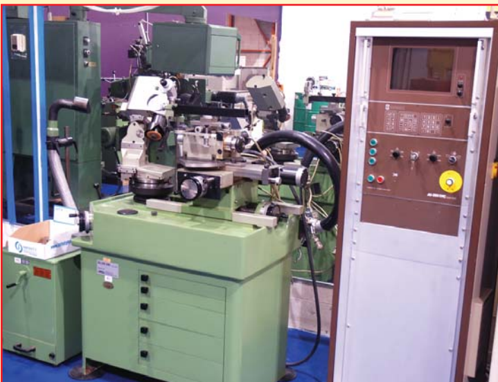
CHRISTEN MODEL AU-250 CNC - TOOL GRINDER