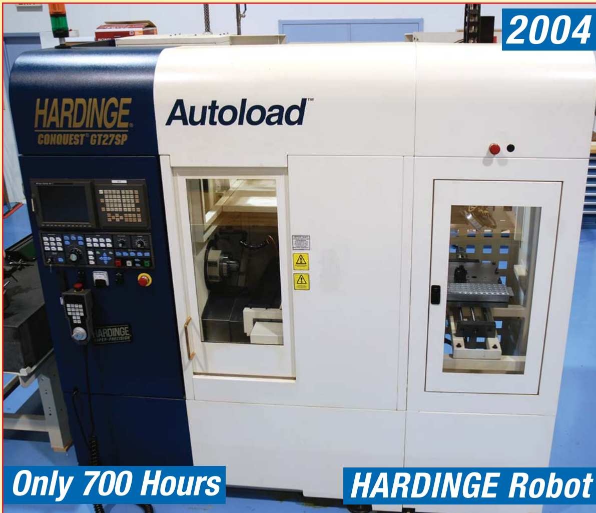
HARDINGE CONQUEST GT27SP GANG TOOL CNC LATHE