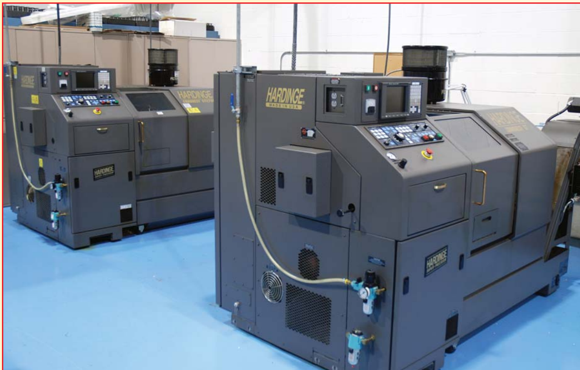
HARDINGE CONQUEST GT, MODEL CS-GT CNC LATHES

Huge Quantity Of New And Mint Condition HARDINGE Collets, Tooling And Consumable Tooling