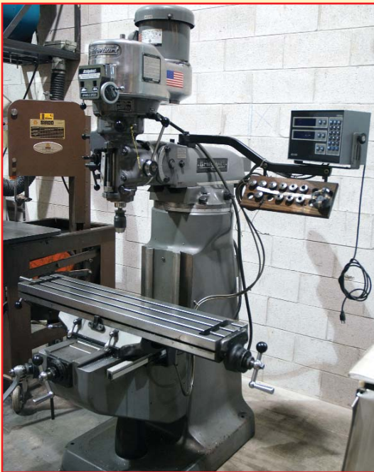
BRIDGEPORT SERIES 1 MILL

Huge Quantity Of Assorted Tooling, Tool Holders, Cutters, Large Selection Of Mint Condition LISTA Cabinets, Tables, Storage Systems, 3 SPIDER TANK Totes, 6 Assorted Parts Cleaners, Assorted Raw Material, WIP Inventory, Assorted Hoses, Foam, Precision Vices, Gage Block Sets, Precision Lights, Office Furniture & Equipment