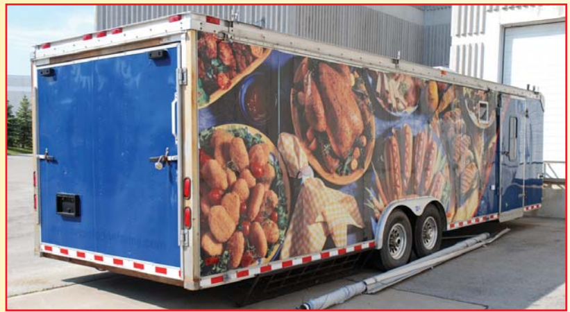
PACE AMERICAN 30' VEHICLE & MOBILE KITCHEN TRAILER