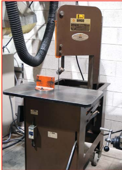
SIRCO ROLL IN BANDSAW