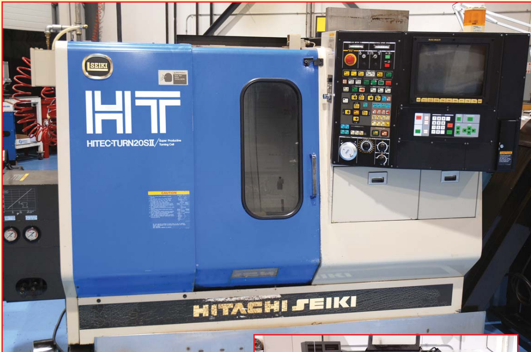
HITACHI SEIKI HITEC-TURN 20SII CNC LATHE