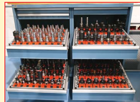
PARTIAL VIEW OF TOOLING