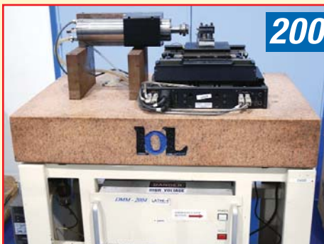
DMM ULTRA HIGH PRECISION LATHE