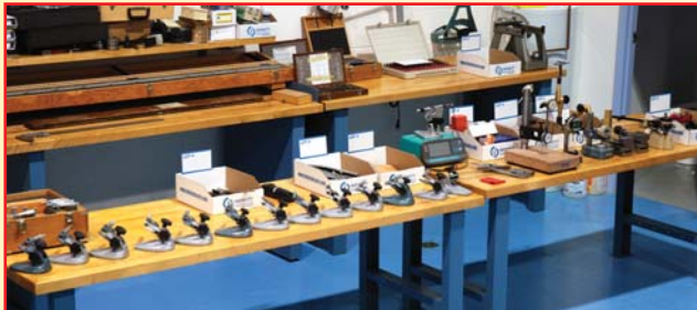
PARTIAL VIEW OF PRECISION INSPECTION EQUIPMENT & AS NEW LISTA WORK TABLES