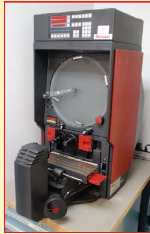
STARRETT COMPARATOR MODEL HB400