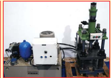
HYPRAMAG HIGH PRECISION SPOTTING PRESS