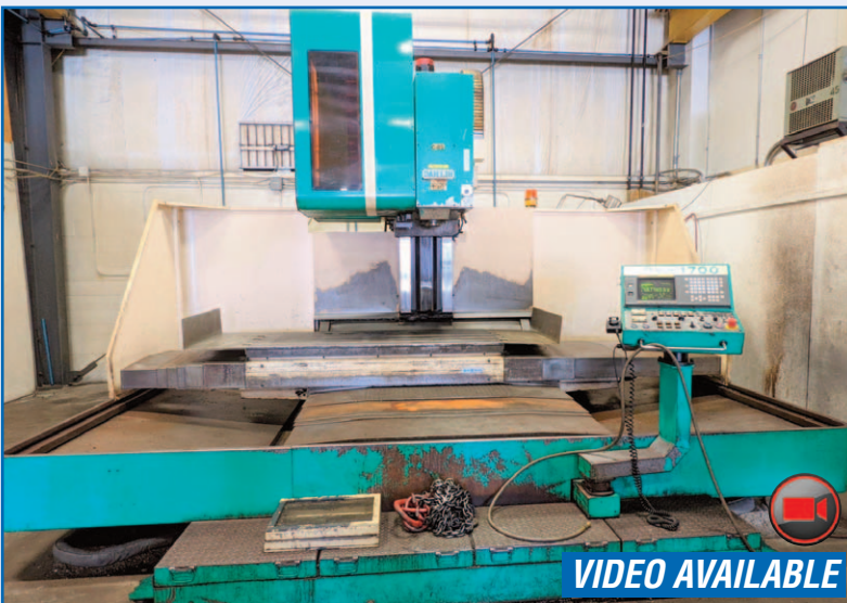
DAHLIHCV-1700 CNC VERTICAL MACHINING CENTER