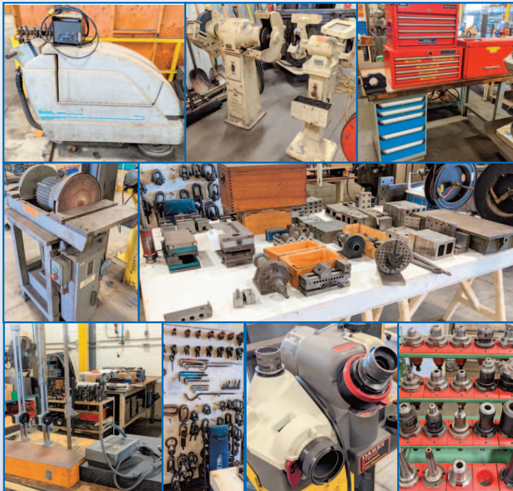
PARTIAL VIEW OF PLANT SUPPORT EQUIPMENT