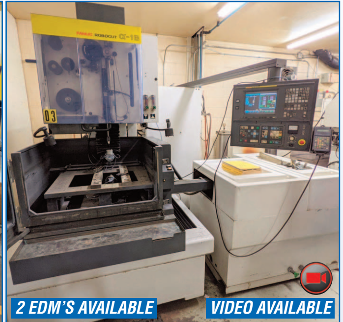
FANUC ROBOCUT ALPHA-1B CNC SUBMERSIBLE WIRE EDM