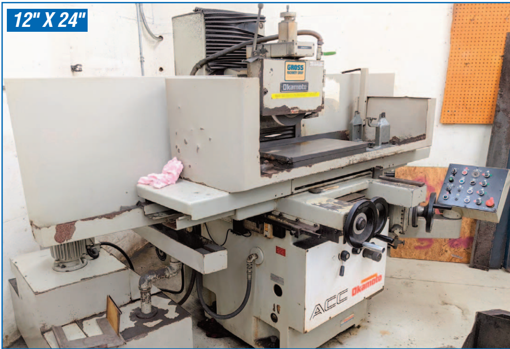
OKAMOTO ACC-12.24ST AUTOMATIC HYDRAULIC SURFACE GRINDER