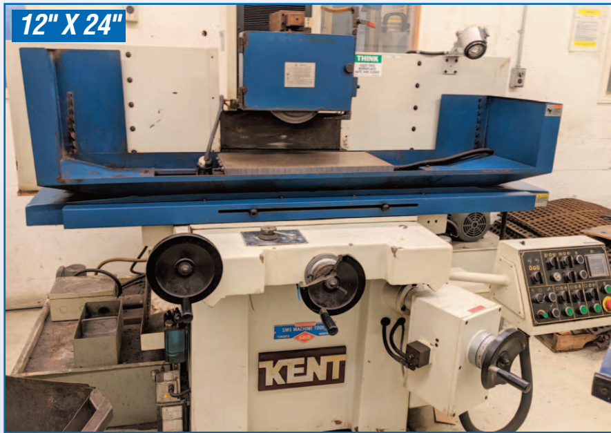
KENT KGS-83AHD AUTOMATIC HYDRAULIC SURFACE GRINDER