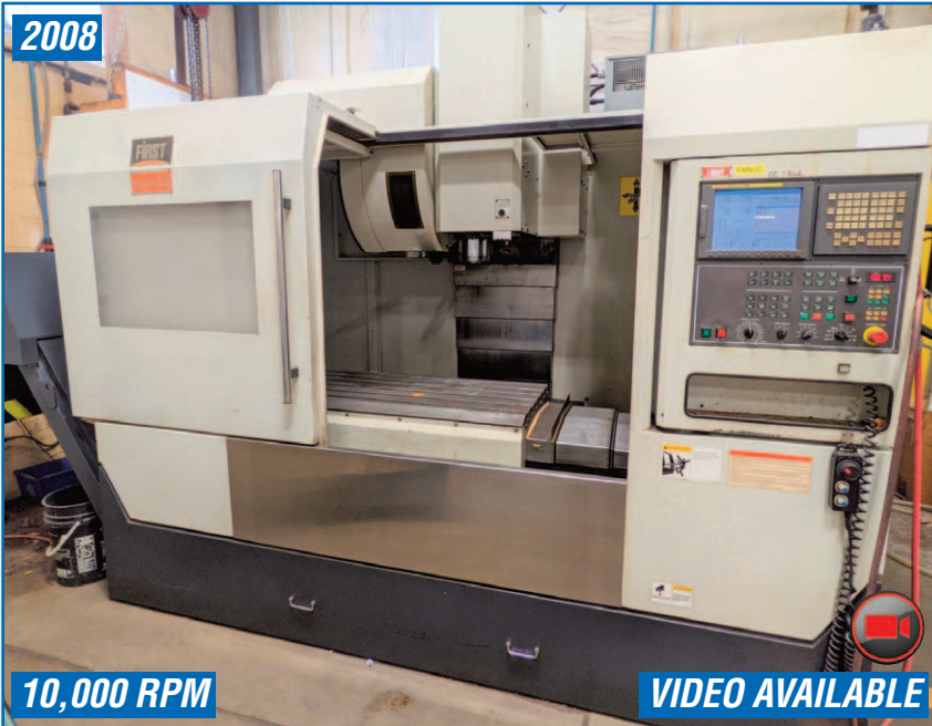
FIRST MCV-1100 CNC VERTICAL MACHINING CENTER

CNC Machine Shop 131 Townline Road, Unit E, Tillsonburg, ON