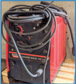
LINCOLN ELECTRIC SQUARE WAVE TIG 175 WELDER