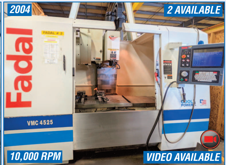
FADAL VMC4525HT CNC VERTICAL MACHINING CENTER