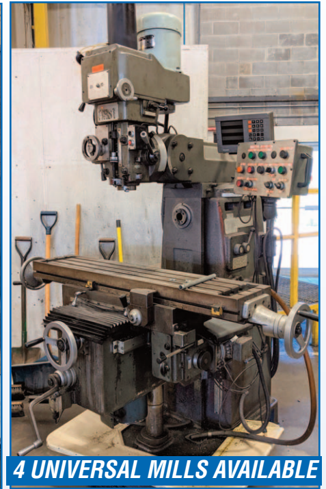
FIRST LC-20VHS UNIVERSAL MILLING MACHINE