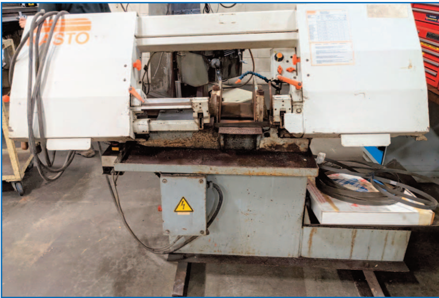
KASTO SBL 280U HORIZONTAL BANDSAW