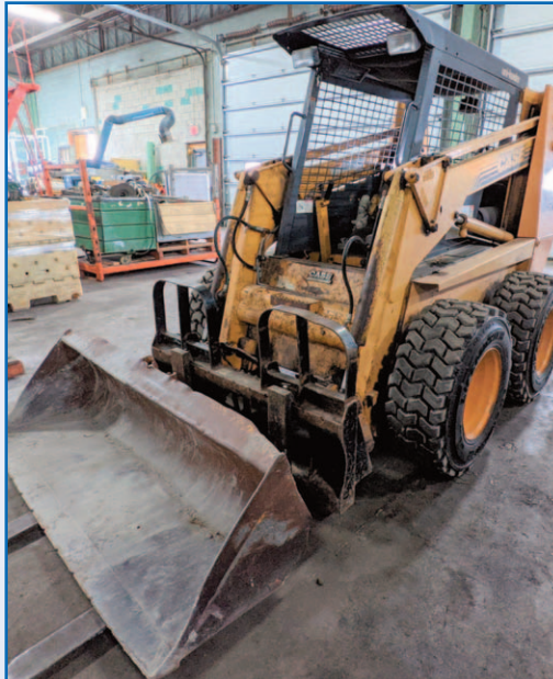
CASE 1845C SKID STEER