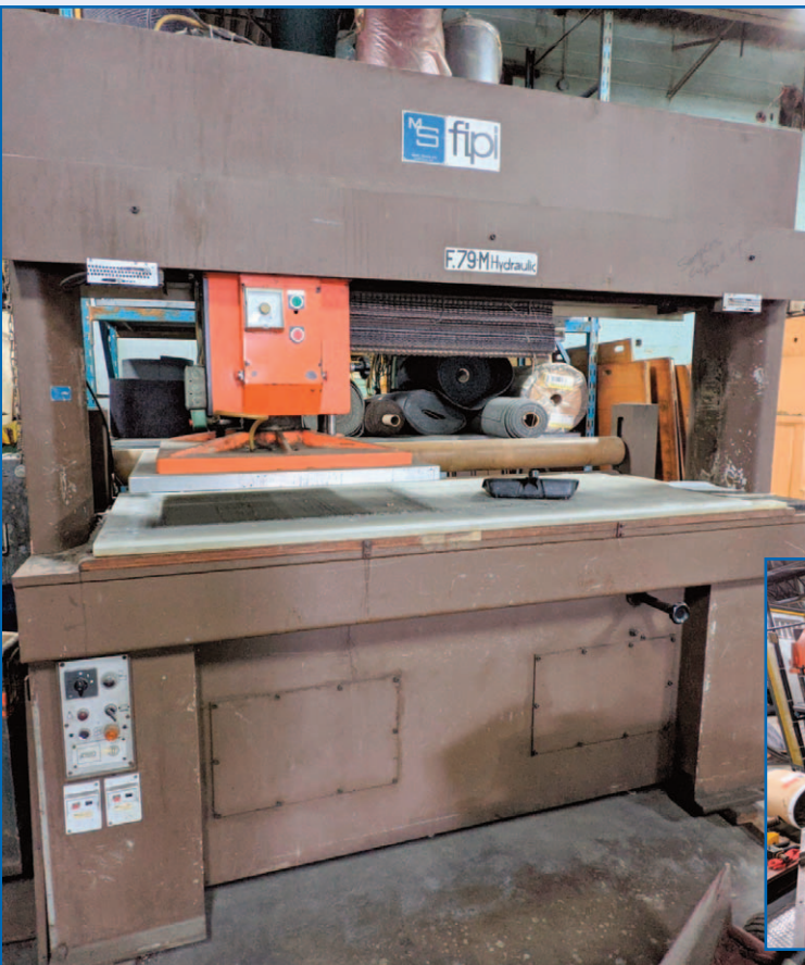
FIPI F.79M HYDRAULIC TRAVELLING HEAD CLICKER PRESS