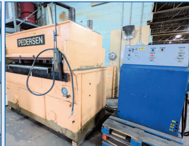
PEDERSON 1602M-16 DIE CUTTING PRESS