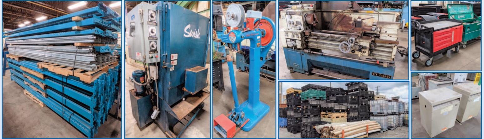
PARTIAL VIEW OF PLANT SUPPORT EQUIPMENT