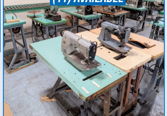
PARTIAL VIEW OF UNION SPECIAL, PFAFF, JUKI, BENZ, SINGER SEWING MACHINES & SERGERS