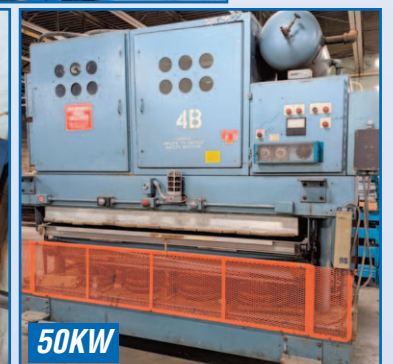
NEMETH ENGINEERING AUTO TRIM4080 HIGH FREQUENCY PRESS