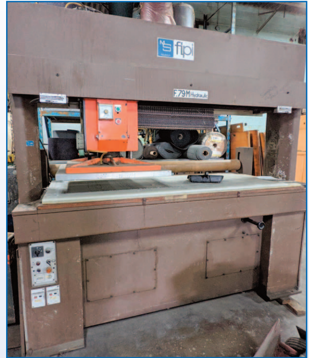
FIPI F.79M HYDRAULIC TRAVELLING HEAD CLICKER PRESS