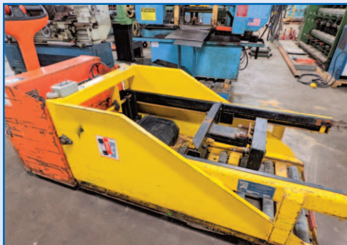
PARTIAL VIEW OF ELECTRIC DIE LIFTS, PALLET JACKS, STORAGE TRAILERS