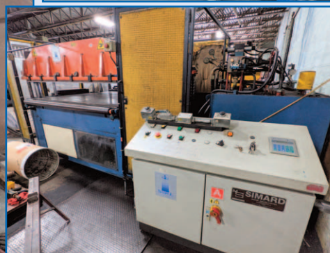
SASPOL DIE CUTTING PRESS