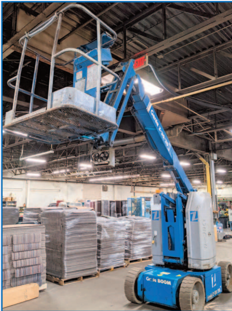
GENIE Z30/20N BOOM LIFT