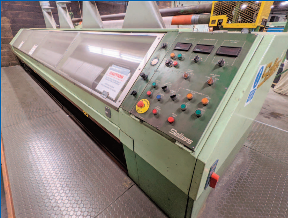
SELLERS CARPET SHEAR