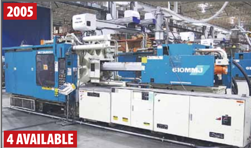
MITSUBISHI 610 TON INJECTION MOLDER