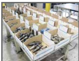
VIEW OF TOOLING