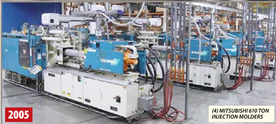
(4) MITSUBISHI 610 TON INJECTION MOLDERS

LARGE QUANTITY OF LATE MODEL ROBOTS, SECONDARY EQUIPMENT, TOOLROOM, MATERIAL HANDLING, PLANT SUPPORT & MISCELLANEOUS