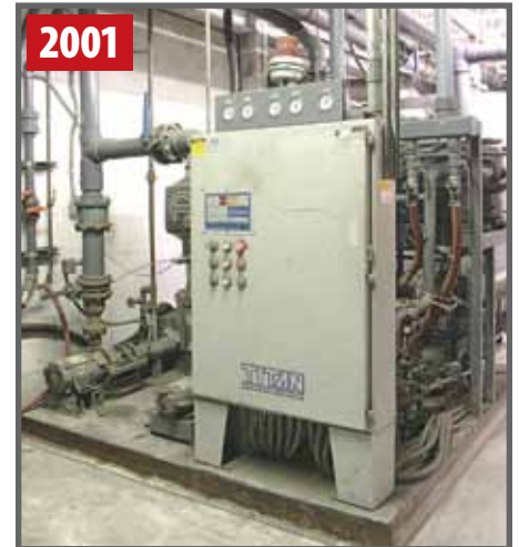
ADVANTAGE 50 TON CHILLER

Sale Date: Thursday, May 16, Beginning at 9:00 AM EDT Location: 787 Renaissance Parkway, Painesville, Ohio 44077