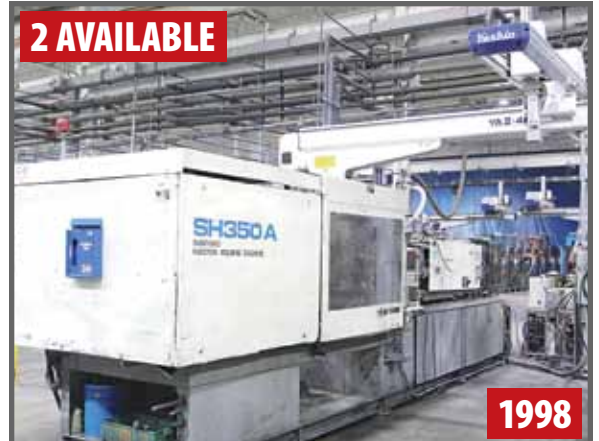
SUMITOMO 350 TON INJECTION MOLDER