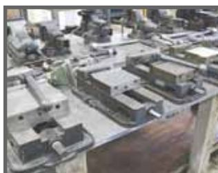
VIEW OF KURT VISES