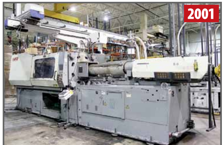
NISSEI 500 TON INJECTION MOLDER

View our current auction schedule at www.perfectionindustrial.com