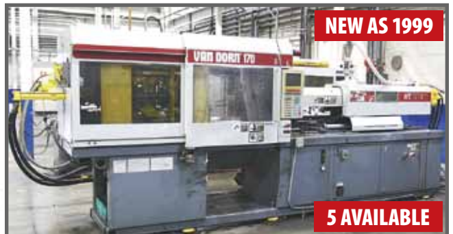
VAN DORN 170 TON INJECTION MOLDER

This brochure is only a partial listing. Please visit our website www.perfectionindustrial.com for more detailed listings and photos.