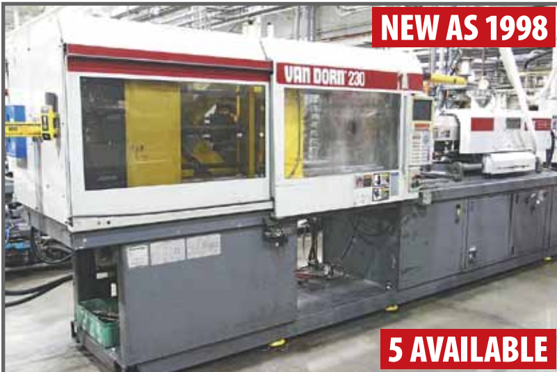
VAN DORN 230 TON INJECTION MOLDER