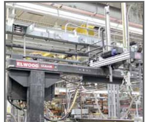
MARK II 360EL3S SERVO ROBOT

View our current auction schedule at www.perfectionindustrial.com