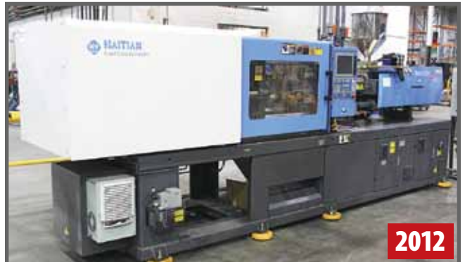
HAITIAN 180 TON INJECTION MOLDER