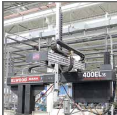
MARK II 400EL3S SERVO ROBOT