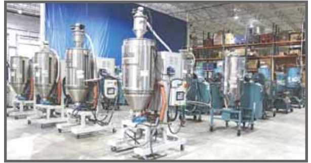
VIEW OF MATERIAL DRYERS

(2) CONAIR D150 MATERIAL DRYERS , CS150 Carousel Dryer Microprocessor Control, w/Model CH24-18 Drying Hopper, S/N 154123, Conair Dust Beater Vacuum Loader, Semi-Portable Stand