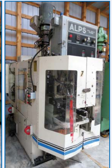
1993 CINCINATTI MILACRON 6065 AUTOBLOW single extrusion blow molder with dual trim 175mm die head, visi-stripe capable, extra screw, vacuum loader, 480 volts s/n na #7