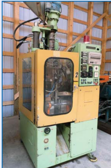
1979 HAYSSEN 2125 single extrusion, single die blow molder with extra die head and manual loader, with dual 250ml & 500ml dies (28-410mm), 220 volt, s/n na #2