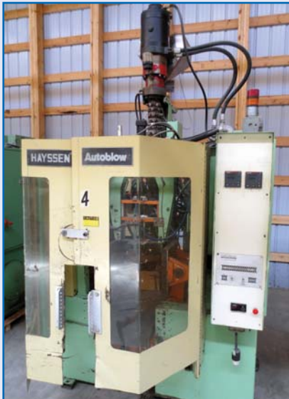
1984 HAYSSEN 5065 AUTOBLOW single extrusion, single die blow molder with dual 175mm die-head, upgraded PLC, vacuum loader, 480 volt, s/n na #4