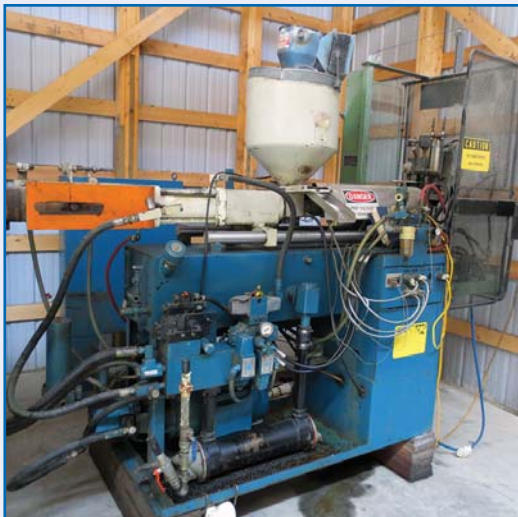
1979 IMPCO B-13 single extrusion, single die blow molder, 600 volt s/n na #1