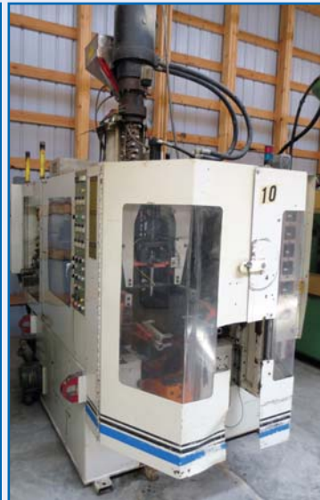
1993 CINCINATTI MILACRON 6065 AUTOBLOW single extrusion, single die blow molder with single die-head with machine trim, visi-stripe capable, vacuum loader, 480 volt s/n na #10