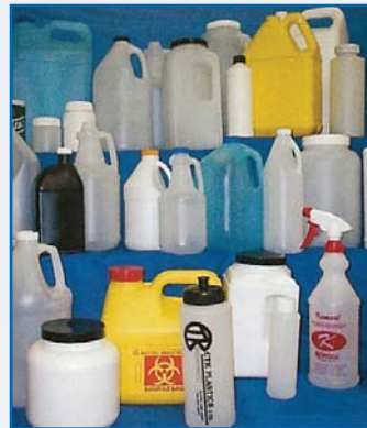
PRODUCT DIES/MOLDS – round, square and rectangular bottle molds with assorted necks, capacity: 250ml, 500ml, 909ml, 1L, 2L, 2.5L, 3.6L, 4L, 5L, 10L.