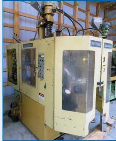
1986 HAYSSEN 5065 AUTOBLOW single extrusion, single die blow molder with upgraded PLC & 2 new screws, vacuum loader, 600 volt, s/n na #3