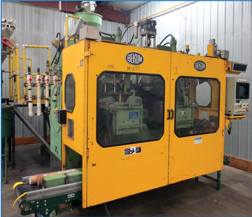
1991 BEKUM H-155 single extrusion, double die blow molder with MACO 8000 control, 90mm extruder, 11.2 ton clamping force, 2 sec. dry cycle, molds: 480mm width, 470mm length, (2) 130mm depth, 220mm daylight, vacuum loader, 480 volt, comes with (2) 5L F-Style Jug molds, 38-400 neck size s/n 155D004.5 #12