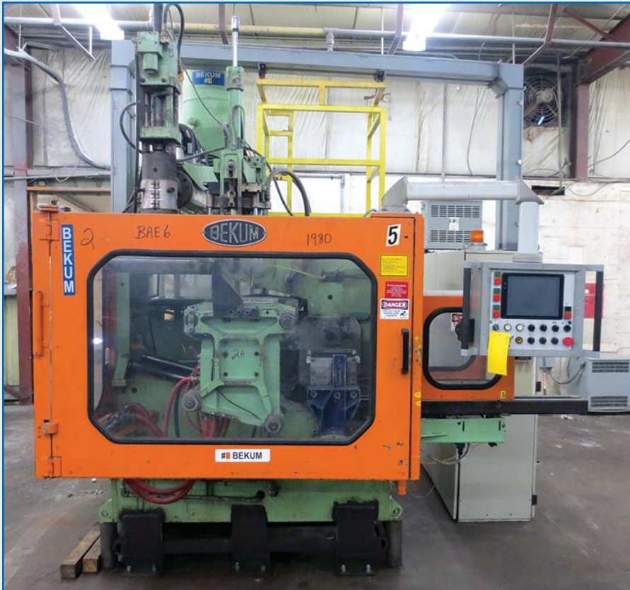
1980 (Complete rebuild in 2003) BEKUM BAE 6 single extrusion, single die blow molder with BEKUM S601 extruder, 60hp, vacuum loader, 600 volt comes with 10L 63 mm neck with handle mold s/n 52440034 #5