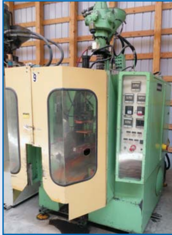
1988 HAYSSEN 5065 AUTOBLOW single extrusion, single die blow molder with upgraded PLC, vacuum loader, 600 volt, s/n na #9