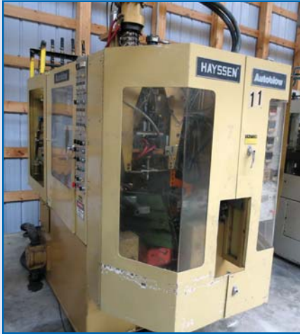
1990 HAYSSEN 6065 AUTOBLOW single extrusion, single die blow molder with vacuum loader, 480 volt, s/n na #11