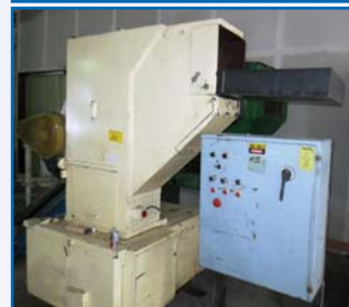
ALSO: FOREMOST, NEMCO, NELMOR granulators, spare parts, testing equipment, conveyors, approx. 20,000 lbs. of AG, regrind and masterbatch