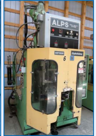
1986 HAYSSEN 5065 AUTOBLOW single extrusion, single die blow molder with trim dual 175mm die-head, PLC, vacuum loader, 600 volt, s/n na #6