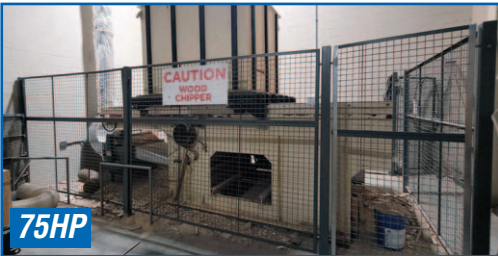
HAAS HTLL 145/185 WOODCHIPPER