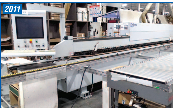
HOMAG KAL 210 EDITION EDGE BANDER