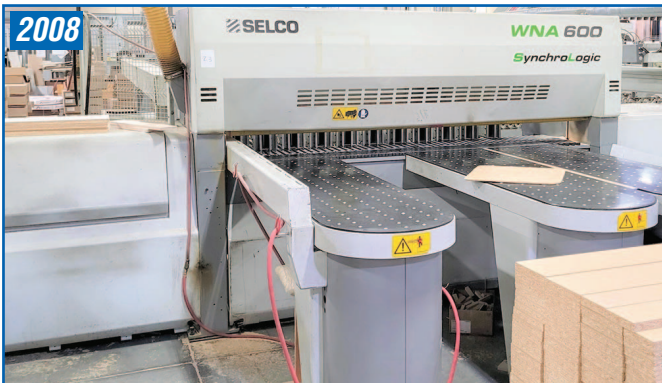
SELCO WNA 600 SLC CNC ANGULAR PANEL SAW