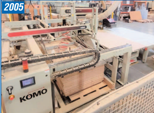
KOMO VR510 MACHI II CNC ROUTER