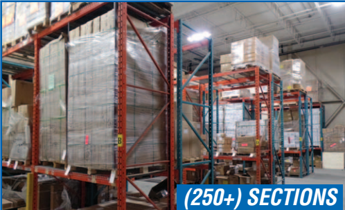
PARTIAL VIEW OF PALLET RACKING