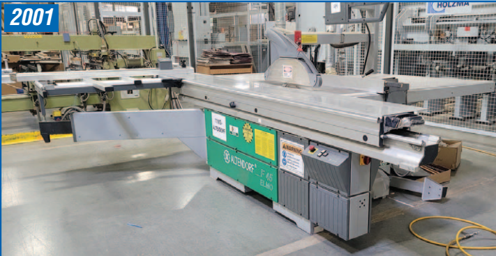
ALTENDORF F45 ELMO CE CNC SLIDING TABLE SAW