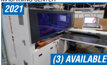
HUAHUA SKH-612HS 6-SIDE CNC MACHINING & PROCESSING CENTER