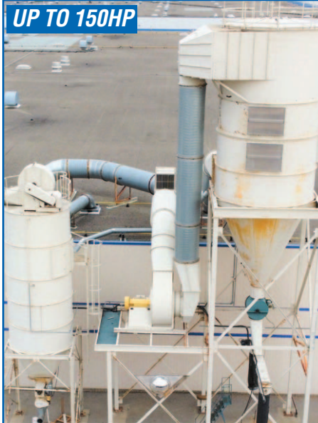
PARTIAL VIEW OF DUST COLLECTION SYSTEMS