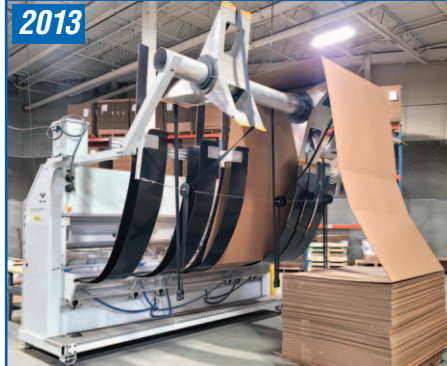
PACKSIZE EM7 PACKAGING SYSTEM