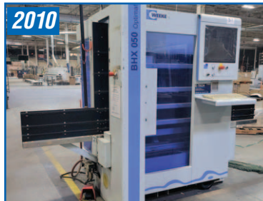
WEEKE BHX 050 VERTICAL CNC MACHINING CENTER