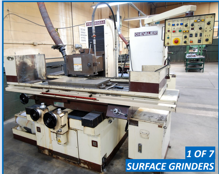
CHEVALIER FSG-1632AD AUTOMATIC SURFACE GRINDER

Auction: Tuesday November 20, 11:00AM (ET)