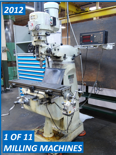
FIRST LC-1-1/2VS VERTICAL MILL