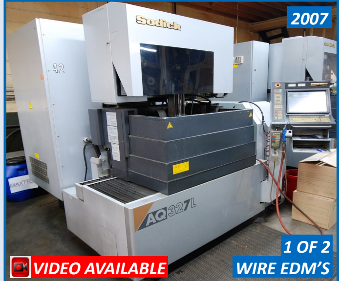
SODICK AQ327L PREMIUM WIRE EDM