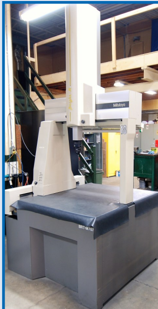
MITUTOYO BRIGHT CMM