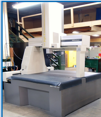
MITUTOYO BRIGHT CMM