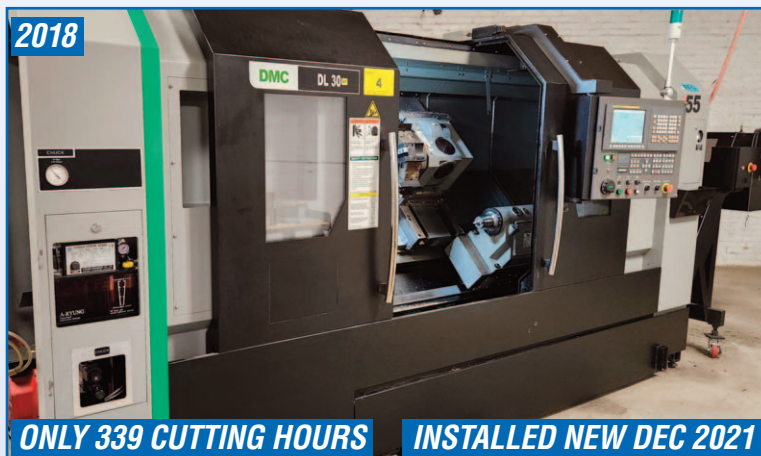
DMC DL30 CNC HEAVY TURNING CENTER