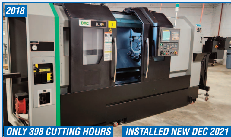
DMC DL30 CNC HEAVY TURNING CENTER