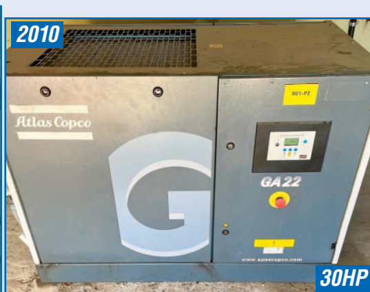
ATLAS COPCO GA22 COMPRESSOR

CLOSES: Tuesday December 13 11:00 AM (ET)