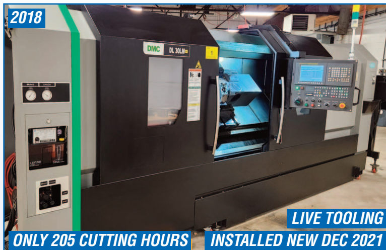
DMC DL30LM CNC HEAVY TURNING CENTER