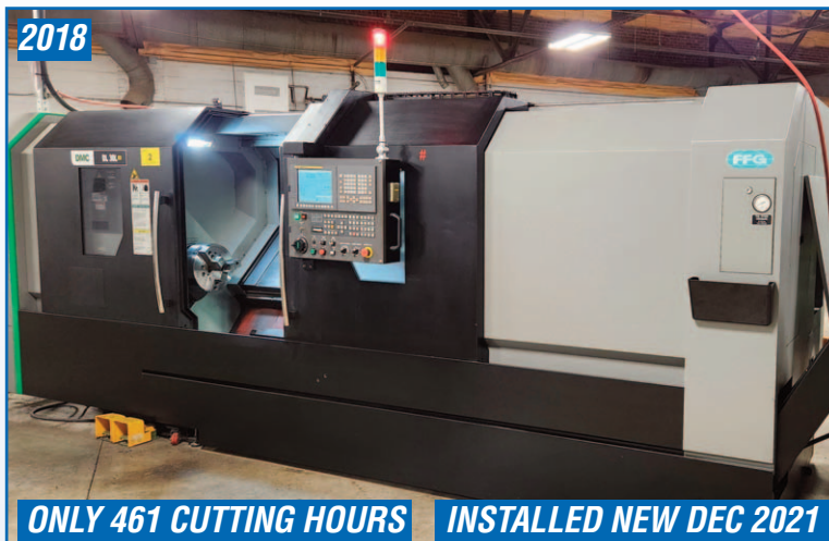
DMC DL30L CNC HEAVY TURNING CENTER