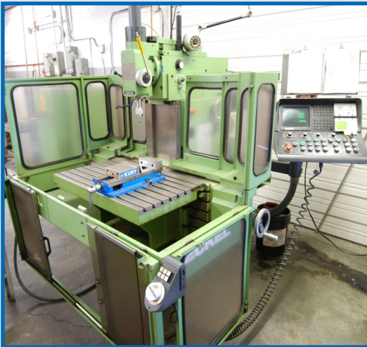
DECKEL FP4NC CNC UNIVERSAL MILL