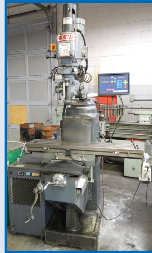
PROSTAR VERTICAL MILL