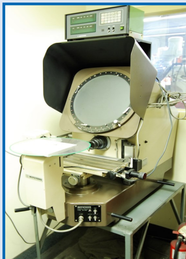
MITUTOYO PH-350 COMPARATOR