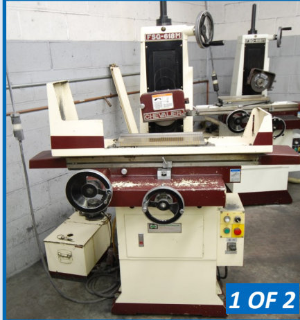
CHEVALIER FSG-618M GRINDER