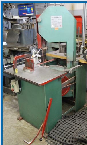
E-R MAIER BANDSAW