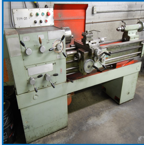
POLAMCO TUM-35 ENGINE LATHE