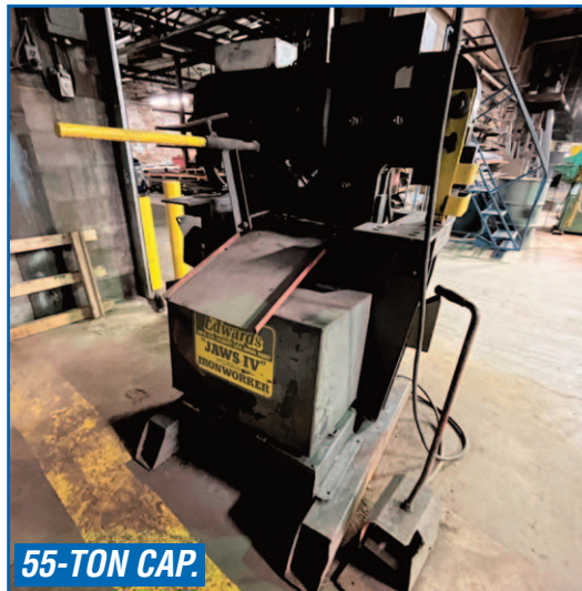
55-TON CAP. EDWARDS JAWS IV IRONWORKER