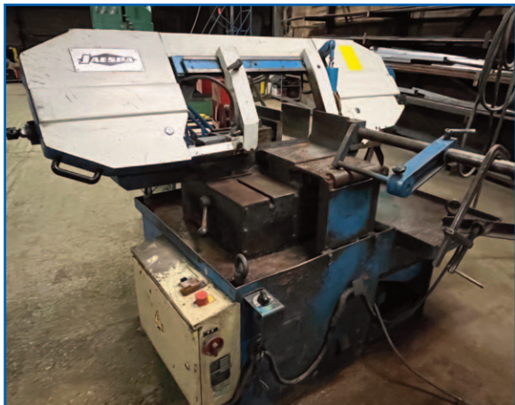
JAESPA W260DG BANDSAW