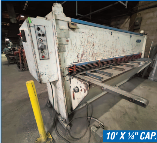
10' X 1/4" CAP. LVD HST 31/6 HYDRAULIC SHEAR