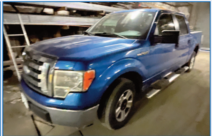
FORD PICKUP TRUCK

Visit infinityassets.com for complete specs and additional photos