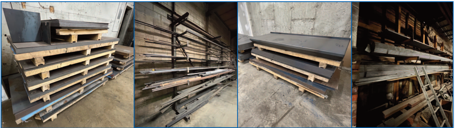
LARGE QTY. OF ASST. STEEL INVENTORY, ANGLE IRON, TUBE, BAR, PLATE, SHEET METAL, ETC.