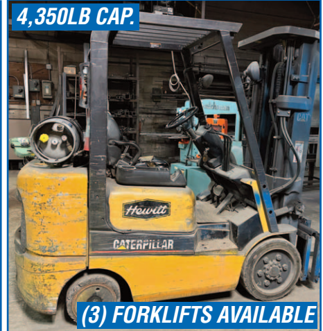
4,350LB CAP. (3) FORKLIFTS AVAILABLE CATERPILLAR GC25K FORKLIFT