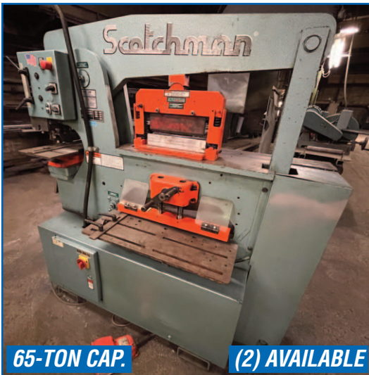
65-TON CAP. (2) AVAILABLE SCOTCHMAN 6509-24M IRONWORKER