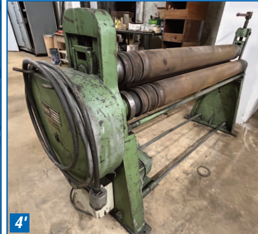
4' PLATE ROLLS