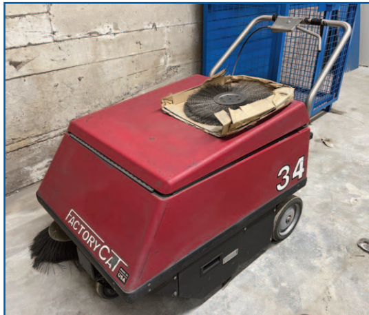
FACTORY CAT FLOOR SWEEPER

This brochure is meant merely as a guide. Infinity Asset Solutions makes no guarantee, expressed or implied, as to the accuracy of the information in this brochure. Buyers should inspect the goods beforehand to satisfy themselves.