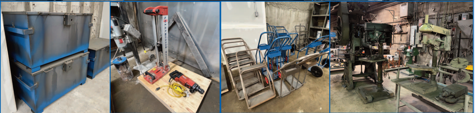
PARTIAL VIEW OF PLANT SUPPORT EQUIPMENT

LARGE QTY. of Asst. Steel Inventory, Angle Iron, Tube, Bar, Plate, Sheet Metal, etc. PLUS: Cantilever Racks, Cutoff Saws, Power & Hand Tools, Metal Carts, Metal Racks, Ladders, Dollies, Compressors, Pipe Threaders, Job Boxes, Tank Dollies, Paint Shaker, Workbenches, Castors, Welding Tables, Sawhorses, Strapping Carts, Fittings, Hardware, Stores Inventory, Belts, Tube Benders, Pallet Jacks, Warehouse Fans, Paint Sprayer, Dump Hoppers, Scaffolding, Mesh Baskets, Office Equipment and Much More!