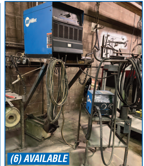
(6) AVAILABLE PARTIAL VIEW OF MILLER WELDERS