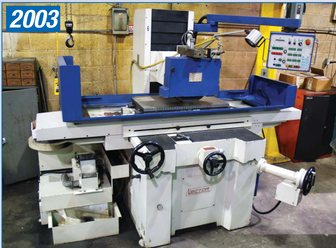
VECTOR 16"x32" FULL AUTO HYDRAULIC SURFACE GRINDER