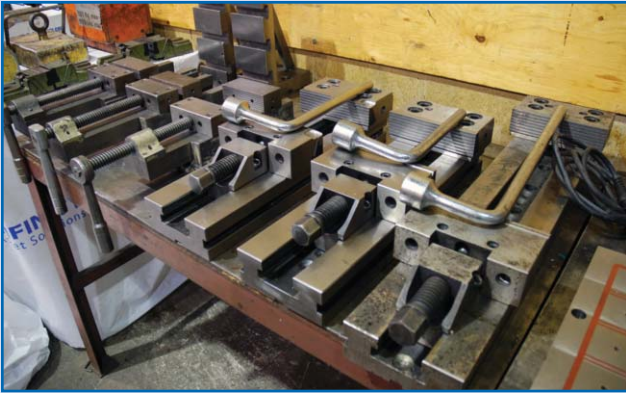
6 PRECISION VISES UP TO 8" INCLUDING GS