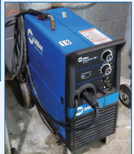
MILLER MILLERMATIC 250

Bid Live ONSITE or ONLINE at BidSpotter.com