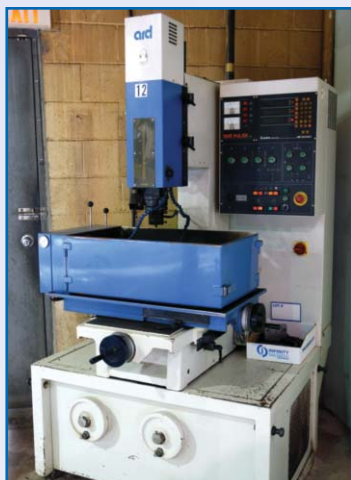
ARD SINKER TYPE EDM, MODEL M30E