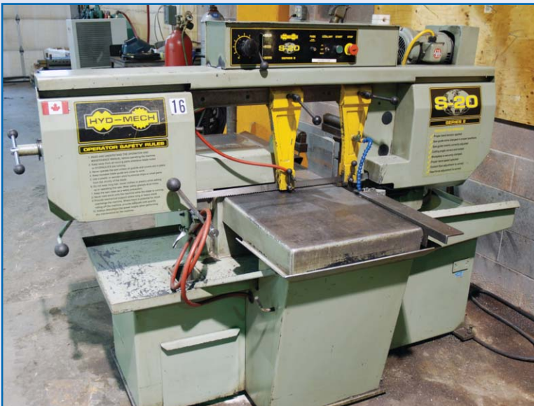
HYD MECH S-20 SERIES II HORIZONTAL BANDSAW