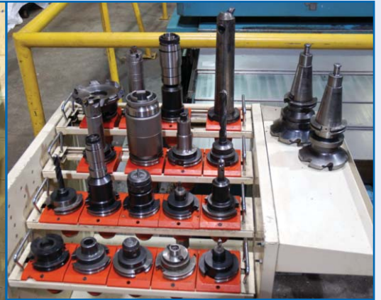
PARTIAL VIEW OF 40 & 50 TAPER TOOLING, TAPPING HEADS