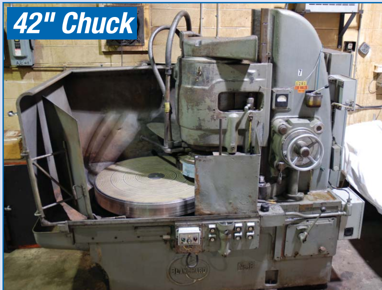
BLANCHARD 42" ROTARY SURFACE GRINDER, MODEL NO 18-42