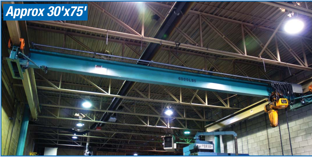
6,000 LB CAP. CRANE SYSTEM