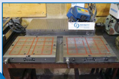
TECHNOMAGNETE 14"X15" MAG PLATES

Bid Live ONSITE or ONLINE at BidSpotter.com