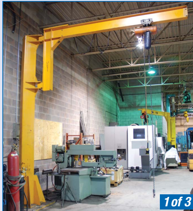
JIB CRANES UP TO 1 TON