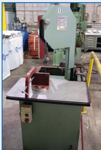
ER MAIER ROLL IN VERTICAL BANDSAW

This brochure is meant merely as a guide. Infinity Asset Solutions makes no guarantee, expressed or implied, as to the accuracy of the information in this brochure. Buyers should inspect the goods beforehand to satisfy themselves.