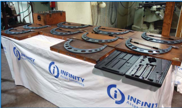
PARTIAL VIEW OF PRECISION INSPECTION