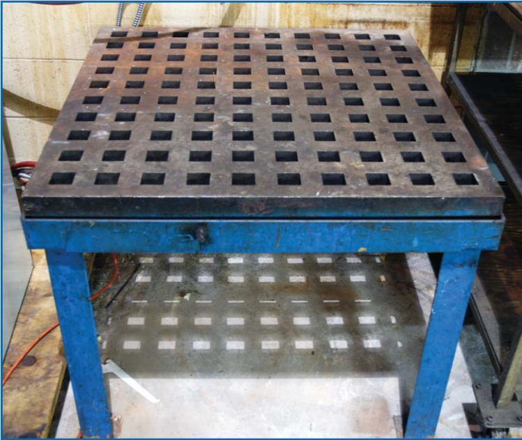
ACORN WELD TABLE