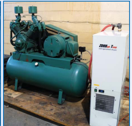
25 HP COMPRESSOR AND HI TEMP DRYER