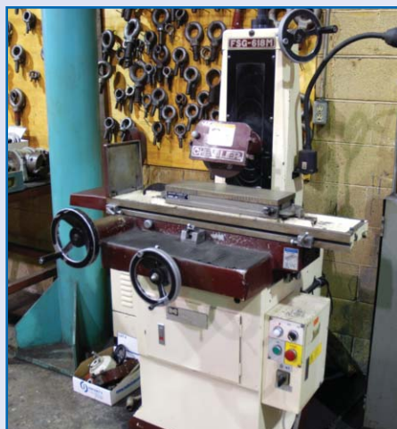
CHEVALIER 6" X 18" SURFACE GRINDER