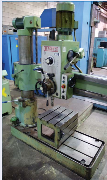
BERGONZI 3' RADIAL ARM DRILL, MODEL F32