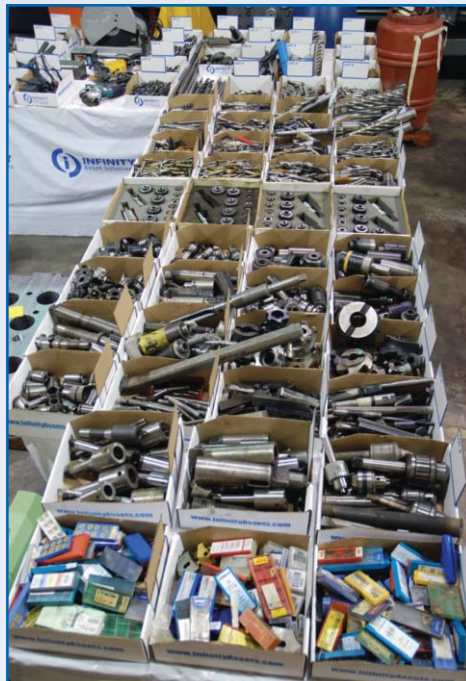
PARTIAL VIEW TABLE ITEMS