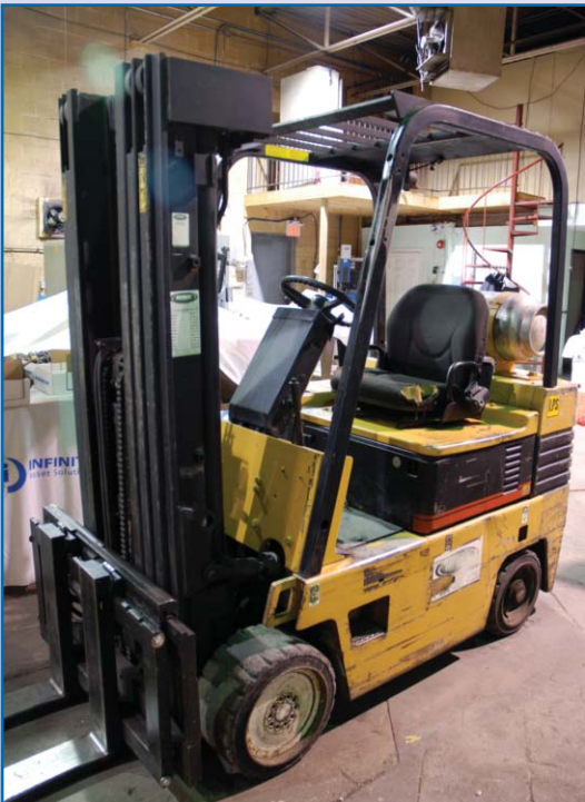
DAEWOO 5,300 LB CAPACITY FORKLIFT

Huge Selection of Parts Inventory, Precision Inspection: STARRETT 2'x3' Surface Plate, Verniers, Calipers, Height Gauges, Lifting Eyes, Chains, Slings, Tool Boxes, Lubricants, Hoses, Safety, Parts Washer, Radial Chucks Up To 12", 4 Mag Lifts Up To 1,100 lb Capacity, 6 Precision Vises up to 8" Including GS, Large Selection of Hand Tools, Power Tools, Tooling, Tapping Heads, Boring, Reamers, Collets, Demagnetizers, Clamps, Precision Blocks, Auto Clamps, Plus: Office Furniture & Equipment