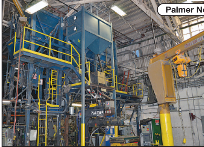
Palmer No Bake Mixer