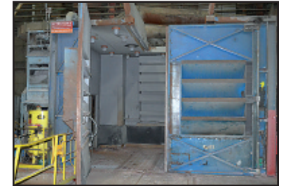
Didion Rotary Shake-out