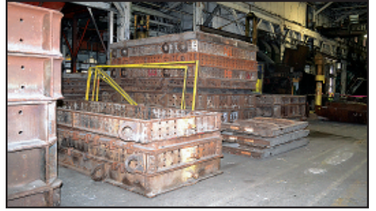
Return Sand System