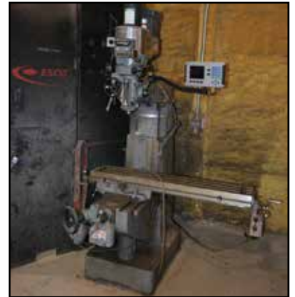
BRIDGEPORT 2-HP Variable Speed Vertical Mill