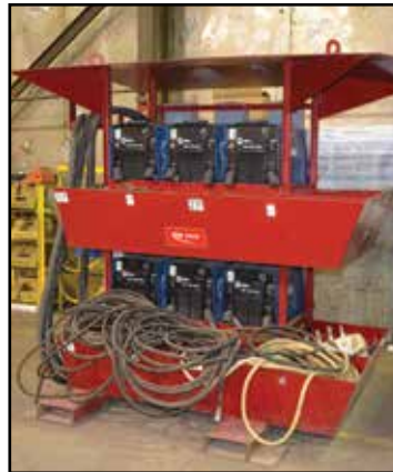
(6) MILLER XMT450 450-AMP MIG/Stick Welders