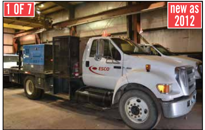
(7) FORD, DODGE & GMC Flatbed Welding Trucks