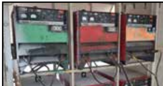
(22) LINCOLN DC600 & (11) MILLER Big Blue Welders