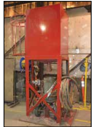
CLEMCO 300-lb. Sand Blast Pot