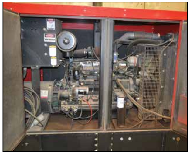
2013 BALDOR TS175 175 Kw Portable Skid-Mounted Diesel Generator