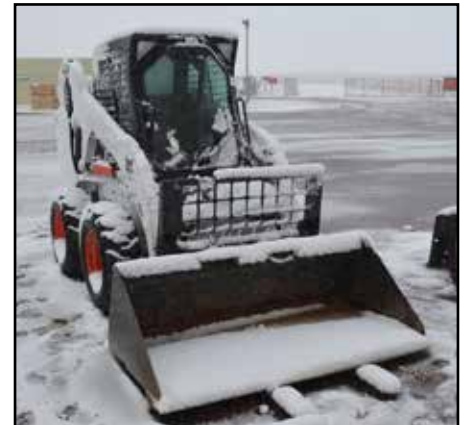
BOBCAT S185 Skid Steer Loader