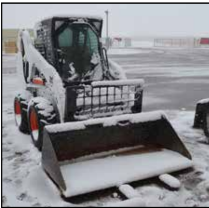
BOBCAT S185 Skid Steer Loader