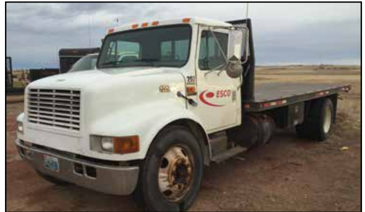
2000 INTERNATIONAL 4700 T444E 18' Flatbed Truck