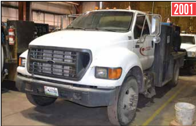
2001 FORD F650 12' Flatbed Welding Truck