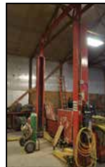
WHEELTRONIC 15,000 lb. Hydraulic Truck Lift

ADDITIONAL ITEMS WILL BE ADDED TO THE SALE. SEE WWW.MYRONBOWLING.COM FOR MORE INFORMATION