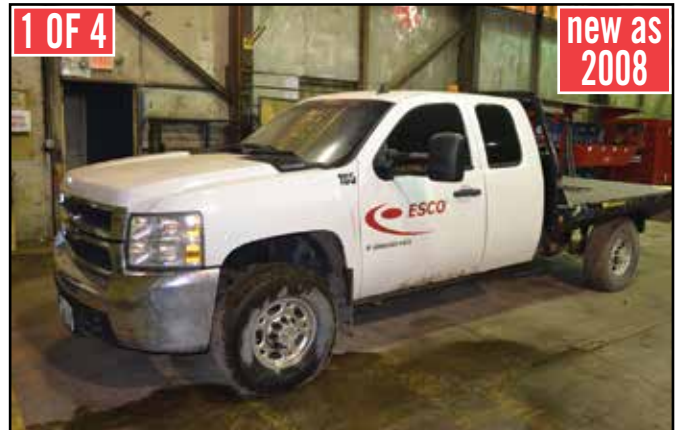
(4) CHEVROLET, DODGE, GMC & INTERNATIONAL Flatbed Trucks