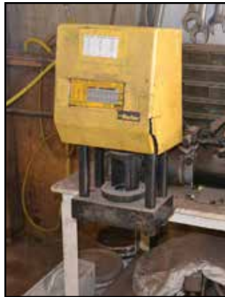
PARKER Hydraulic Hose Crimper