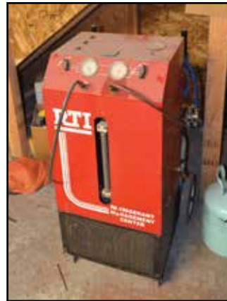
RTI Refrigerant Recovery System