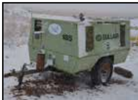
SULLAIR 185 CFM Air Compressor