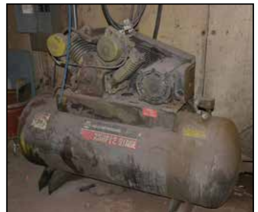
NAPA 7.5-HP Dual 2-Stage Air Compressor