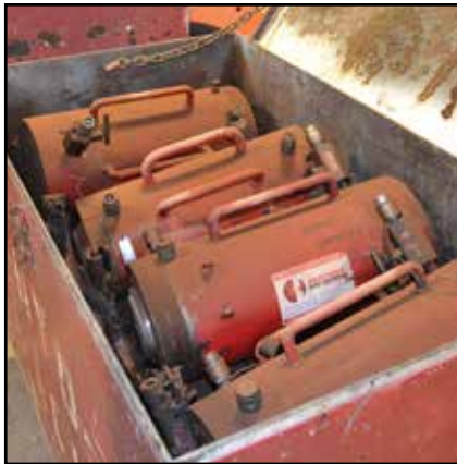
BRAKE SUPPLY 200-Ton (est.) Hydraulic Jack System