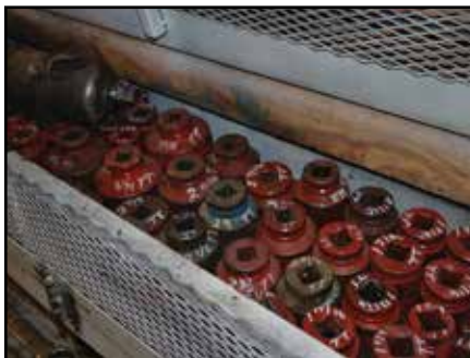
Large Assortment of Impact Wrenches & Large Sockets