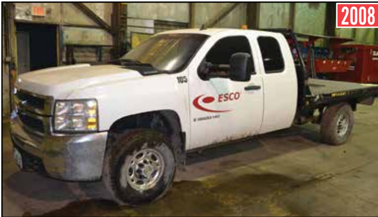
2008 CHEVROLET 3500 HD 8' Flatbed Truck