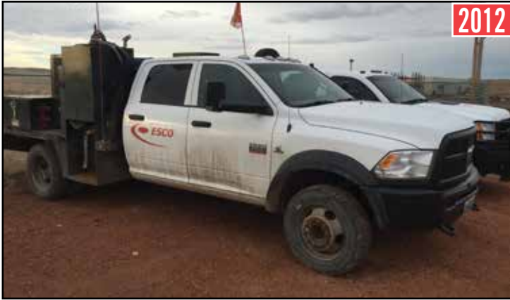
2012 DODGE Ram 4500 8' Flatbed Welding Truck