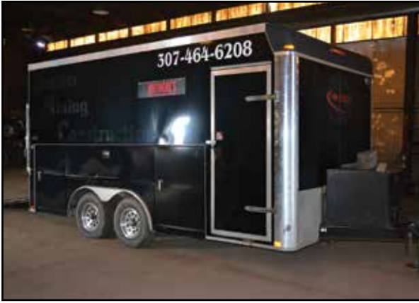
2007 STAHL 18' Enclosed Utility Trailer