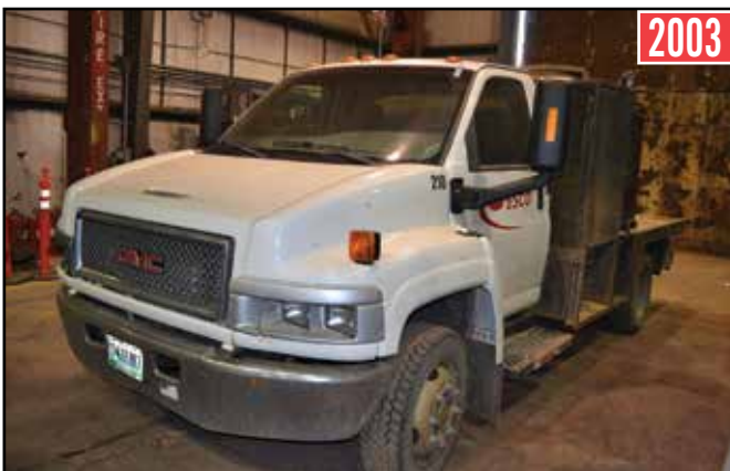
2003 GMC C4500 12' Flatbed Truck