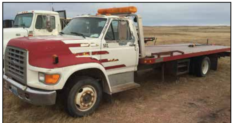
FORD 20' Century Tilt Bed Rollback Truck