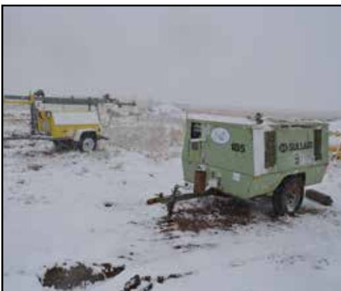
SULLAIR 185 CFM Air Compressor