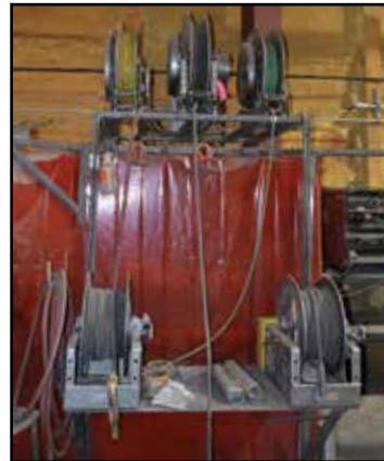
(8) HANNAY Welding Leads