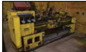
DAEWOO 20" x 66" Geared Head Engine Lathe