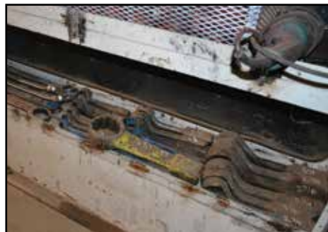
Large Assortment of Hammer Wrenches