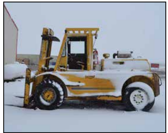
PETTIBONE PP300 30,000-lb Yard Forklift