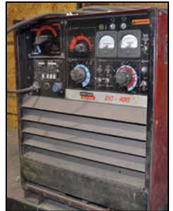
LINCOLN Idealarc DC400 400-AMP MIG/Stick Welder