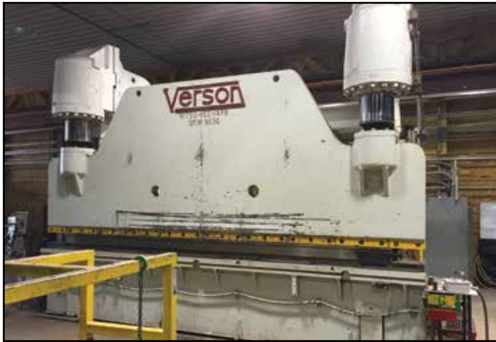
VERSON 750-Ton Hydraulic Press Brake

FACILITY CLOSED - FABRICATION & REPAIR FACILITY