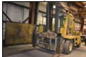
LIFT ALL 36,000-lb. Capacity Yard Forklift