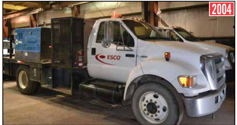
2004 FORD SD 14' Flatbed Welding Truck