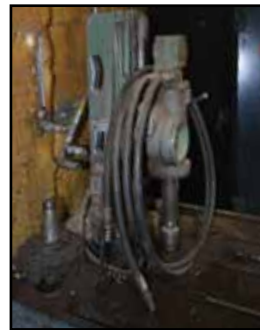
LAMINA HYDRAULICS Portable Magnetic Base Drill w/Power Supply