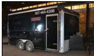
2007 STAHL Utility Trailer