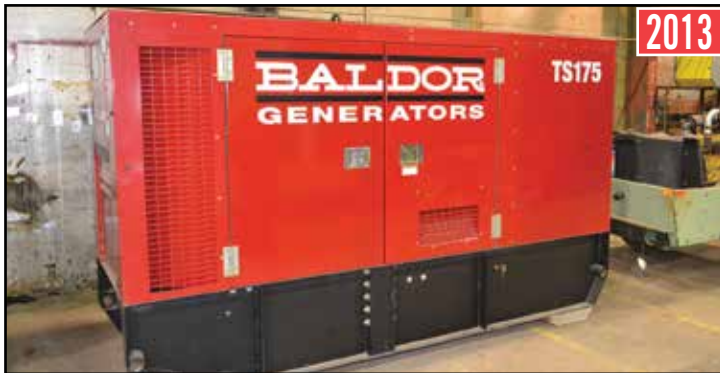
2013 BALDOR TS175 175 kw Diesel Generator