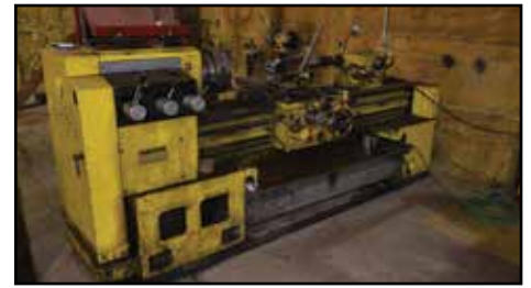
DAEWOO 20" x 66" Geared Head Engine Lathe

(22) LINCOLN Idealarc DC600 600-AMP MIG/Stick Welding Power Supplies w/ Lifting Rack (11) MILLER 500 AMP Big Blue Diesel Air Pack Welder / Generator / Compressors (3) LINCOLN S500 500-AMP MIG Welders w/Lincoln 25-M Feeder MILLER 500 AMP Big Blue Diesel Welder/Generator Model 500D (6) MILLER XMT450 CC/CV 450-AMP MIG/Stick Welding Power Supplies w/ Lifting Rack LINCOLN Idealarc DC400 400-AMP MIG/Stick Welding Power Supply (20) LINCOLN LN-25 Self-Contained Wire Feeders (2) MILLER Pro Heat 35 Heat Treat Induction Heaters , (1) w/Lifting Rack (80) Boxes New LINCOLN L59052 44-lb. Welding Wire THERMAL DYNAMICS Pak Master 100 XL Plus Plasma Cutter w/Cables & Gun (14) 3M Speedglas Fresh Air Welding Hoods w/Personal Air Packs (8) HANNAY Welding Lead & Electrical Cord Reels (5) Heavy Duty Steel Welding Tables : (2) 4' x 8' x 2" • 4'-6" x 10' x 2" • 3'-6" x 72" x 1" • 3' x 5' x 1" & 4' x 4' x 2" Large Quantity Welding Gas Regulators • Welding Leads • Welding Curtains • (10) Torch Carts w/Hoses