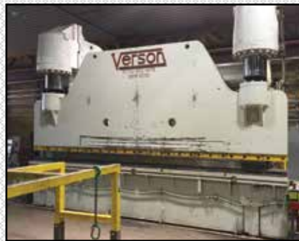
VERSON 750-Ton Hydraulic Press Brake

Myron Bowling Auctioneers Inc. P.O. BOX 369 • ROSS, OHIO 45061