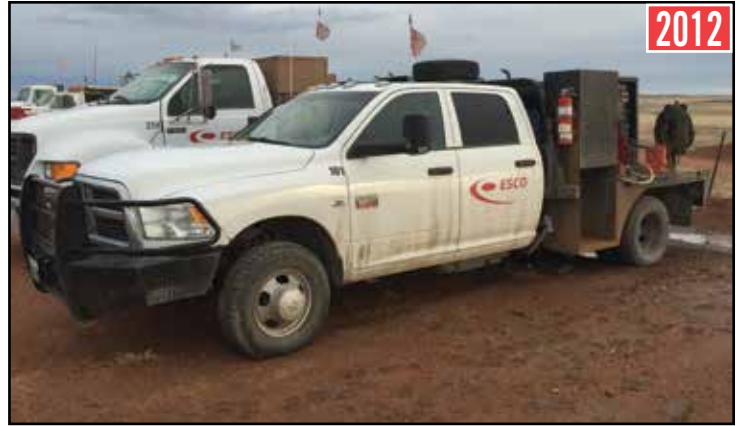
2012 Dodge Ram 3500 10' Flatbed Welding Truck