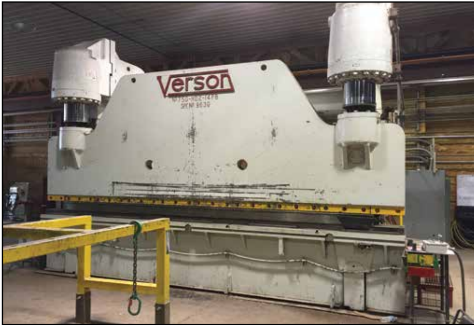
VERSON 750-Ton Hydraulic Press Brake