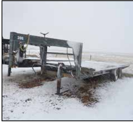
(1 of 2) Custom 20' (est.) T/A Gooseneck Flatbed Trailers