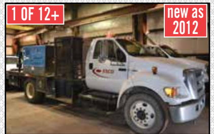
(12+) FORD, DODGE, GMC & CHEVROLET Flatbed Welding & Flatbed Trucks

Myron Bowling Auctioneers Inc. P.O. BOX 369 • ROSS, OHIO 45061