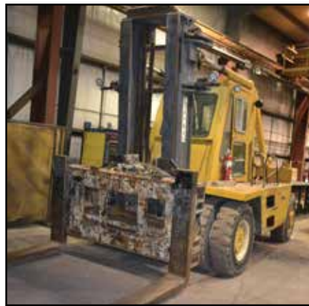
LIFT ALL 3XH360 36,000-lb. Yard Forklift