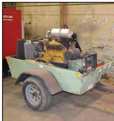
SULLAIR 185 CFM (est.) Air Compressor