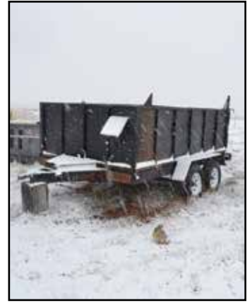
Custom T/A Dump Trailer