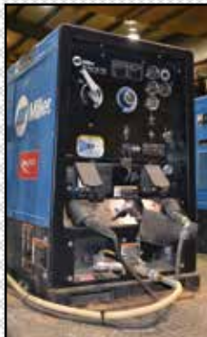
(22) LINCOLN DC600 & (11) MILLER Big Blue Welders