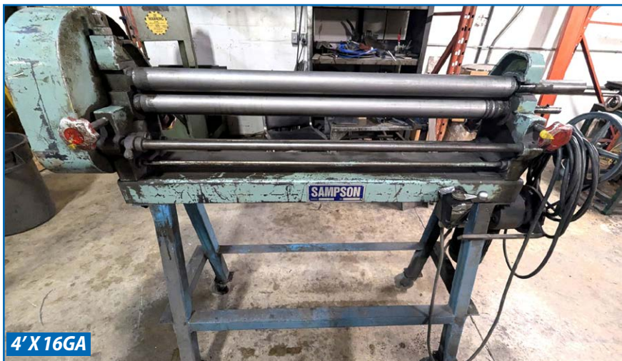
SAMPSON LF-316U MOTORIZED PLATE ROLLS