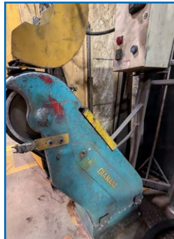
DIAMANT 3" BELT SANDER