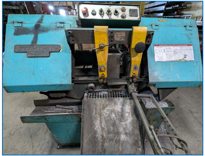
STARTRITE HORIZONTAL BANDSAW