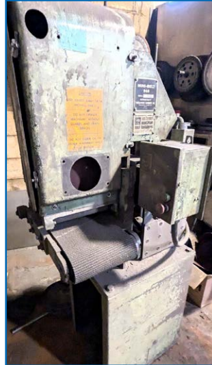
TIMESAVERS MINI-BELT 948 SANDER