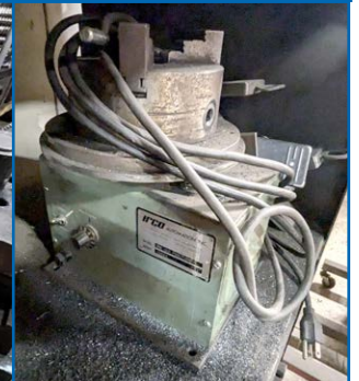
VIEW OF METAL INVENTORY & PLANT SUPPORT EQUIPMENT