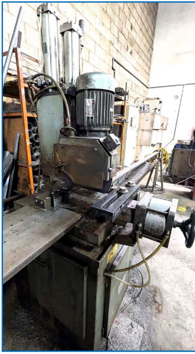
SOCO VS-315C COLD SAW