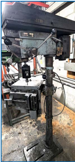
DELTA 16-1/2 DRILL PRESS