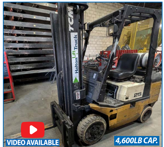
TCM FCG25T7T PROPANE FORKLIFT

CLOSES: Wednesday October 16 th , 11AM ET