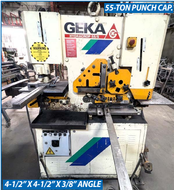
GEKA HYDRACROP 55/S HYDRAULIC IRONWORKER

5985 Atlantic Drive, Unit 6, Mississauga, Ontario