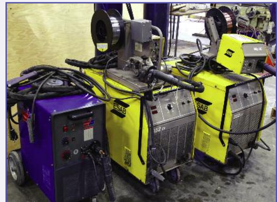
PARTIAL VIEW OF WELDERS