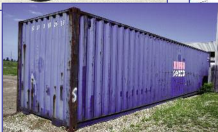
40' SEA CONTAINER