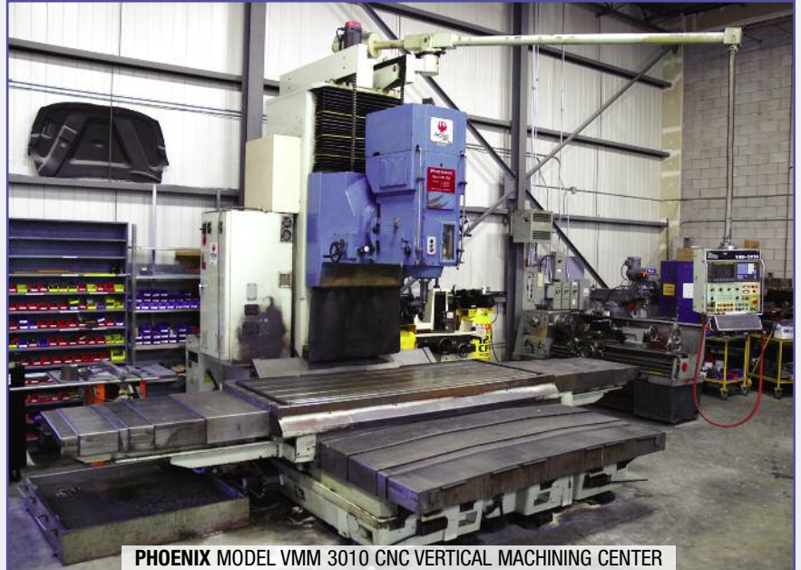
PHOENIX MODEL VMM 3010 CNC VERTICAL MACHINING CENTER