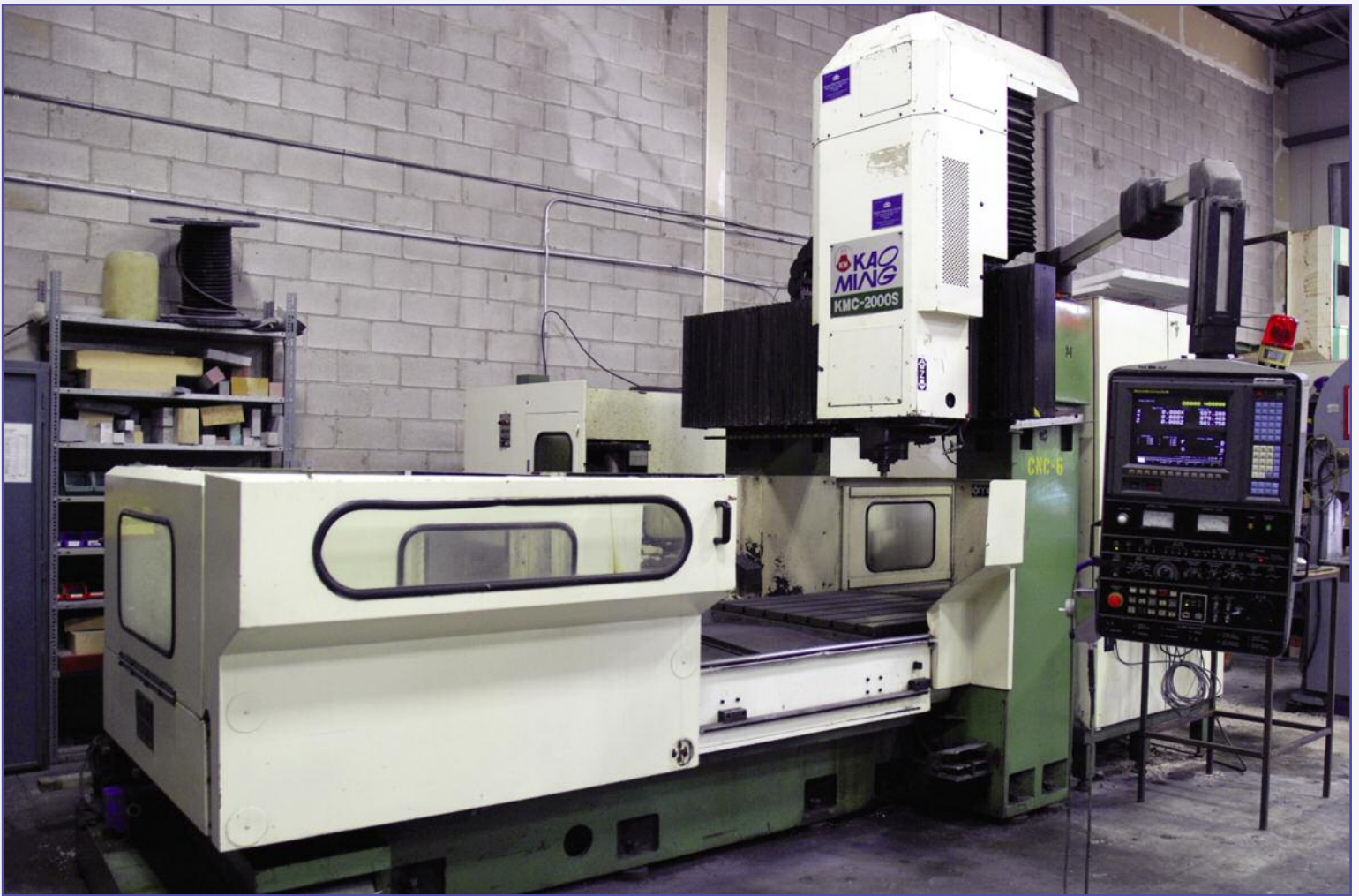
KAO MING KMC 2000S CNC VERTICAL GANTRY MILL