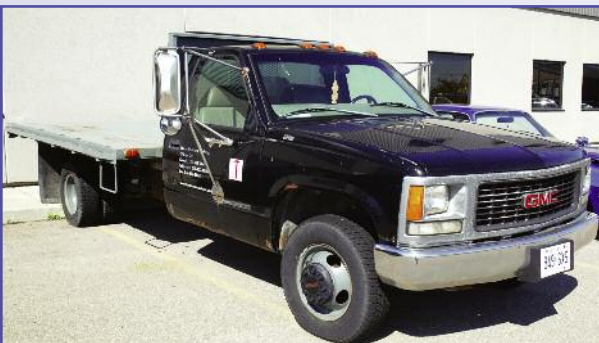
GMC 3500 FLAT BED TRUCK 12' X 8.5'