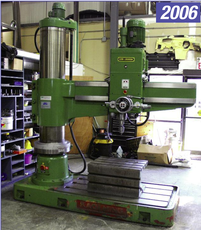
KAO MING KMR 1600 DH 6' RADIAL DRILL