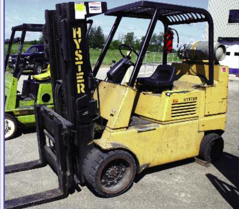
HYSTER 9,300 LB CAPACITY, MODEL S100