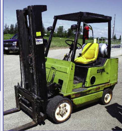
CLARK 4,825 LB CAPACITY, MODEL GCX30