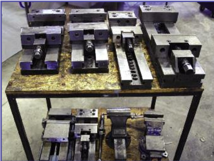
PARTIAL VIEW ASSORTED HEAVY DUTY MACHINING VISES