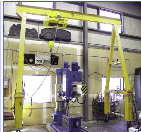
YALE 5 TON PORTABLE A FRAME CRANE