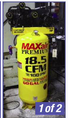
MAXAIR 5 HP AIR COMPRESSOR