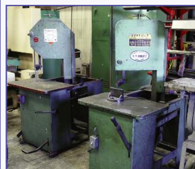
2 ROLL IN BANDSAWS