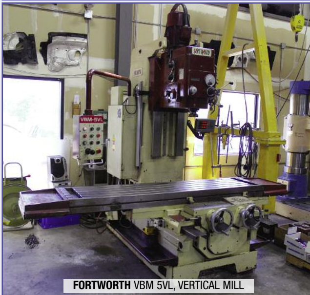
FORTWORTH VBM 5VL, VERTICAL MILL