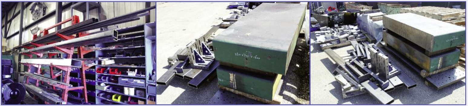
PARTIAL VIEW ASSORTED RAW MATERIAL INCLUDING P20 & D2 TOOL STEEL