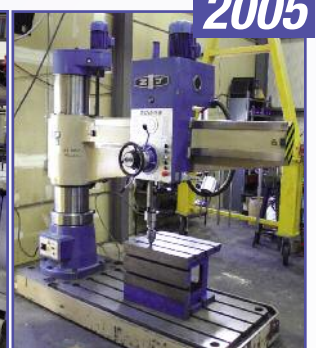
ZJ Z3050 X16- II 4' RADIAL ARM DRILL