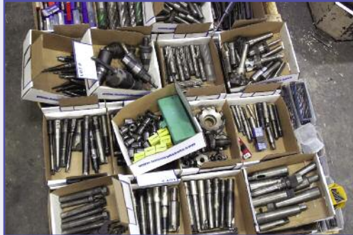
PARTIAL VIEW ASSORTED CUTTERS, DRILLS