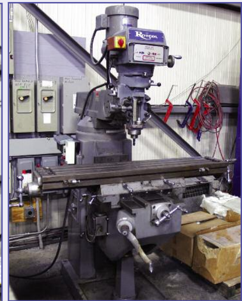
ROYCOL VERTICAL MILL