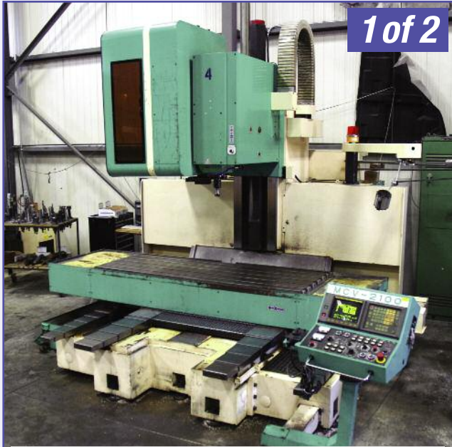
DAHLIH MODEL DL MCV2100 CNC VERTICAL MACHINING CENTER