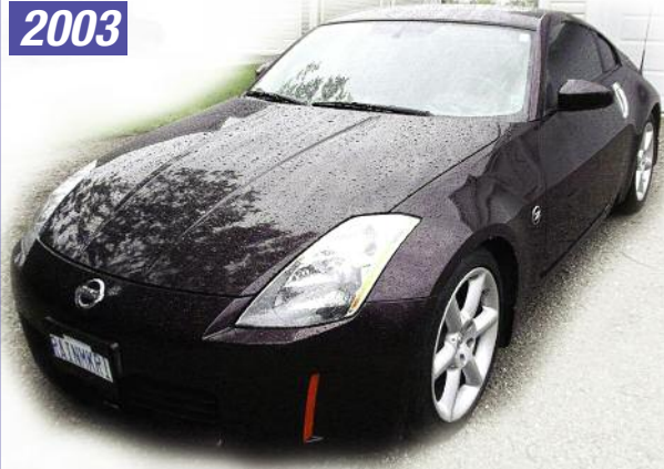
NISSAN 350Z COUPE