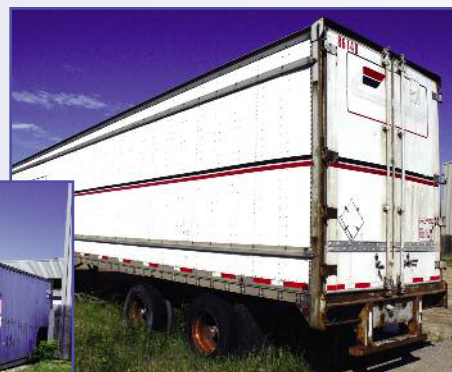
53' STORAGE VAN TRAILER