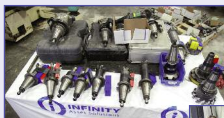
PARTIAL VIEW OF 50 TAPER TOOLING