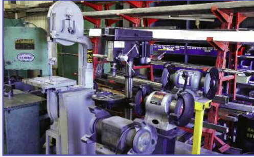
ASSORTED GRINDERS, SAWS, DRILLS