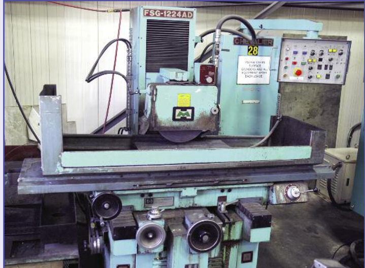
CHEVALIER 12" X 24", Model FSG-1224 AD Hyd. Surface Grinder