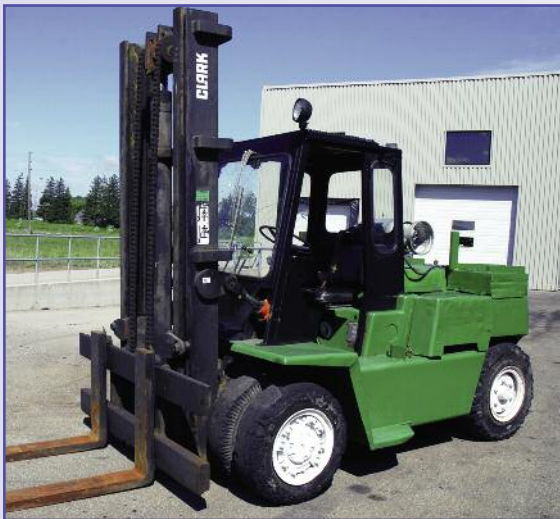
CLARK 15,000 LB CAPACITY, MODEL C500Y150