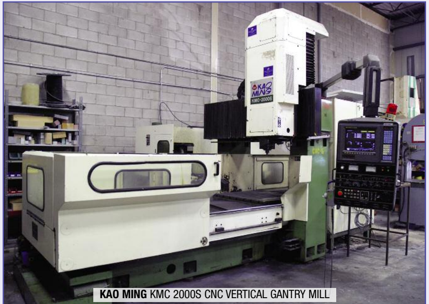
KAO MING KMC 2000S CNC VERTICAL GANTRY MILL