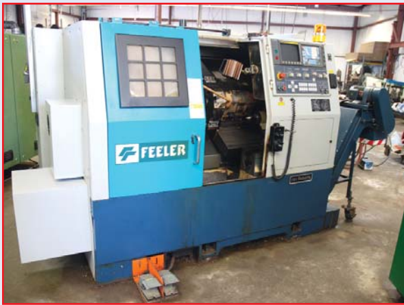
FEELER CNC LATHE, MODEL FTC-20