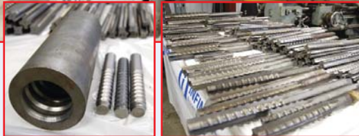
GISHOLT THREAD WHIRLER / GRINDER MACHINE, MODEL NO 5