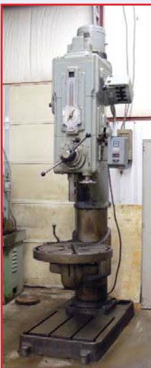
KITCHEN & WADE, HEAVY DUTY GEARED HEAD DRILL