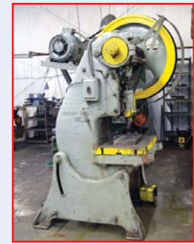
BROWN BOGGS 40 TON OBI PUNCH PRESS, MODEL NO. 15L