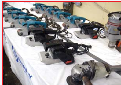
MAKITA & CRAFTSMAN BELT SANDERS