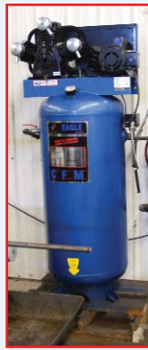
EAGLE AIR COMPRESSOR, MODEL E28567, 5 HP