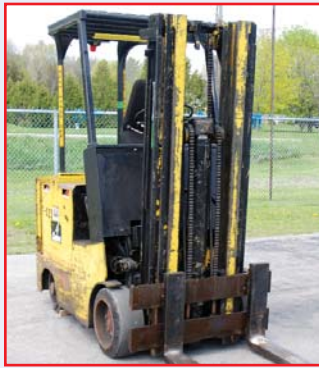
YALE 3,000 LB CAP. ELECTRIC FORKLIFTS, MODEL ERC 050G36T083