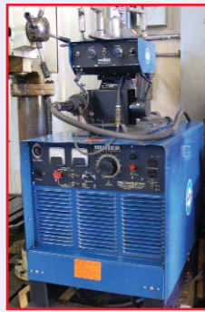
MILLER MIG WELDER MODEL DELTAWELD 450