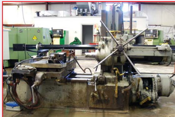
GIDDINGS & LEWIS BORING MILL, MODEL NO. 32