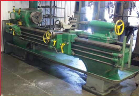
JOHN BERTRAM & SON LATHE 20"X60"