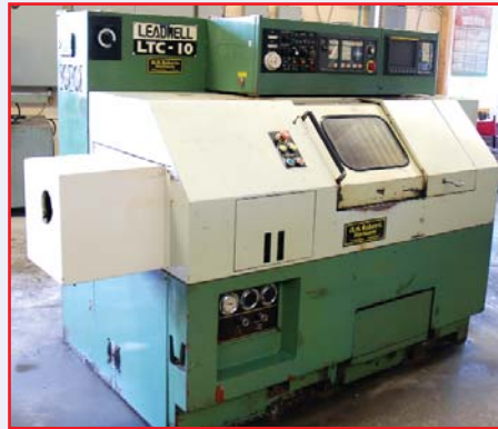
LEADWELL MODEL LTC-10

This brochure is only a partial listing. Please visit our websites at www.infassets.com for more detailed listings and photos.