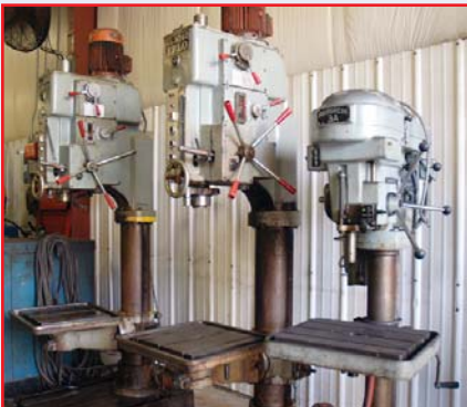
ERLO GEARED HEAD DRILLS, MODEL TCA 50/60, HEAVY DUTY, AUTOMATIC FEED