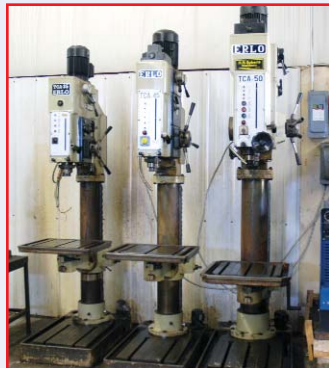
ERLO GEARED HEAD DRILLS, MODEL TCA 35, 45 & 50, HEAVY DUTY, AUTOMATIC FEED