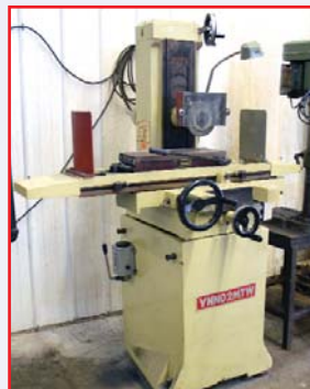
YUNNAN SURFACE GRINDER, MODEL 2MTW, 6" X 18"