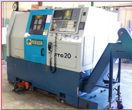
FEELER CNC LATHE, MODEL FTC-20