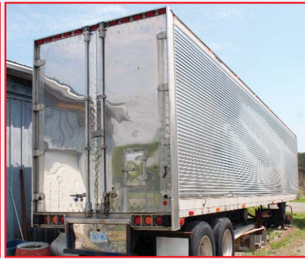
STORAGE TRANSPORT TRAILER