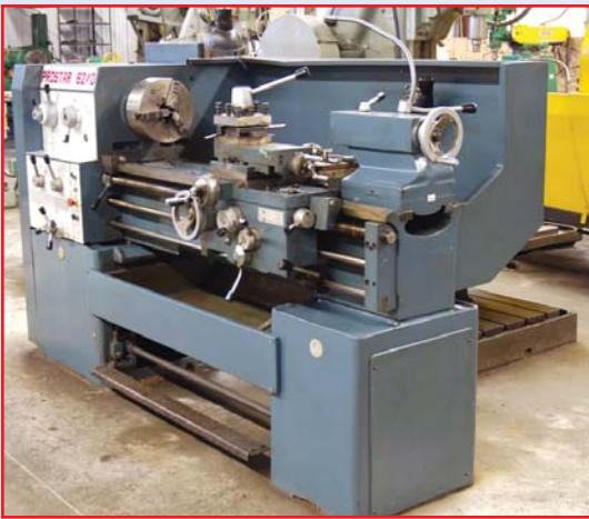
PROSTAR LATHE, MODEL 6240, 16"X40"