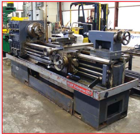
ENTERPRISE LATHE, MODEL 2215, 24"X60"