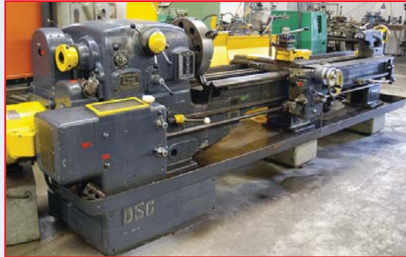
DEAN SMITH & GRACE LATHE MODEL 17, 17"X80"