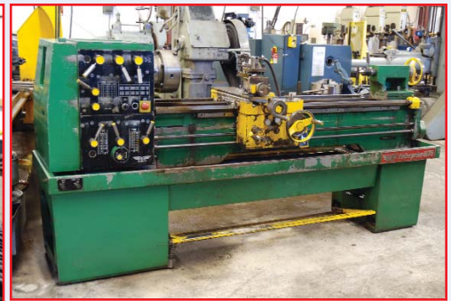
ENTERPRISE LATHE, MODEL 1675, 18"X54"