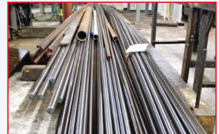
PARTIAL VIEW OF STEEL RAW MATERIAL