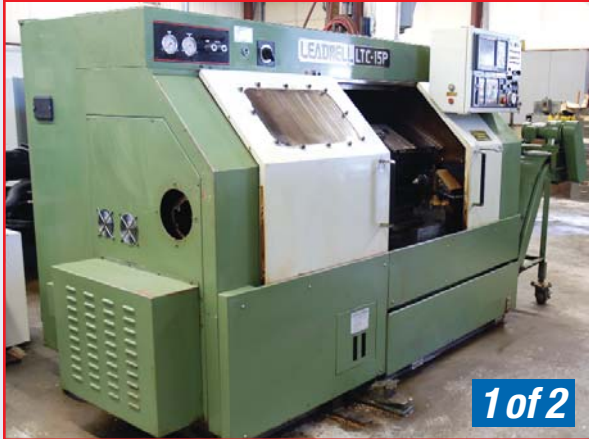
LEADWELL CNC LATHE, MODEL LTC-15P