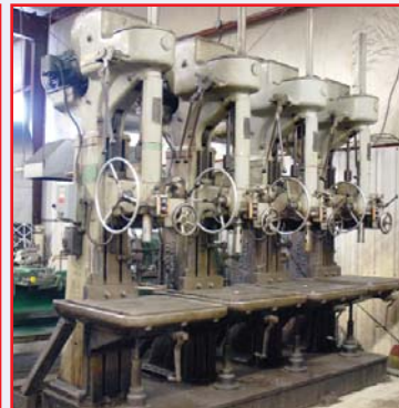
POLLARD & CO 4 SPINDLE IN-LINE DRILL