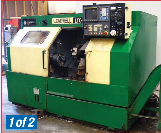
LEADWELL MODEL LTC-15