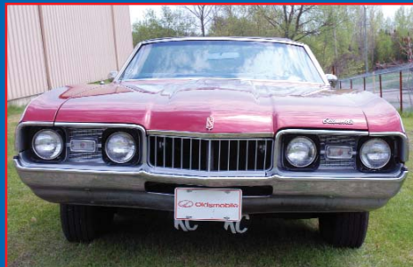
CLASSIC CAR 1968 OLDSMOBILE Cutlass Convertible, 350 Rocket Engine, Ram Rod 350 Ram Air Breather