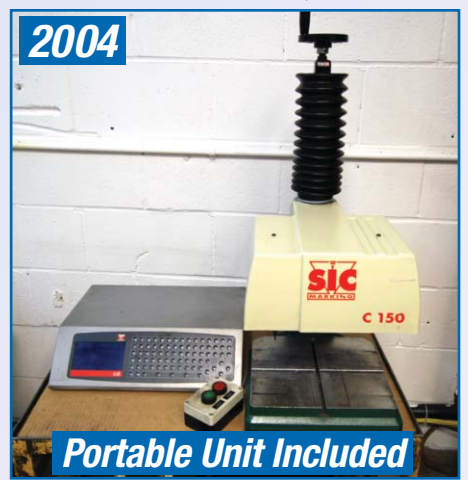
SIC MARKING SYSTEM, MODEL C150

FOWLER Digital Height Gauge, Model Cal 300