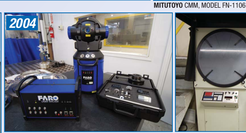
FARO LASER TRACKER MODEL SI, MCU