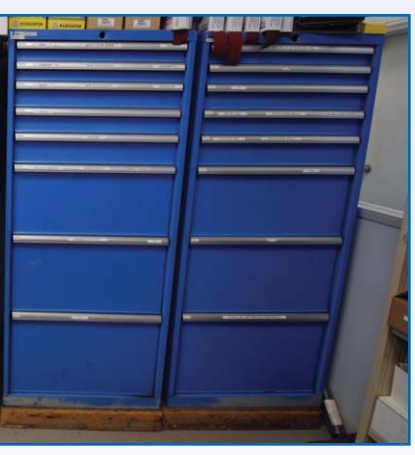
PARTIAL VIEW OF VIDMAR & LISTA CABINETS

MEBA 250 Horizontal Bandsaw 10"x16" Capacity, Hydraulic Clamping & Down Feed Assorted Cutoff Saws, RIDGID Chop Saw