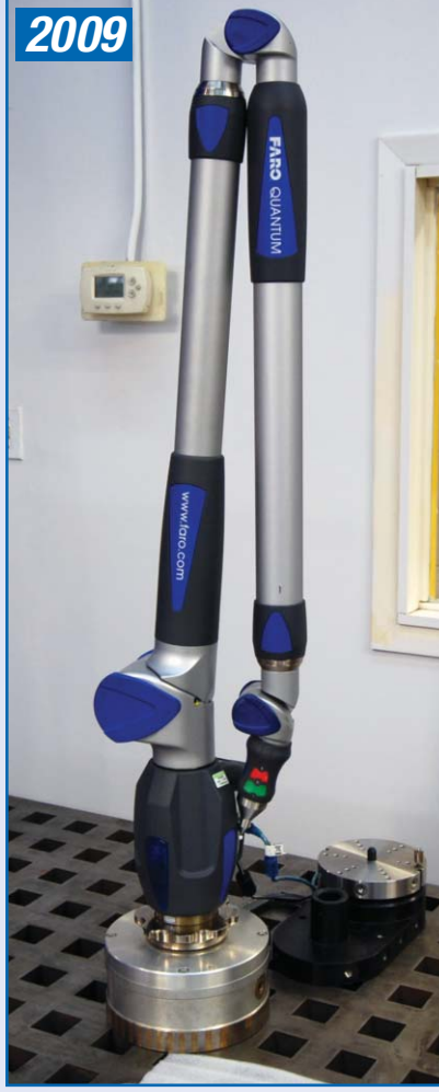
FARO PORTABLE CMM, MODEL QUANTUM