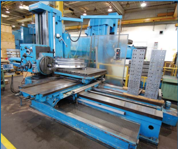
TOS W100A, 4" Spindle, 49"x49" Rotary Table, Travels: X-50", Y-70", Z-48", W-40", 24" Facing Head, 50 Taper, 7-1,120 RPM, Power Drawbar, 2012 Fagor Innova 4 Axis DRO, Coolant, Pendant, sn 312246

2004 MAKINO A-100E, RDF 140-8-206, 5 Axis, Fanuc 18iP - Makino Professional 3 G1 Control, Twin 39.4" x 39.4", 360,000 Position Rotary Table, Travels: X-66.9", Y-53.1", Z-55.1", Max Workpiece Size 74.8" x 59.1", Distance Between Spindle to Table 39.4", 12,000 RPM, 132 ATC, 50 Taper, Max Table Load 6,600 lb, Hi-Pot Test, MP700 Probe System, Chip Conveyor, High Pressure (210 PSI) Coolant Through Spindle, Rigid Tapping, Helical & NURBS Interpolation, Onikazi Mist Collector, A100S Oilmatic Temp Control, Machine Weight 66,000 lb, 20 HP, 220V, sn 050001-2