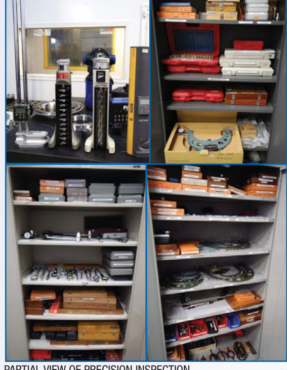
PARTIAL VIEW OF PRECISION INSPECTION