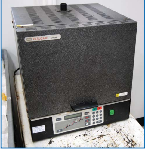
NEY VULCAN 3-550 TABLE TOP OVEN

MITUTOYO TOOLMAKERS MICROSCOPE MODEL TM-101