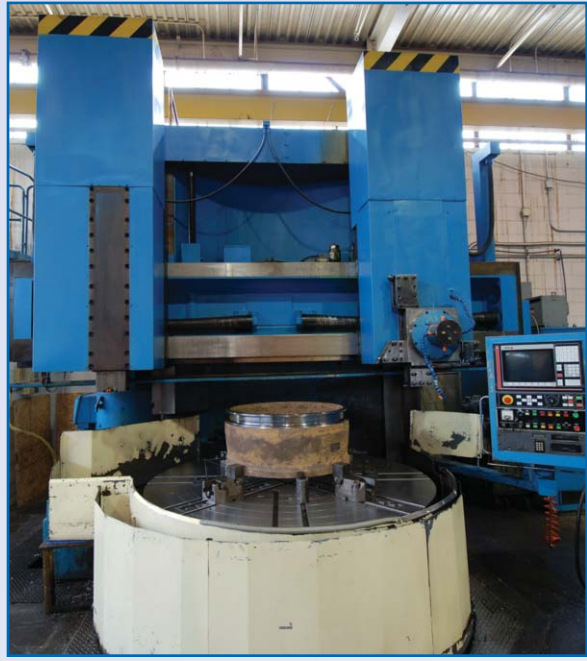
TOS SKJ20, Fagor 8050-T 3 Axis Control, Table Diameter 78.7", Max Swing 90.5", Max Turning Height 59.1", Tool Head Travels: X-51.2", Z- 29.4", Dual Rams, 4 ATC, 160 RPM, Max Table Load 33,069 lb, 93 HP, Trabon Modu Flow Pump Package, 380V, sn 22120004

CENTURY TURN , Model VBM, Fanuc 18i-T, Table Diameter 90", Max Swing 92.9", Max Turn Height 70", Tool Head Travels: X-51.2", Z-40", 300 RPM, 15 ATC, Max Table Load 39,683 lb, 60 HP, 240V, sn 17338 (King - Mechanical Recondition 2000)