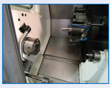
2004 MORI SEIKI CNC Lathe Model NL2000MC/500, MSX-850 CNC Control, 13.9" x 19.7", 12 Station Turret, Live Tooling, Including 4 Live Tool Holders, Assorted Tool Holders, 9" 3 Jaw Chuck, 2.5" Bar Capacity, 5,000 RPM, Milling Speed 6,000 RPM, Tool Presetter, Parts Catcher, Chip Conveyor, Tail Stock, 25 HP, 220V, sn NL201DK0180