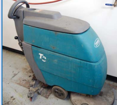
TENNANT FLOOR SWEEPER, MODEL T3