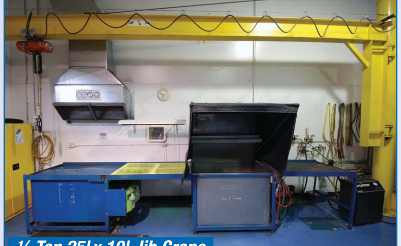
MAGNETIC PARTICLE INSPECTION (MPI) BOOTH

1/4 Ton 25' x 10' Jib Crane ZYGLO INSPECTION EQUIPMENT MODEL ZL2948