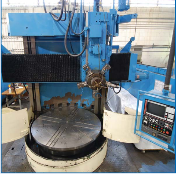
GIDDINGS & LEWIS 60 VTL, Fagor 8055/A-T Control, Upgraded in 2000, 60" 4 Jaw Table Diameter, Max Swing 71.9", Max Turn Height 57.9", Tool Head Travels: X-50", Z-57.9", 5 ATC, Max Table Load 27,557 lb, 300 RPM, 75 HP, 480V, sn 510-6968