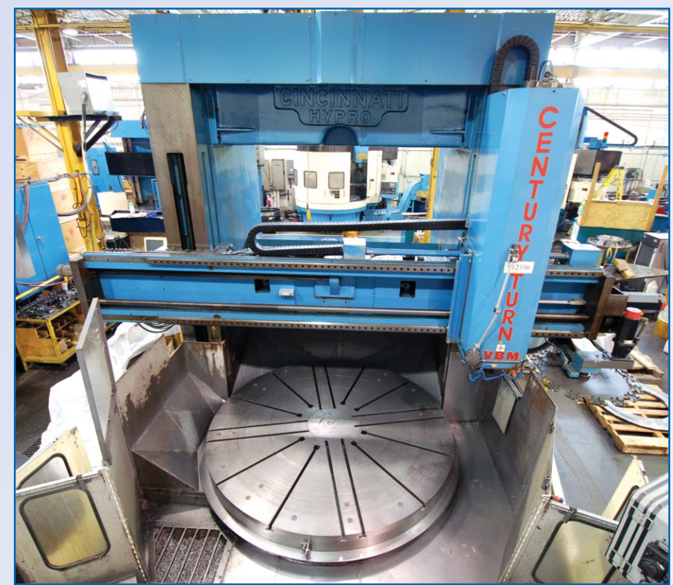
CENTURY TURN , Model VBM, Fanuc 18iT, Table Diameter 96", Max Swing 103.9", Max Turn Height 71.9", Tool Head Travels: X-55.1", Z-40", 120 RPM, 15 ATC, Max Table Load 44,092 lb, Chip Conveyor, 60 HP, 240V, sn 2016 (Cincinnati - Mechanical Recondition 2000)