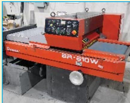
AMADA MODEL BR-610W WET TYPE DEBURRING MACHINE