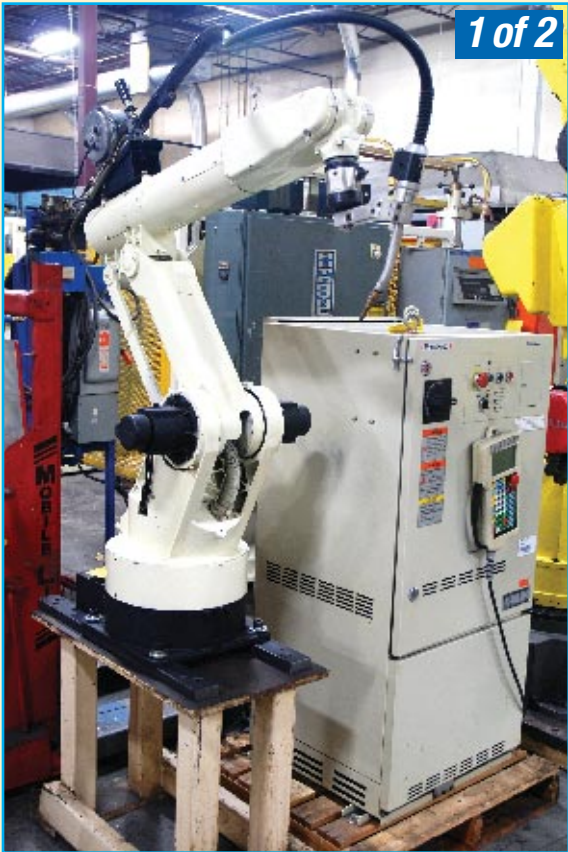
PANASONIC PANA ROBO, INTEGRATED WELDER, ROBOT MODEL AW-005CL