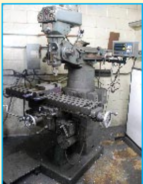
EXCELLO VERTICAL MILL