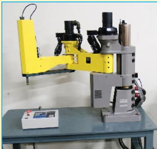
IBM MODEL 7545 MANUFACTURING SYSTEM, HIGH PRECISION ROBOT