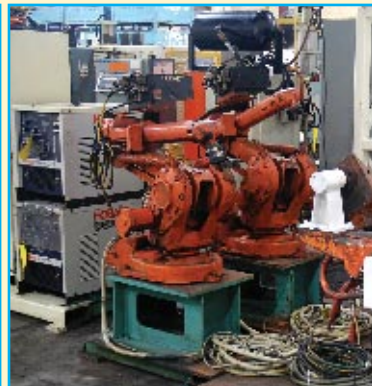
ABB DUAL ROBOT, DUAL SIDED 4' WELDING FIXTURES