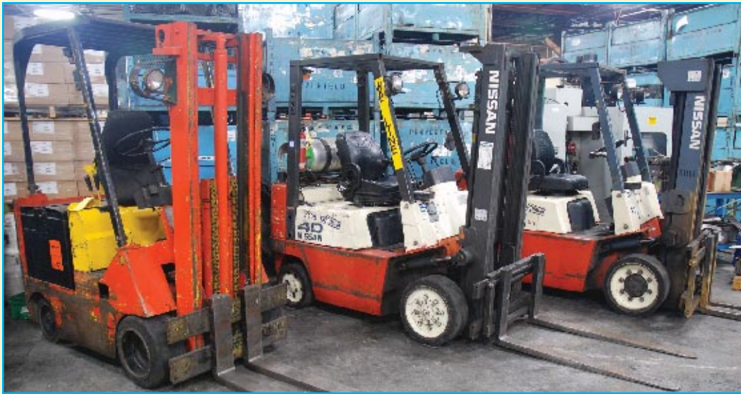
VIEW OF 3 NISSAN & ALLIS CHALMERS FORKLIFTS UP TO 5,800 LB CAPACITY