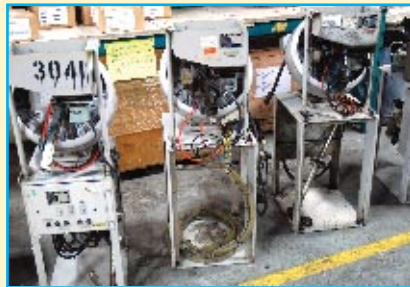
DENGSHA FEEDERS MODEL AF-RNS S8-DLH