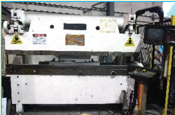
ACCURPRESS MODEL 7608, 8' X 60 TON CNC PRESS BRAKE