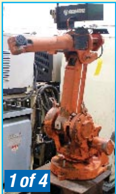
ABB WELD ROBOT MODEL PS 90/6-38-P-LSS-3613