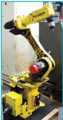
FANUC MODEL ARC MATE 100I