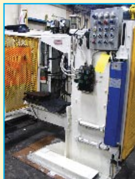
AUTODYNE MODEL VN127 OP20 PROJECTION WELDER, 80 KVA