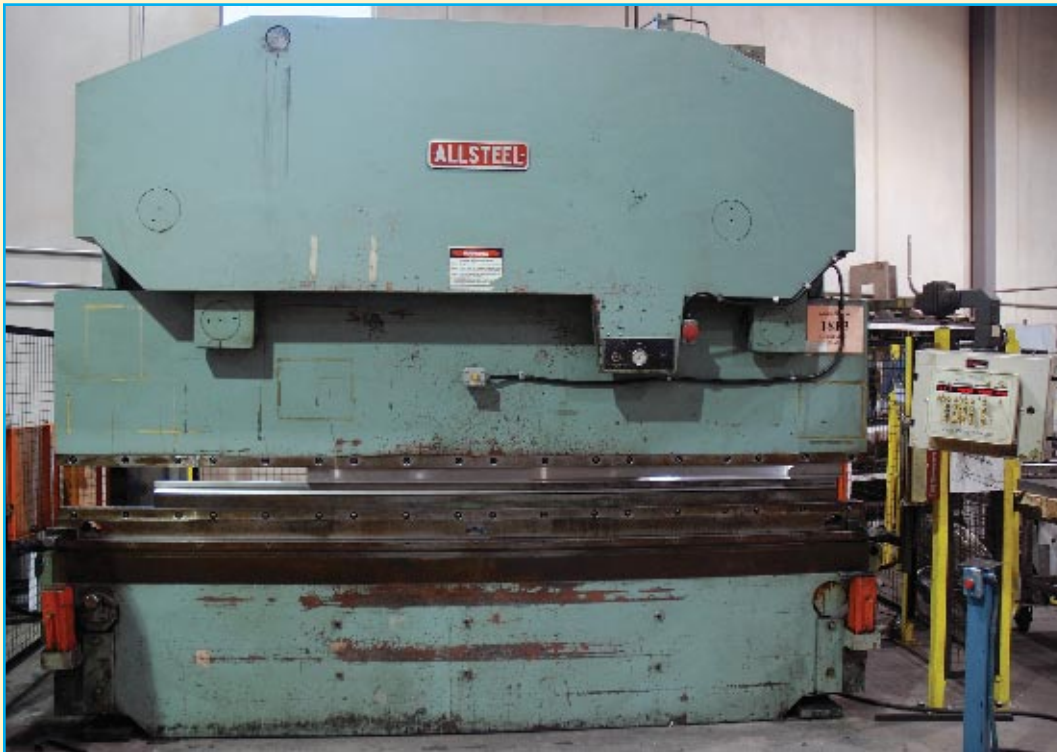
ALLSTEEL 12' X 230 TON, 3 AXIS CNC HYDRAULIC PRESS BRAKE