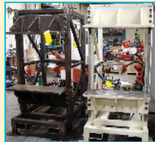
PORTABLE STEEL WELDING CLAMP FRAMES