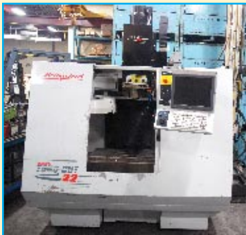
BRIDGEPORT CNC VERTICAL MACHINING CENTER, MODEL DISCOVERY TORQ-CUT 22