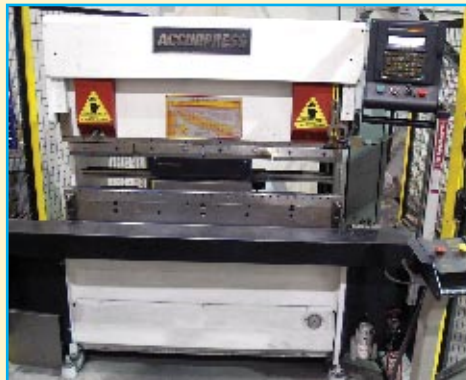
ACCURPRESS MODEL 7254, 4' X 25 TON CNC PRESS BRAKE