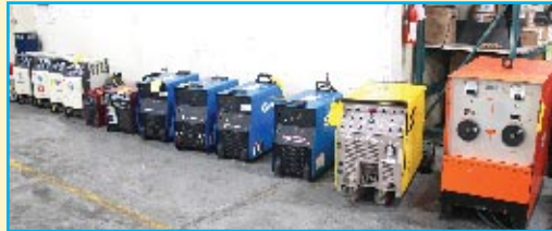
PARTIAL VIEW OF 15 ASSORTED WELDERS