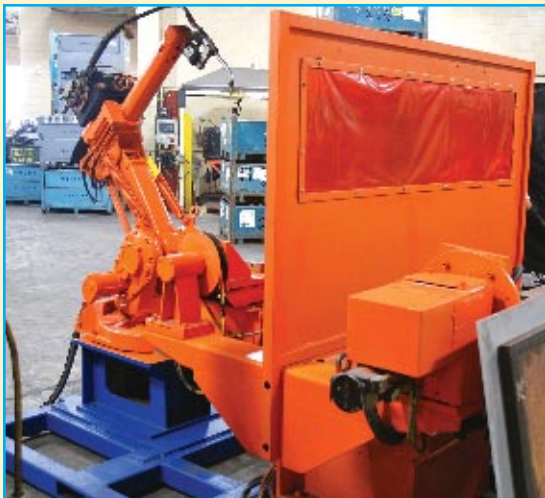
ABB SINGLE ROBOT, DUAL SIDED 4' WELDING FIXTURES