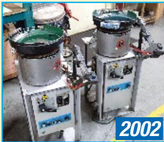
DENGSHA 13" VIBRATORY BOWL FEEDERS