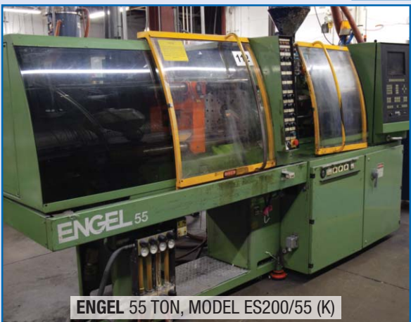
ENGEL 55 TON, MODEL ES200/55 (K)