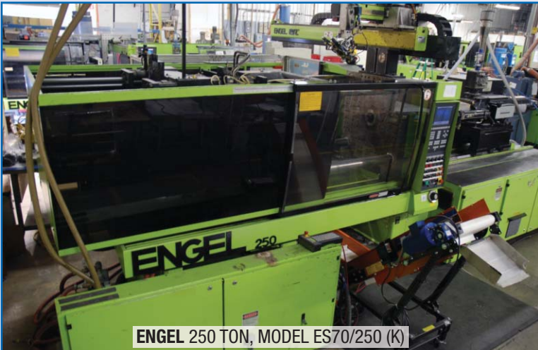
ENGEL 250 TON, MODEL ES70/250 (K)