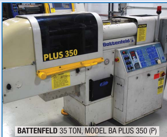
BATTENFELD 35 TON, MODEL BA PLUS 350 (P)

AUCTIONEER'S NOTE: All Assets From Both Facilities Will Be Sold Wednesday November 20th, Theatre Style at: Komtech Enterprises 925 Brock Road, Pickering (Toronto), Ontario Facility. Items with (P) Located in Pickering, (K) in Kanata. Visit infinityassets.com for complete details!