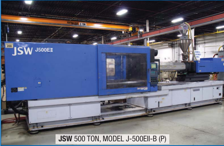
JSW 500 TON, MODEL J-500EII-B (P)