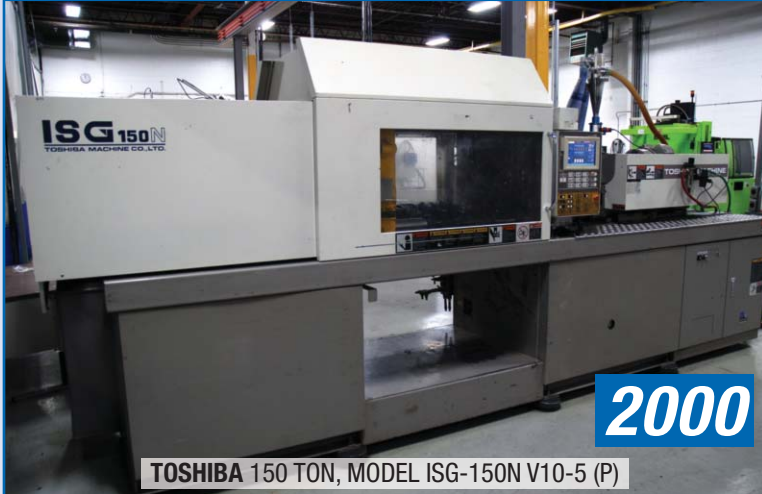
TOSHIBA 150 TON, MODEL ISG-150N V10-5 (P)