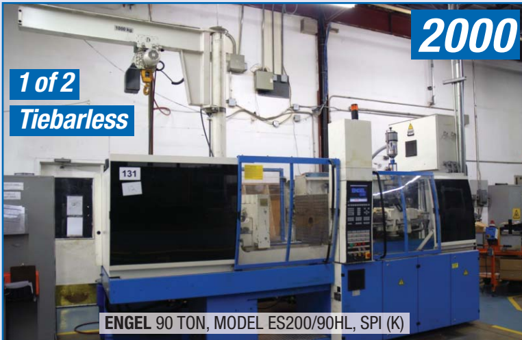
ENGEL 90 TON, MODEL ES200/90HL, SPI (K)