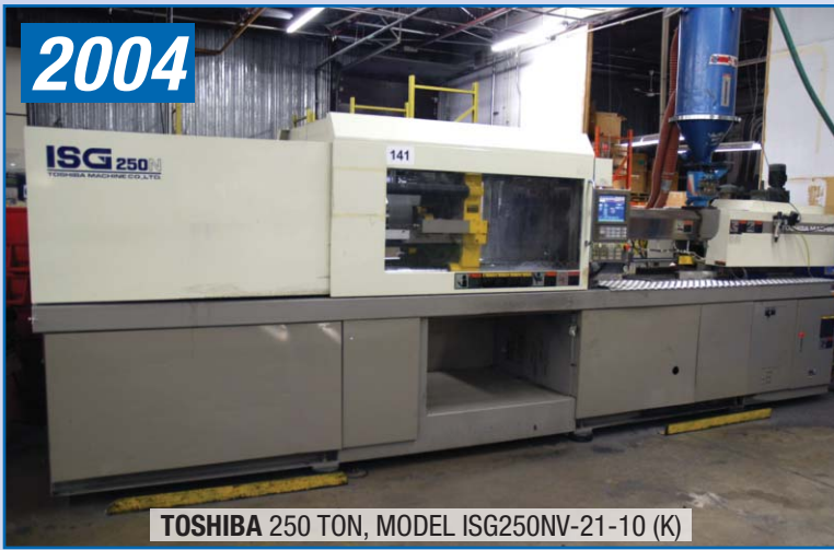
TOSHIBA 250 TON, MODEL ISG250NV-21-10 (K)