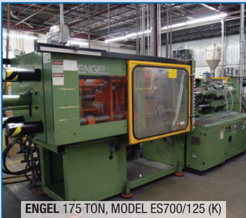
ENGEL 175 TON, MODEL ES700/125 (K)