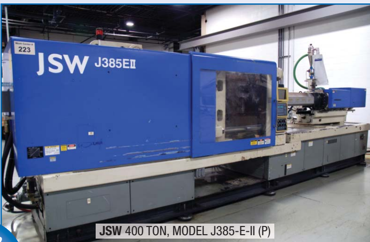
JSW 400 TON, MODEL J385-E-II (P)