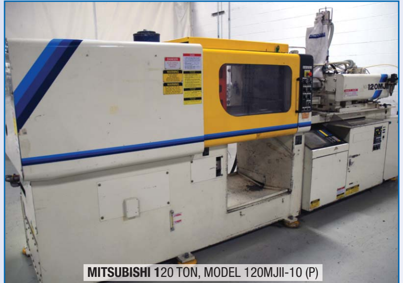
MITSUBISHI 120 TON, MODEL 120MJII-10 (P)