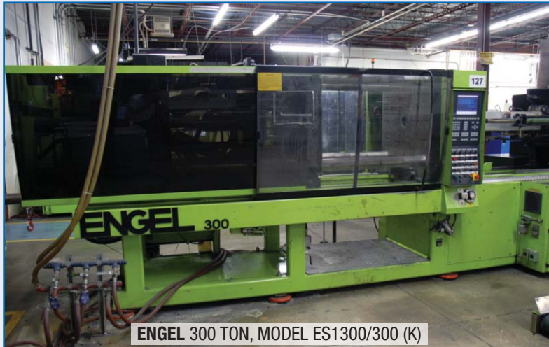
ENGEL 300 TON, MODEL ES1300/300 (K)