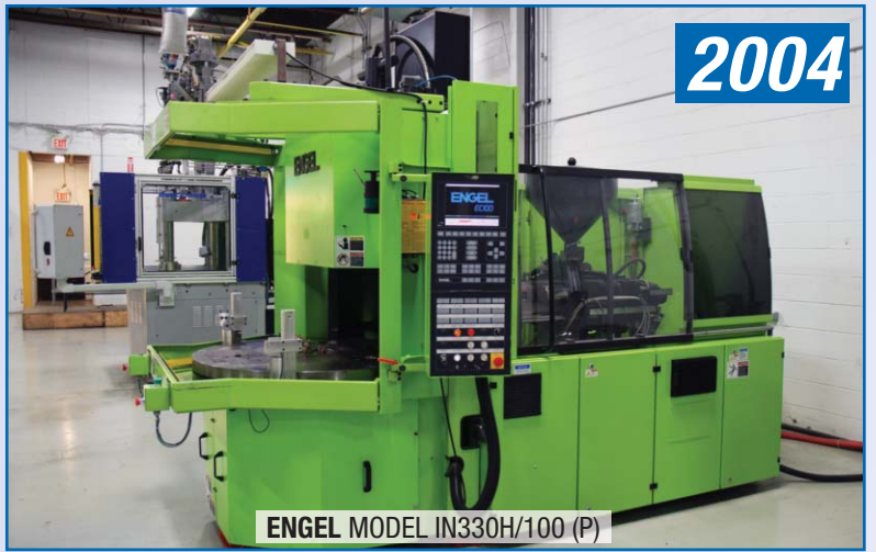
ENGEL MODEL IN330H/100 (P)