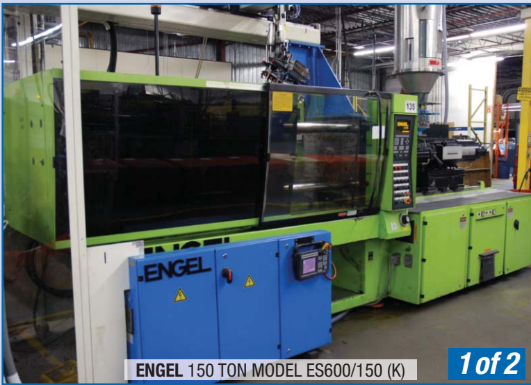
ENGEL 150 TON MODEL ES600/150 (K)