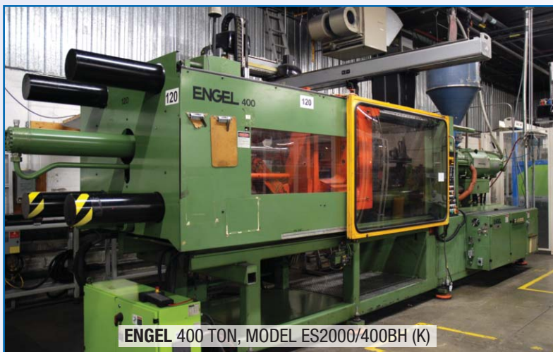
ENGEL 400 TON, MODEL ES2000/400BH (K)