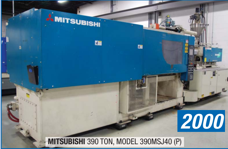
MITSUBISHI 390 TON, MODEL 390MSJ40 (P)