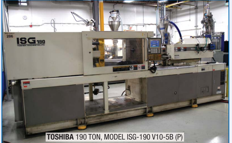
TOSHIBA 190 TON, MODEL ISG-190 V10-5B (P)