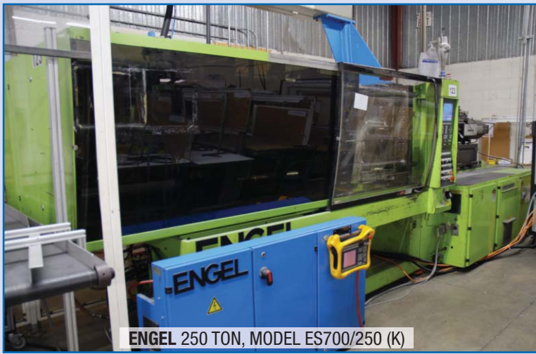
ENGEL 250 TON, MODEL ES700/250 (K)