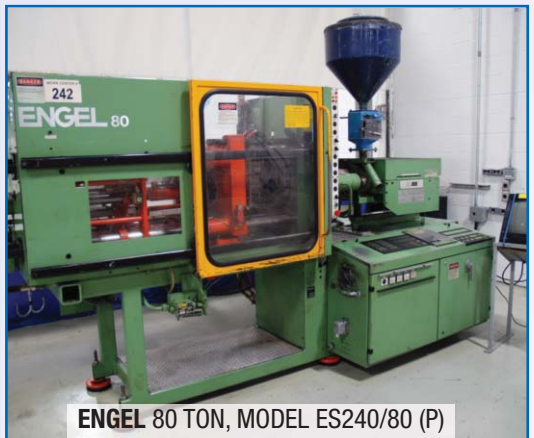
ENGEL 80 TON, MODEL ES240/80 (P)