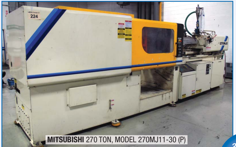
MITSUBISHI 270 TON, MODEL 270MJ11-30 (P)