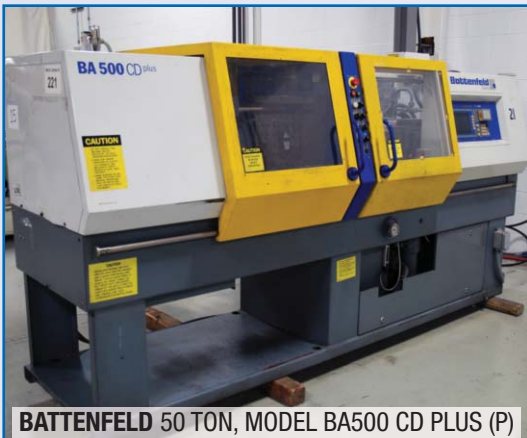
BATTENFELD 50 TON, MODEL BA500 CD PLUS (P)