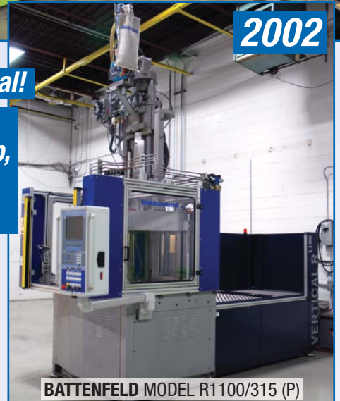
BATTENFELD MODEL R1100/315 (P)

Please Visit Our Website infinityassets.com For Complete Specifications And Details.