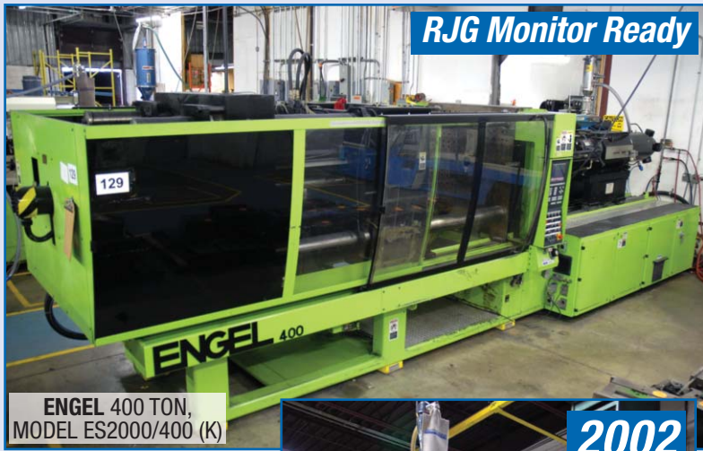
ENGEL 400 TON, MODEL ES2000/400 (K)