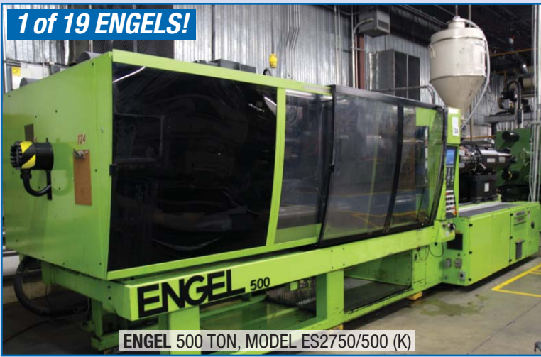
ENGEL 500 TON, MODEL ES2750/500 (K)