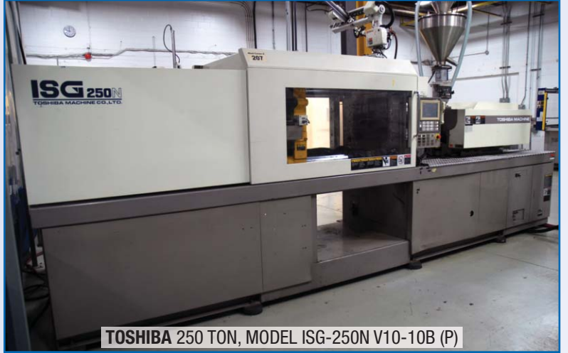
TOSHIBA 250 TON, MODEL ISG-250N V10-10B (P)