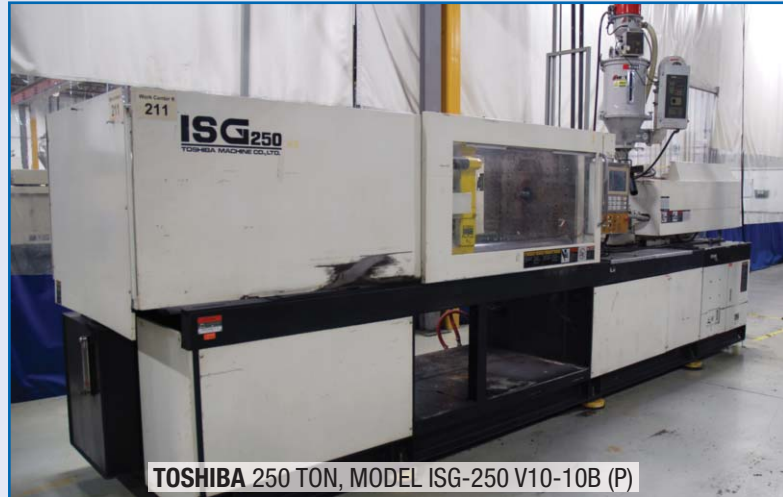
TOSHIBA 250 TON, MODEL ISG-250 V10-10B (P)