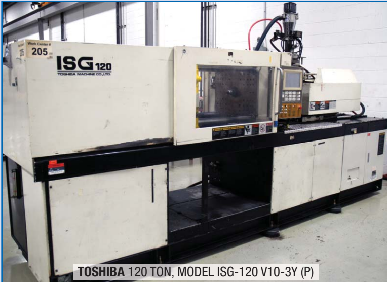
TOSHIBA 120 TON, MODEL ISG-120 V10-3Y (P)