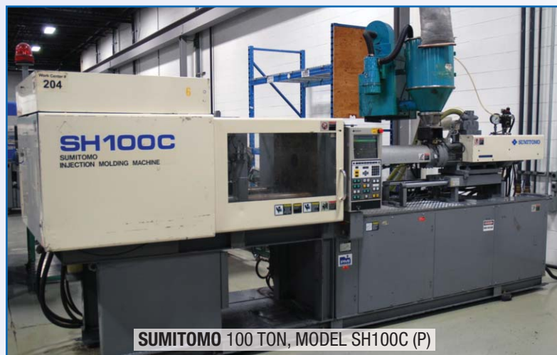
SUMITOMO 100 TON, MODEL SH100C (P)