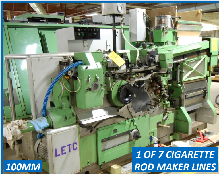
MOLINS MK-8 CIGARETTE ROD MAKER LINE