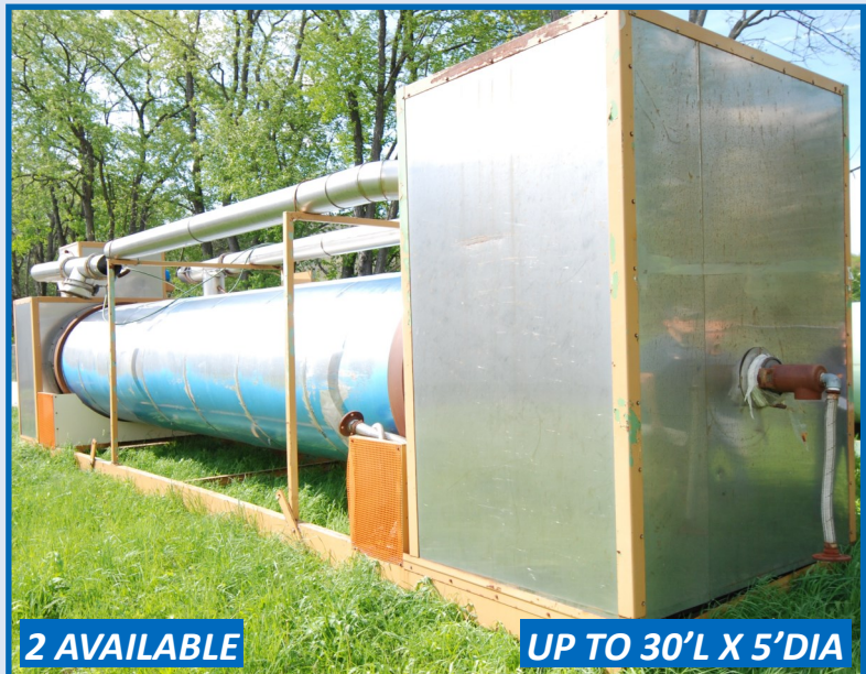
COMAS TOBACCO ROTARY DRYER

Online Auction Only: Bidding Ends Tuesday August 15, 11:00AM (ET)