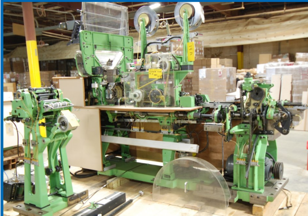
MOLINS HLP-2 HINGED LID CIGARETTE PACKAGING LINE

Sasib Alfa Soft Packaging Line Consisting of: Sasib Alfa Ram Soft 100mm Cigarette Packaging machine w/ Reject Collector, s/n 2290118, Sasib Delta W 100mm Cellophane Wrapper, Provit 2200 Digital Control, s/n 2240123, Sasib Delta C Plus Standard 20 Package Cartoner w/ Nordson Series 3100V-1EAU20/ARX Gluer , Sasib 100mm Link-up Belt Conveyors, Sasib 480V Control Panel