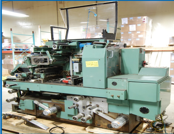
MOLINS HLP-5 HINGED LID CIGARETTE PACKAGING LINE

(2) Molins HLP-5 Hinged Lid 100mm Cigarette Packaging Lines Consisting of: Molins HLP-5 Foil Bed Packer w/ Foil Bobbin Unit, Molins HLP-5 Packet Blank Machine w/ Drying Drum Unit, Molins HLP-5 Cellophane Wrapper , Molins PACAM HLP-5 10 Package Cartoner, Molins HLP-5 Tudor Tray Unloader w/ Pak Feed Conveyor, Link-up Conveyors, Control Panels