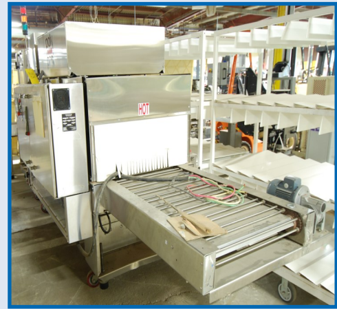
POLY PAK ILB-24DL OVER WRAPPER

(2) Comas Tobacco Conditioning Cylinders , Approx. 15'L x 5'Dia (Located at 6558 NY-417, Kill Buck, New York) Roll Your Own Filling Machines