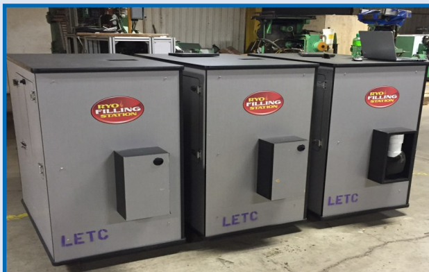
ROLL YOUR OWN FILLING MACHINE