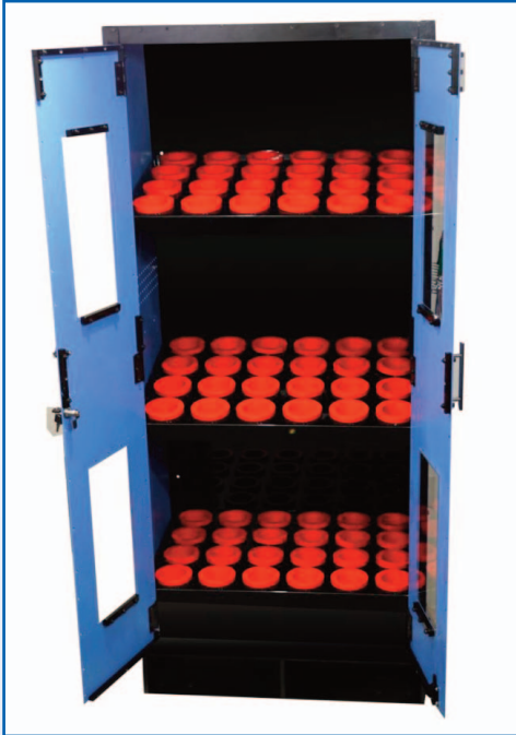
CNC TOOL HOLDER CABINET

1290 Speers Road, #14 ,Oakville, Ontario