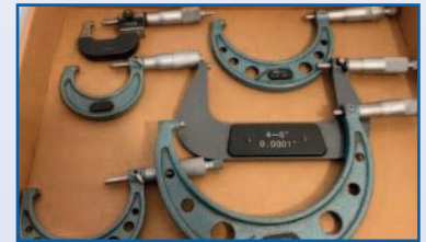
MICROMETERS, 1 TO 6.0 INCHES