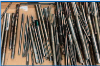
REAMERS, METRIC AND IMPERIAL ASSORTED