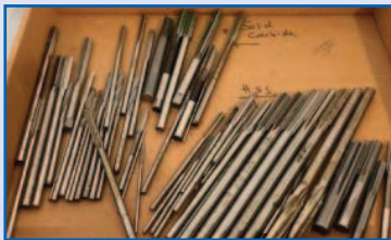
REAMERS, METRIC AND IMPERIAL