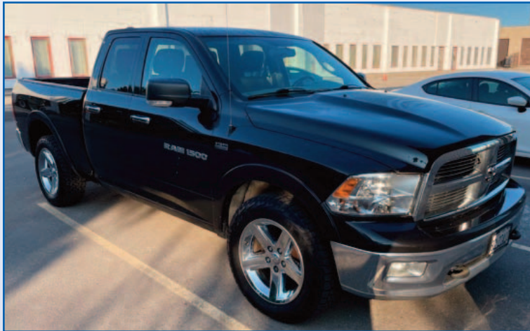
DODGE RAM PICK UP TRUCK – MODEL 2012