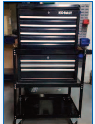
LOCKABLE TOOL BOX WITH WHEELS