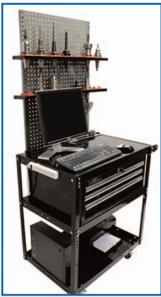
CNC WORK STATION