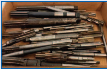
BIG SIZE REAMERS, METRIC AND IMPERIAL