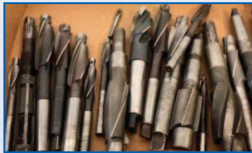
COUNTERBORE TOOLS, METRIC AND IMPERIAL