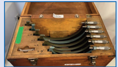
MICROMETERS, 6.0 TO 12.0 INCHES