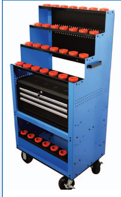
HEAVY DUTY – CNC TOOL CART