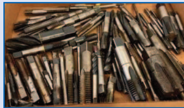
TAPS, METRIC AND IMPERIAL