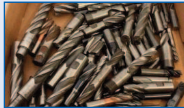
ENDMILLS, METRIC AND IMPERIAL