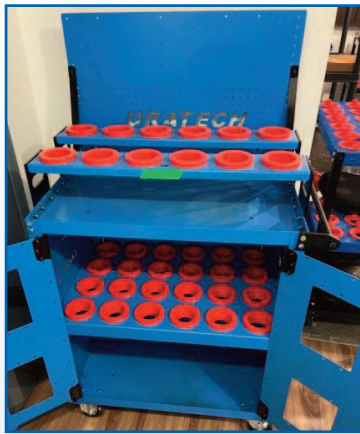
CAT 50 - TOOL CART