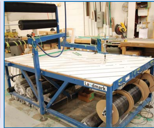
MANUAL WINDOW SCREEN ASSEMBLY TABLE