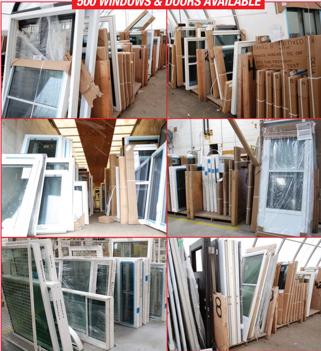
PARTIAL VIEW OF WINDOW & DOOR INVENTORY