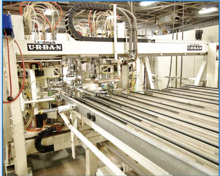
URBAN SV800/2.5M 4-HEAD CNC WELD SEAM CLEANER