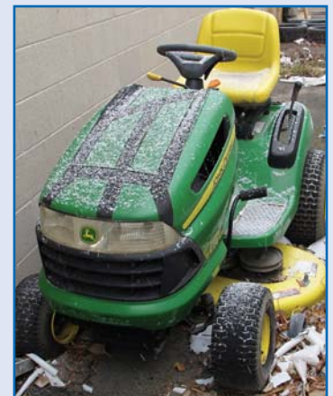
JOHN DEERE RIDE-ON LAWNMOWER