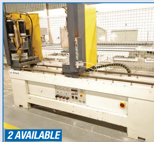
SOMECO 520 L 2-POINT VINYL WELDER