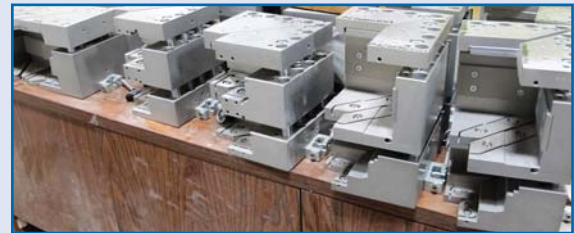
PARTIAL VIEW OF PROFILE DIES

Visit infinityassets.com for complete specs, additional photos and video of machines in action