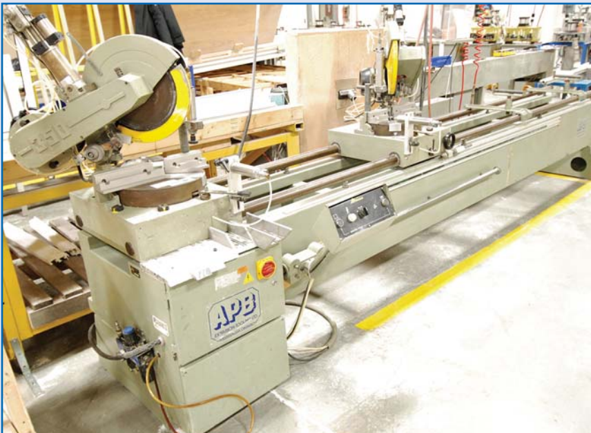
EMMEGI NORMA-350-TU/4 DUAL MITRE SAW