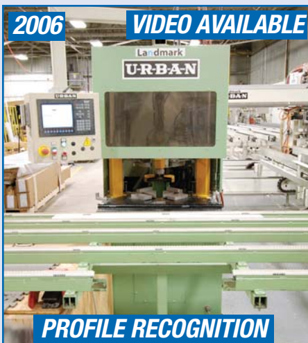
URBAN SV390 PVC SINGLE HEAD WELD

VEGA AUTOMATION TALR 20 Automatic Door Slab Machine, s/n 770578