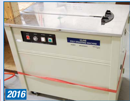
ULINE H-2079 STRAPPING MACHINE