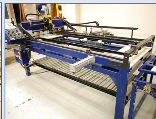
VEGA AUTOMATION TALR 20 AUTOMATIC DOOR SLAB MACHINE