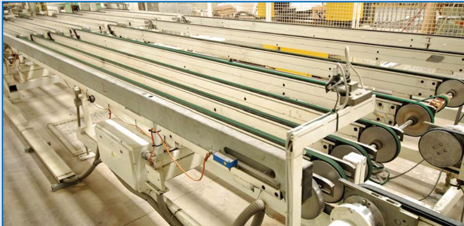
URBAN CONVEYOR SYSTEMS