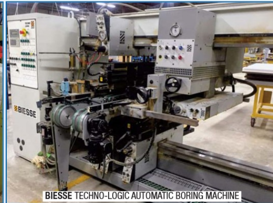
BIESSE TECHNO-LOGIC AUTOMATIC BORING MACHINE