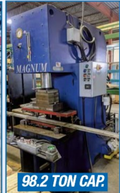
MAGNUM HFM-95B HYDRAULIC PUNCH PRESS