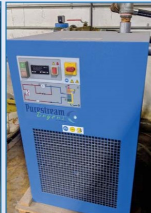
PURESTREAM AIR DRYER