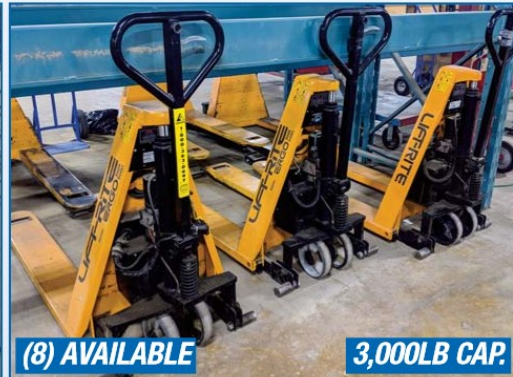
LIFT-RITE ELECTRIC LIFT PALLET JACK