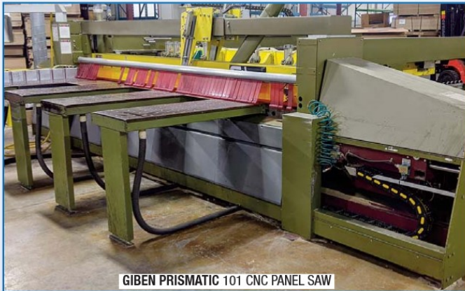
GIBEN PRISMATIC 101 CNC PANEL SAW