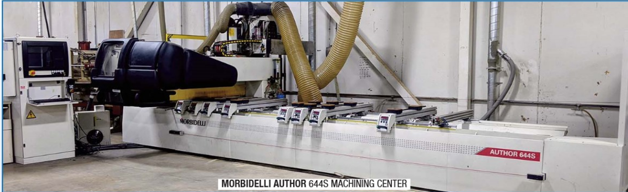
MORBIDELLI AUTHOR 644S MACHINING CENTER