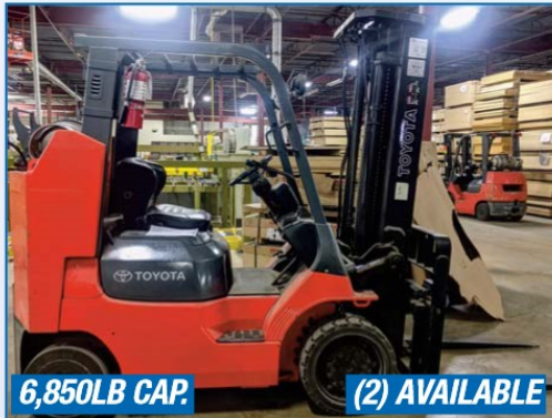
TOYOTA 7FGCU35-BCS PROPANE FORKLIFT