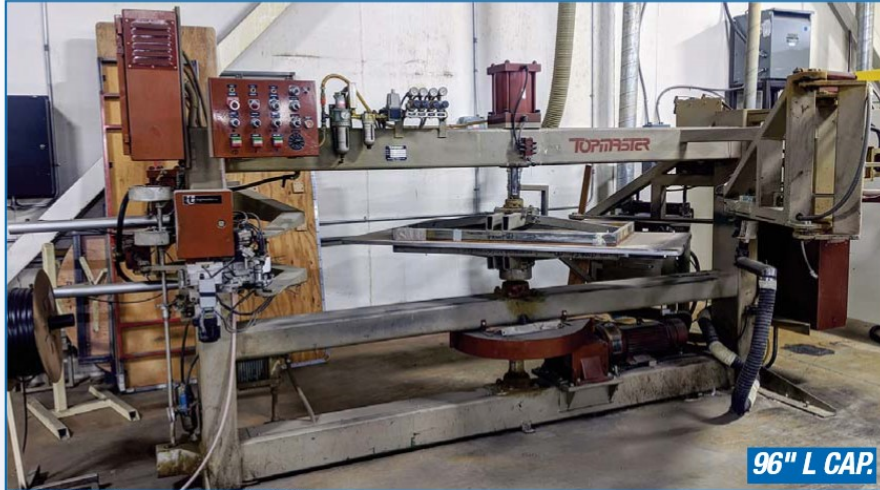
TOPMASTER NA-3000 T-MOLD INSERTER