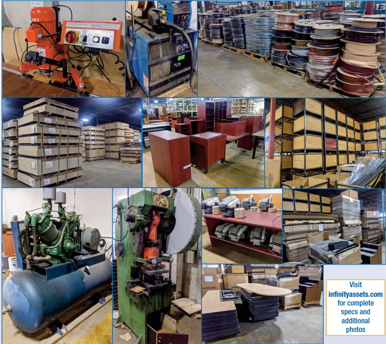
PARTIAL VIEW OF SUPPORT EQUIPMENT

Visit infinityassets.com for complete specs and additional photos