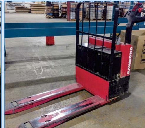
RAYMOND 101T-F40L ELECTRIC PALLET JACK