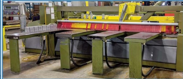
GIBEN PRISMATIC 101 CNC PANEL SAW