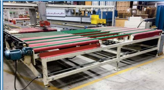
DEFIANCE 0201 CROSS TRANSFER CONVEYOR SYSTEM