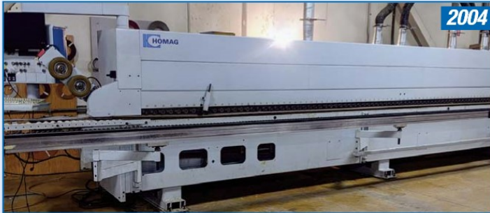
HOMAG OPTIMAT KAL 310/7/A3/S2 EDGE BANDER