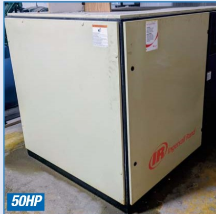
INGERSOLL RAND UP6-50PE-125 AIR COMPRESSOR