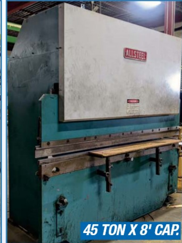
ALLSTEEL 45-8 HYDRAULIC PRESS BRAKE