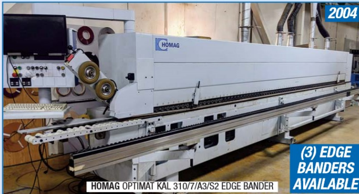
HOMAG OPTIMAT KAL 310/7/A3/S2 EDGE BANDER