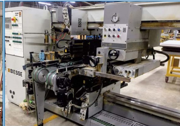
BIESSE TECHNO-LOGIC AUTOMATIC BORING MACHINE

MORBIDELLI AUTHOR 644S Machining Center, s/n A4008248