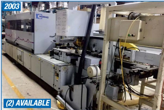
HOMAG OPTIMAT KL 79/A20/S2 EDGE BANDER