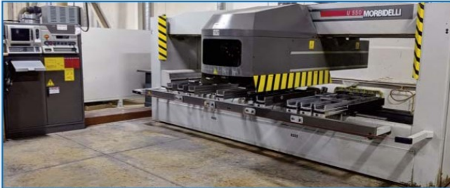
MORBIDELLI U550 STC MACHINING CENTER