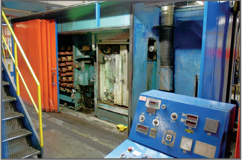
HENRICH 8-WIRE DRAWER LINE