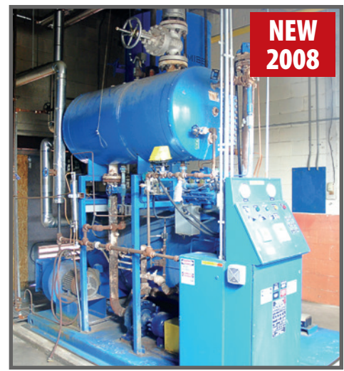
(1 OF 2) THERMOGENICS HHG200NAX BOILERS