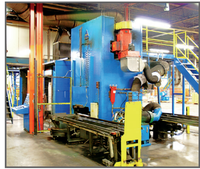
HENRICH 8-WIRE DRAWER LINE