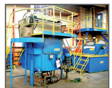
(2) FILTRATION SYSTEMS