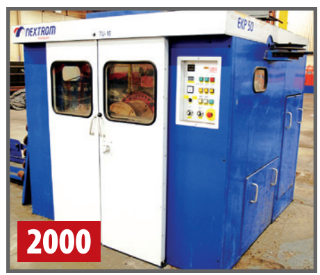
NEXTROM EKP 50 DUAL REEL TAKEUP