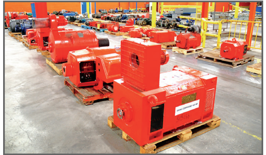
VIEW OF ASSORTED HEAVY DUTY MOTORS, UP TO 400 HP

FILTERTECH TEB-400IH NON-BOIL THERMAL EMULSION BREAKER, S/N 267021804, w/540 Gal. Cap.