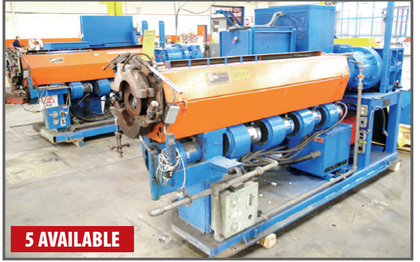
VIEW OF DAVIS STANDARD & DELTAPLAST EXTRUDERS