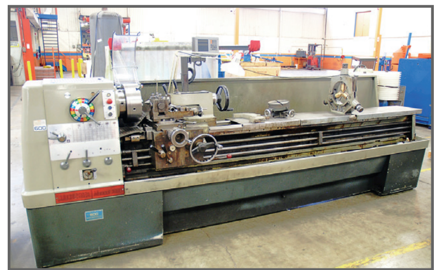
COLCHECSTER MASCOT LATHE, 16" X 110", 12" 3-JAW CHUCK