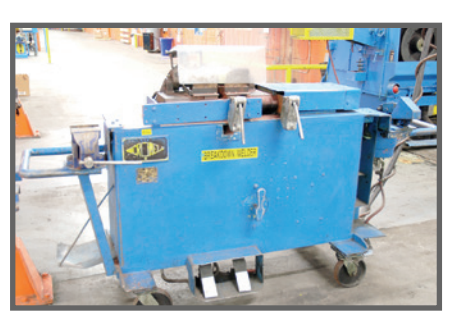
MICROWELD BUTT WELDER

2002 ENGINEERING FUTURE AUTOMAZIONE FLESSIBILE LCV150/450 ACCUMULATOR, S/N 016