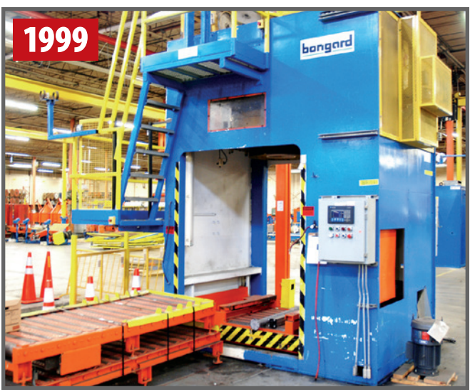
BONGARD KW-1050-TK BARREL PACKER