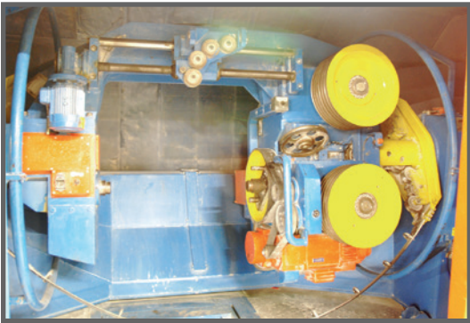
INSIDE VIEW OF SETIC STRANDER