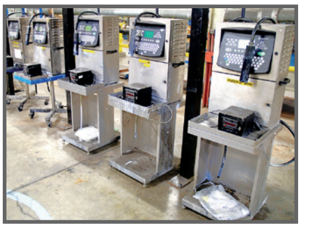
VIEW OF DOMINO INKJET LASER PRINTERS

2002 ENGINEERING FUTURE AUTOMAZIONE FLESSIBILE LCV 80/450 ACCUMULATOR, S/N 017