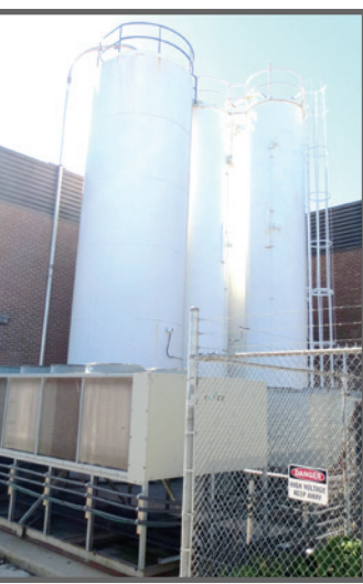
TRANE/CONAIR CHILLERS & SILOS

ALSO: COLCHERSTER 16" X 110" ENGINE LATHE, S/N 710207/16252; Drill Presses; Grinders; Welders; Shop Presses: Carts: Jib Cranes; Shelving; Racking; Work Benches; Dumping Hoppers; Mag Base Drills; Welding Tables; Raw Material; Paint Mixers; Fire Proof Cabinets: Pallet Trucks; Scales; Portable Air Conditioner; Shop Office/ Mezzanine, Approx. 22' x 41; LISTA CABINETS; Column and Floor Type Shop Fans; (3) SY-80/A TIME CARD TERMINALS; (25) Dumping Hoppers; Security Fence; Transformers; Pumps; Rolling Shop Ladders; Shop Vacs; Pallet Trucks; Spill Kits