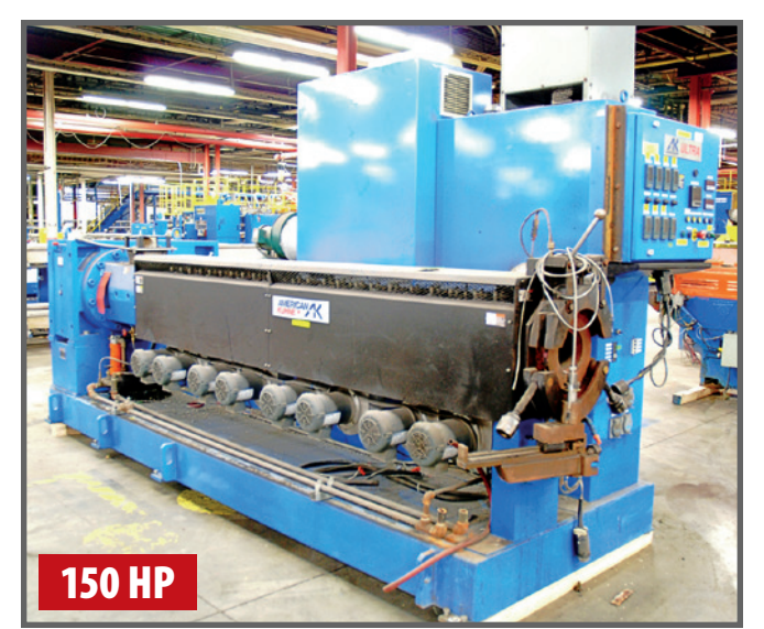
6" AMERICAN KUHNE 24:1 EXTRUDER