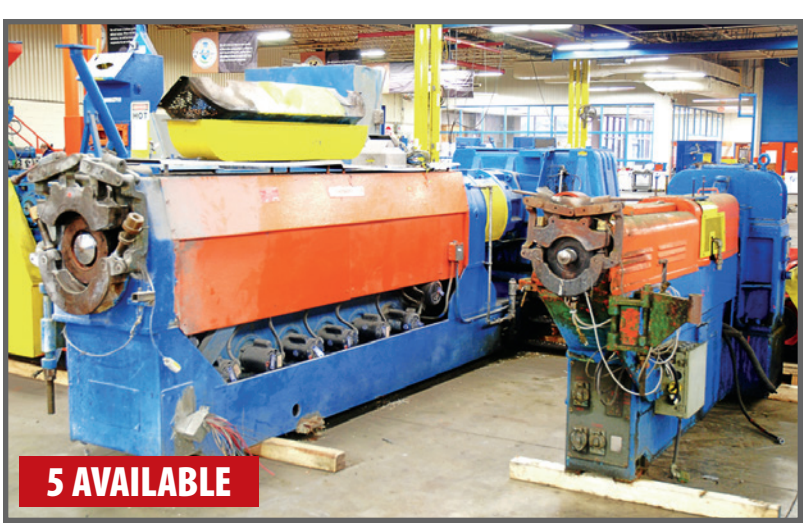
VIEW OF DAVIS STANDARD & DELTAPLAST EXTRUDERS