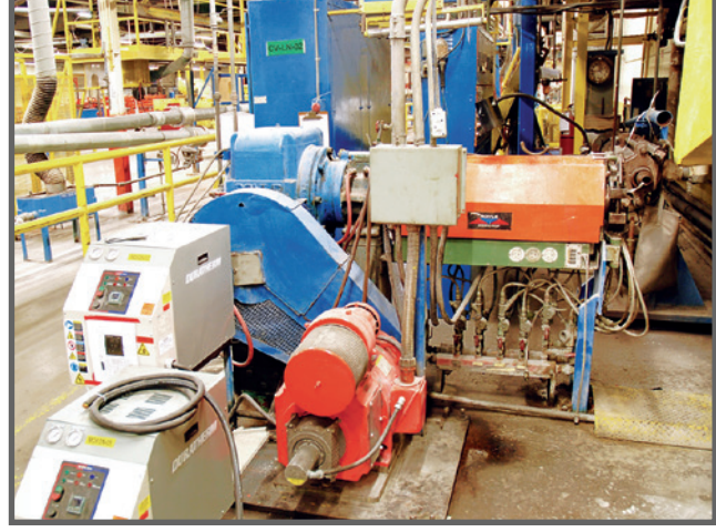
ROYLE 3.5" CV LINE