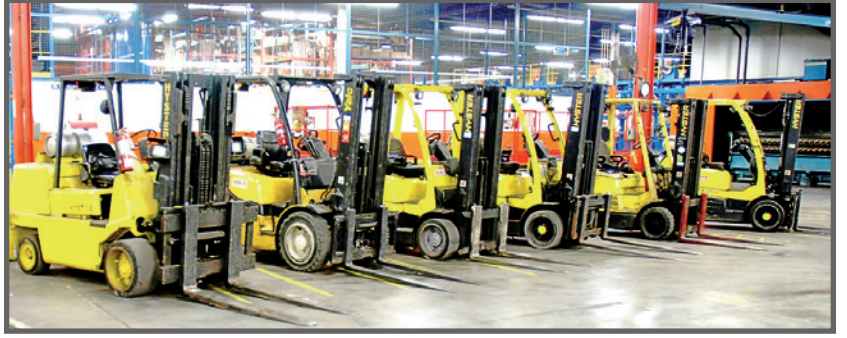
VIEW OF FORKLIFTS