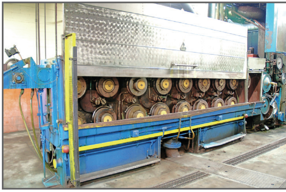
HENRICH 26A17 INTERMEDIATE DRAWER