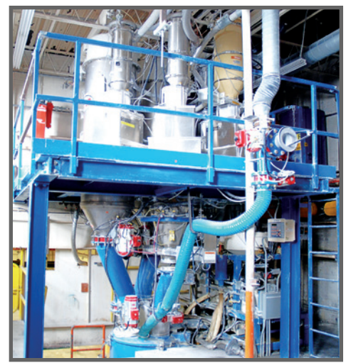
SCHENCK ACCUGATE WEIGH SCALE BLENDER