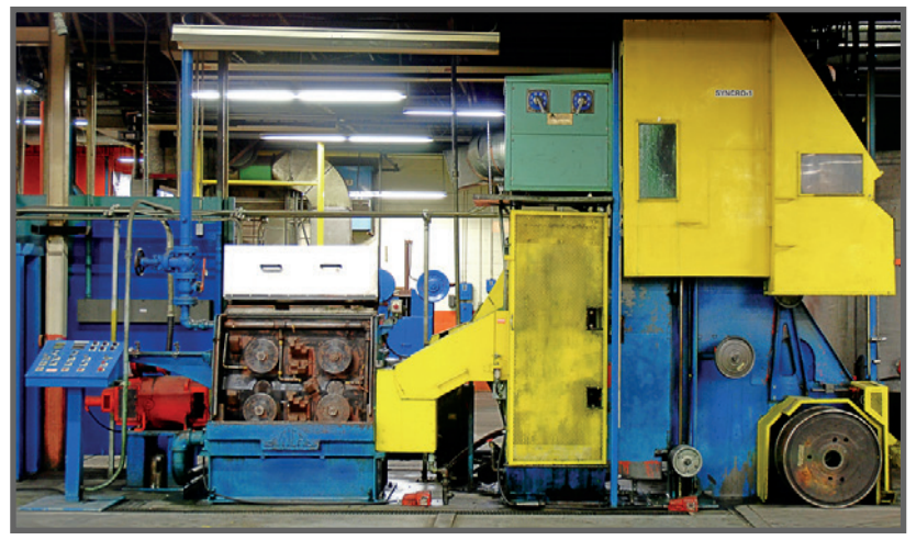
SYNCRO C-13 INTERMEDIATE DRAWER

Sale Date: Tuesday, December 17 at 9:00 AM EST Location: 5769 Main St., Stouffville (Toronto area), Ontario L4A 2T1 Inspection: Monday, December 16 9:00 AM to 4:00 PM EST or by Appointment