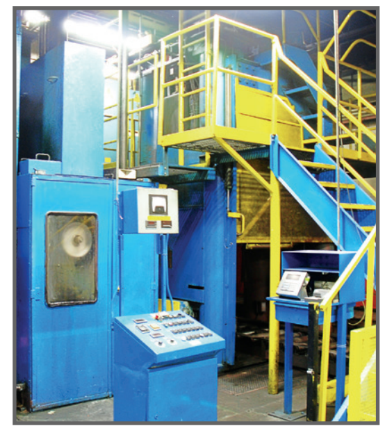
HENRICH 3.5B2500 BUNDLE PACKER