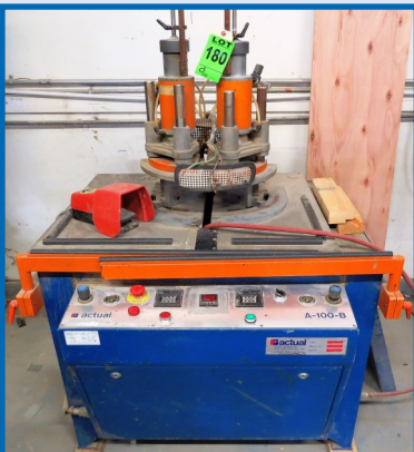
ACTUAL CORNER WELDER