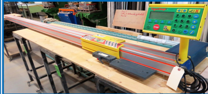
TIGERSTOP AUTOMATED STOP/GAUGE & PUSHER SYSTEM