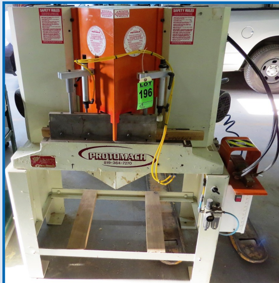
PISTORIUS MN-302 DUAL MITRE SAW