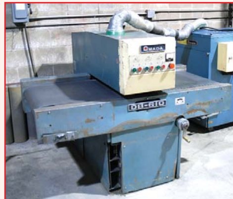
AMADA DEBURRING MACHINE MODEL DB610