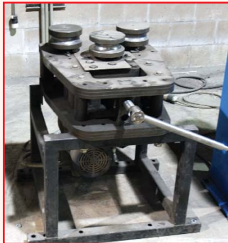
CUSTOM ANGLE ROLL , 7" DIAMETER ROLLS