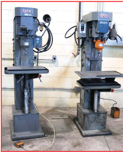
VIEW OF 2 SNOW TAP MILLS MODEL TA2 & TA3