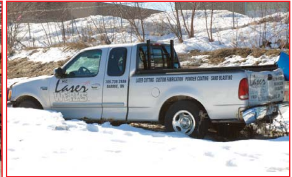
FORD F150 EXT CAB PICKUP TRUCK