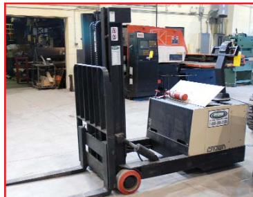
CROWN 4,000 LB CAP. ELEC. PALLET TRUCK