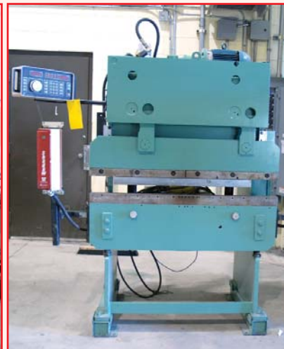
ALLSTEEL MODEL 20-4, 20 TON, HYDRAULIC PRESS BRAKE, COMPUBEND CNC BACK GAUGE