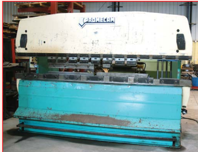
PROMECAM MODEL RG 75-30, 82 TON HYDRAULIC PRESS BRAKE