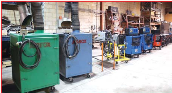
PARTIAL VIEW OF WELDING DEPARTMENT