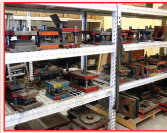
PARTIAL VIEW OF ASSORTED PRESS DIES