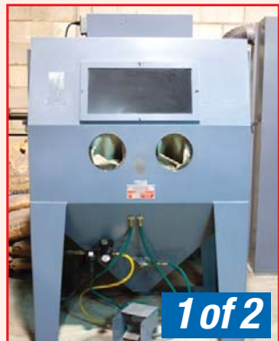
1 of 2

Behind each Infinity appraisal stands over 3 decades of industrial knowledge and expertise. Let our CPPA certified appraisers conduct your next appraisal. Call us in complete confidence at 905-669-8893