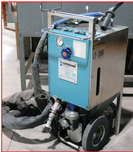
LITTMAN PRAZISION MODEL LT 100/280 DRY ICE BLASTER