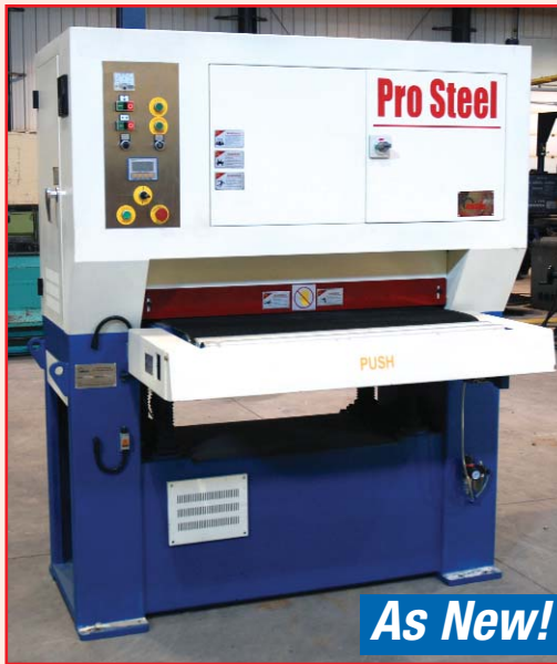
PROSTEEL / JONSEN DEBURRING MACHINE MODEL SG1030-JS