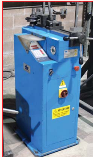
CBC BENDER , MODEL UN7 70B