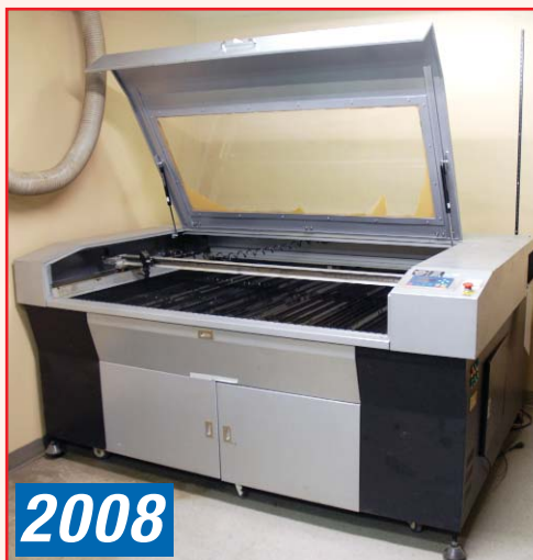
LASER ENGRAVING CUTTING SYSTEM, MODEL 1612

CAN'T ATTEND AUCTION? ALSO BID ONLINE VIA INFASSETS.COM