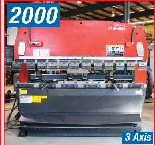
AMADA MODEL RG80, CNC PRESS BRAKE