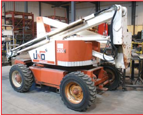
UNO SNORKEL LIFT, UNO 33G