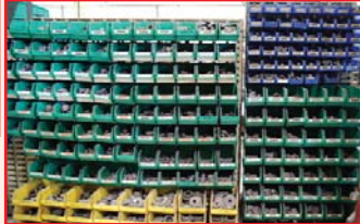
DIE SYSTEM: QUICK CHANGE, INTERCHANGEABLE DIE HOLDERS FOR PUNCHING WASHERS