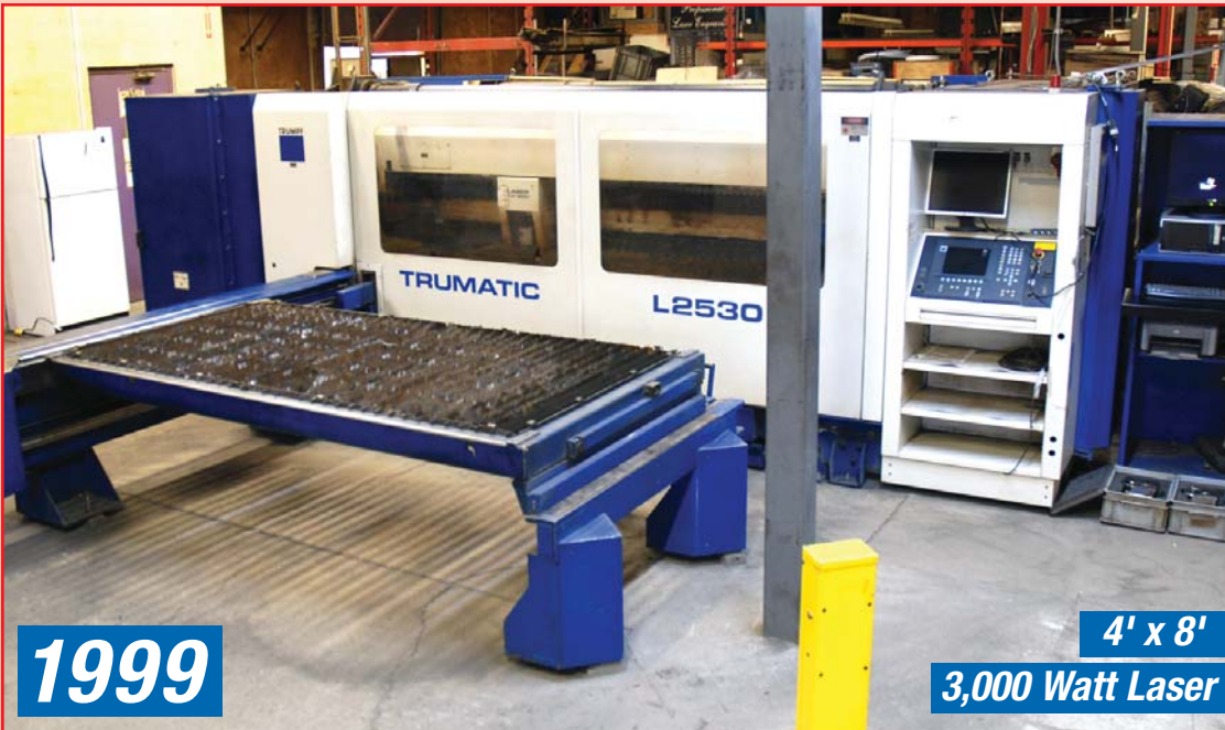
TRUMPF MODEL TRUMATIC L2530