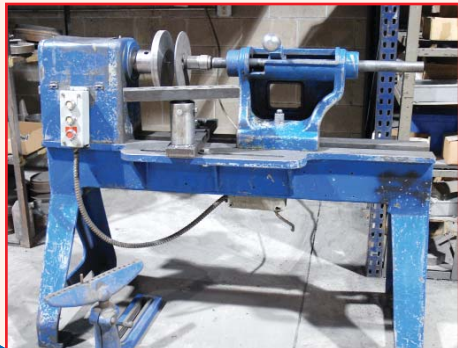
ELECTRIC SPINNING MACHINE , 46" BED