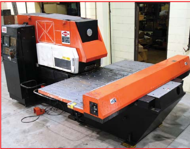
AMADA 22 TON CNC TURRET PUNCH MODEL ARIES 245