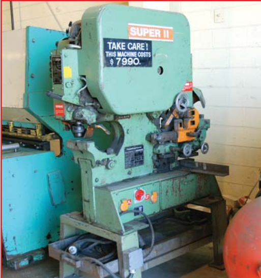
PEDDINGHAUS 4" x 4" x 3/8" MECHANICAL IRONWORKER