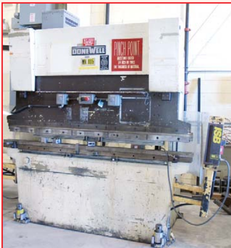
DOWELL MODEL 55-6H, 55 TON HYDRAULIC PRESS BRAKE W/ CYBELEC DNC 7000 CNC BACK GAUGE