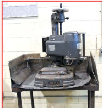
EXCEL PRECISION ROTARY SURFACE GRINDER, MODEL #1