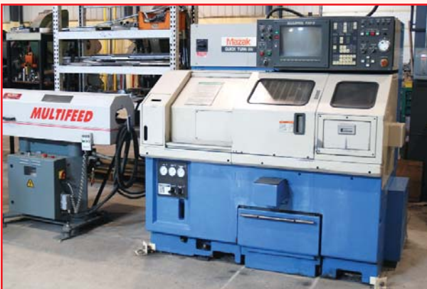
MAZAK QT 8N CNC LATHE