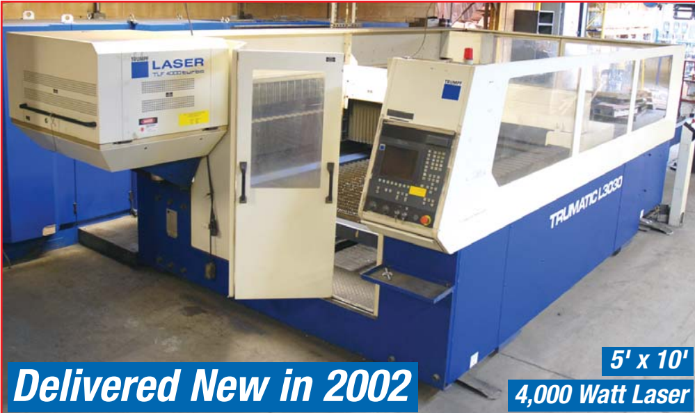
TRUMPF MODEL TRUMATIC L3030