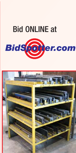
PARTIAL VIEW OF PRESS BRAKE TOOLING