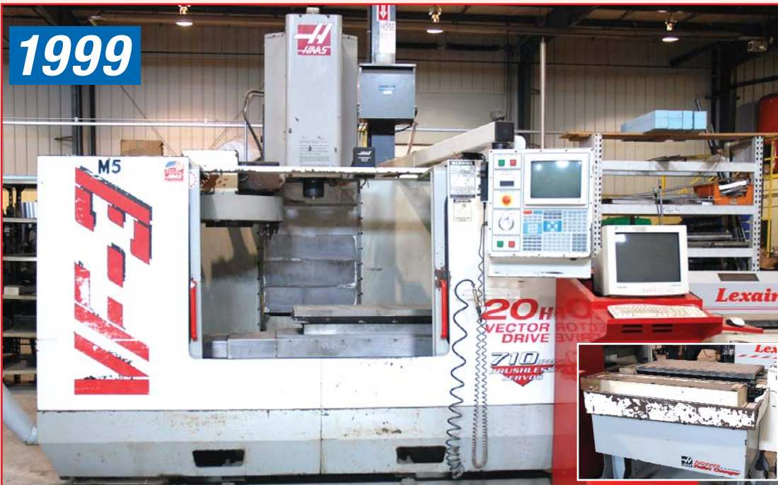
HAAS VF3 CNC VERTICAL MACHINING CENTER