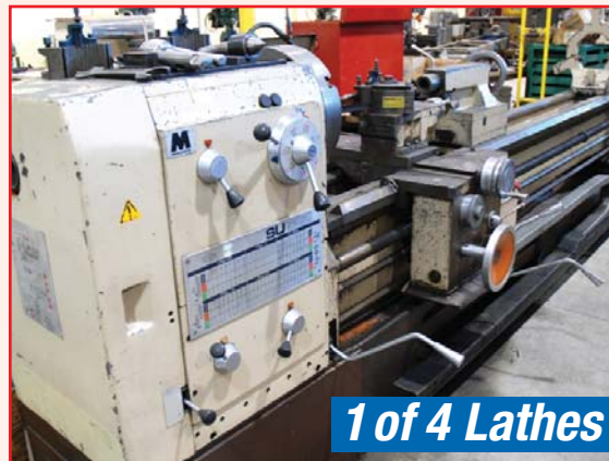
SOFIA LATHE 24" X 120", MODEL SU582