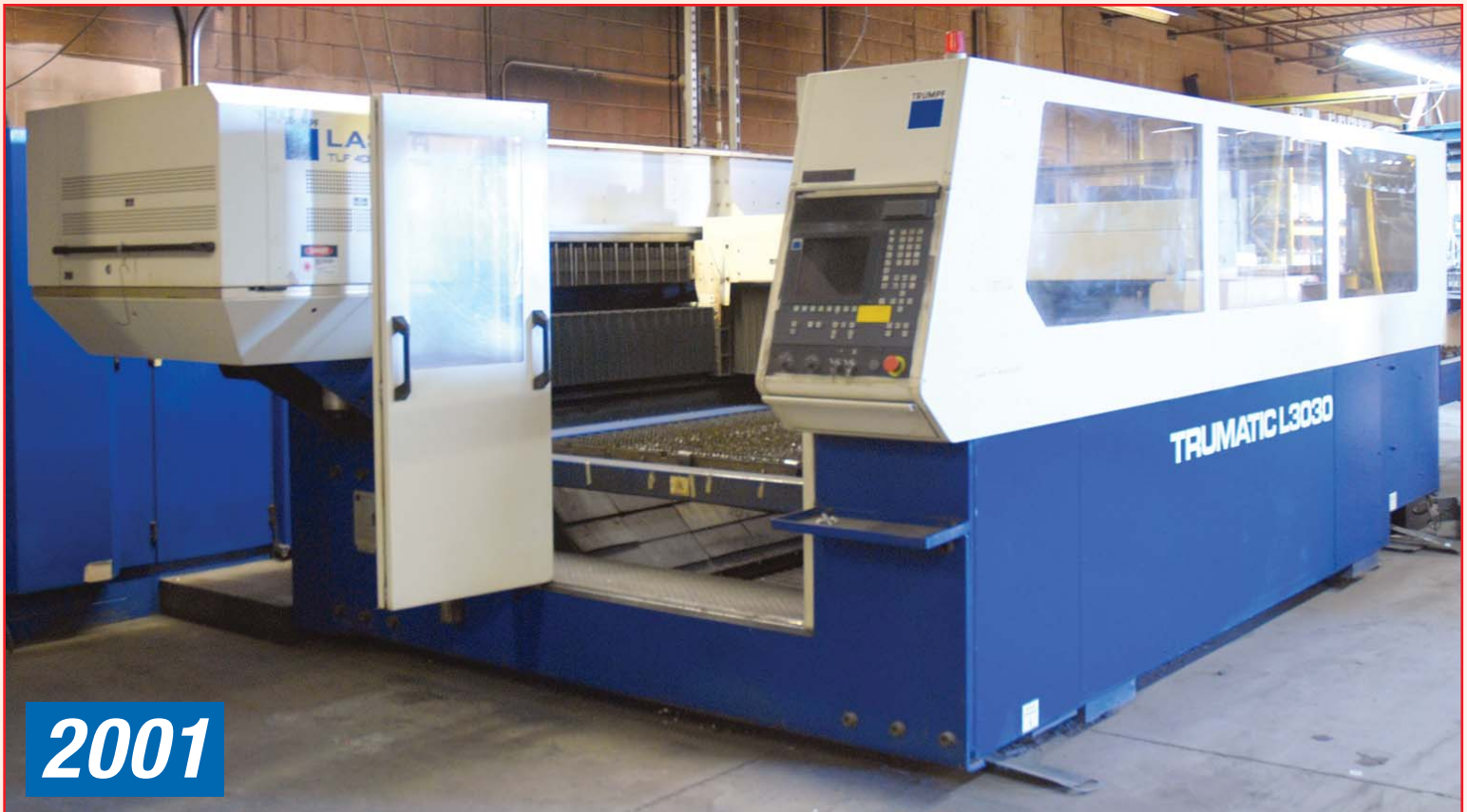
TRUMPF Model Trumatic L3030, TLF 4000 Watt Turbo Resinator, Siemens Sinumerik 840D Control, Automatic Dual Pallet Size 5' x 10', Travels: X-120", Y-60", Z-5", Max Workpiece Weight 1,562 lb, Max Positioning Speed 2,400 IPM Parallel Axis, 3,340 IPM Simultaneous, Dust Collector, Beam On Hours 12,358, s/n A0220A0053