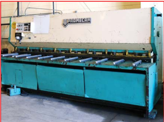
PROMECAM 10' x 1/4" HYDRAULIC SHEAR