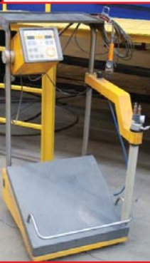
PARTIAL VIEW OF ITW GEMA PAINT GUNS