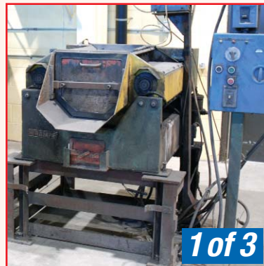
1 of 3

VIEW OF DEVAIR 50 HP & 30 HP COMPRESSORS