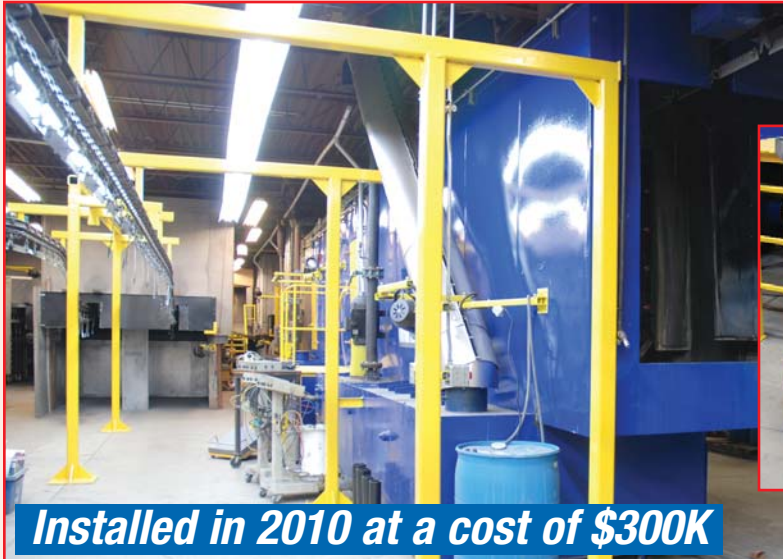
Installed in 2010 at a cost of $300K