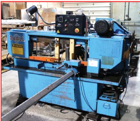
DOALL FULLY AUTOMATIC HORIZONTAL BANDSAW MODEL C916A