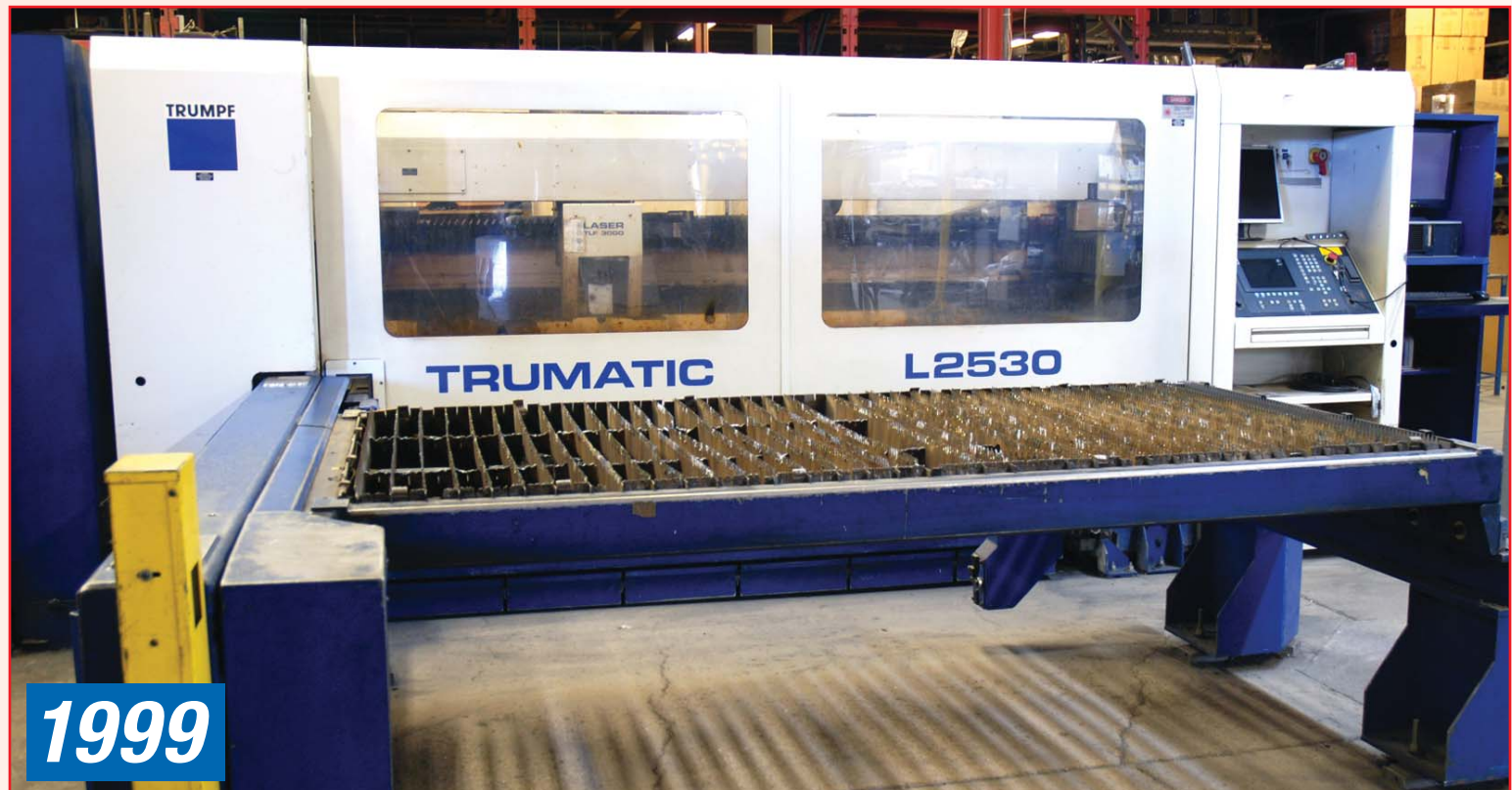
TRUMPF Model Trumatic L2530, TLF 3,000 Watt Laser, Siemens Sinumerik 840D Control, Automatic Dual Pallet Size 4' x 8', Travels: X-98", Y-49", Z-4.5", Max Material Thickness \frac{3}{4} ", Beam On Hours 21,214, KKW Riedel Chiller, 2 Extra Laser Heads, s/n 910283