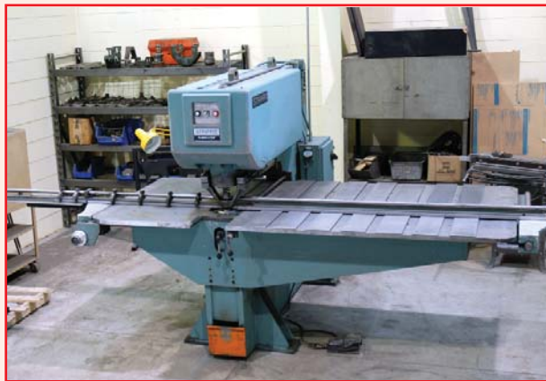
STRIPPIT 40 TON PUNCH, MODEL CUSTOM 30/40