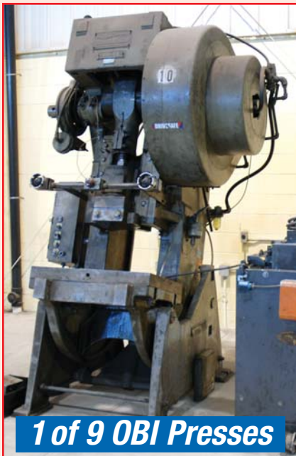
1 of 9 OBI Presses