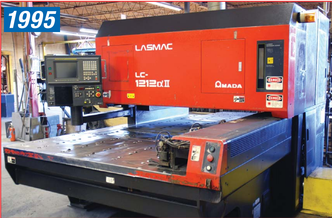
AMADA MODEL LASMAC 1212αII