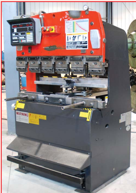
AMADA MODEL RG 25, 27.5 TON CNC PRESS BRAKE

This brochure is only a partial listing. Please visit our websites at www.infassets.com for more detailed listings and photos.