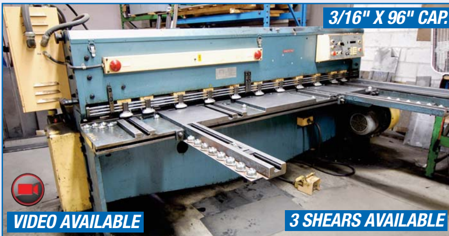
AMADA M-2545 POWER SHEAR