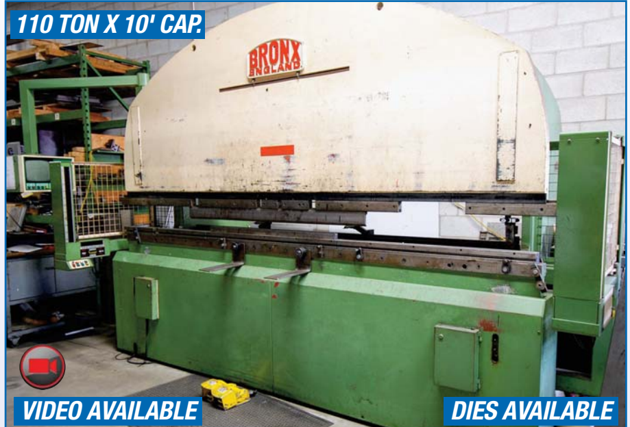
BRONX 110/35CNC/VDU HYDRAULIC PRESS BRAKE