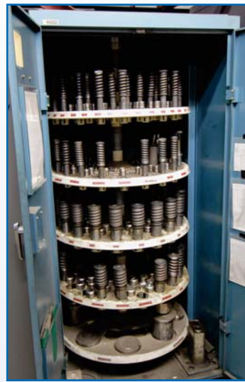
PARTIAL VIEW OF AMADA TOOLING

AMADA OCTO-334 NC Turret Punch , 33 Ton Cap., 300 SPM, Fanuc System 6M Control, s/n 3340454