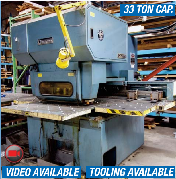
AMADA OCTO-334 NC TURRET PUNCH

385 Admiral Blvd., Unit 20, Mississauga, ON