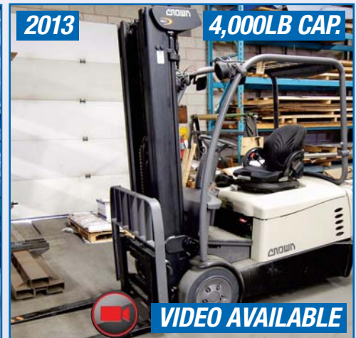
CROWN SC5245-40 3-WHEEL ELECTRIC FORKLIFT