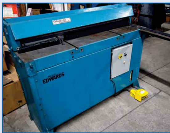
EDWARDS PEDICUT POWER SHEAR