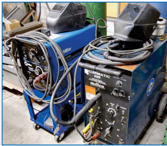
PARTIAL VIEW OF MILLER WELDERS

WELD-O-MATIC FTC Spot Welder, 15KVA, 12" Throat MILLER Millermatic 200 AC/DC MIG Welder MILLER Econotig AC/DC TIG Welder BUSY BEE B178 Drill Press, s/n 4127 CRAFTEX R1108N Bandsaw, 7" Cap., s/n 8116273 COMPAIR BroomWade 6025E07AS Air Compressor, s/n F1290804 SWAN S/W-315 Air Compressor, 5HP COMPAIR TG100 Air Dryer DENISON Multipress (90+) Pipe Stands PLUS: Metal Racking, Workbenches, Sheet Metal, Pallet Jacks, Strapping Carts, Dump Hoppers, Digital Floor Scale, Power & Hand Tools, Office Furniture & Much More!