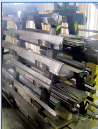
PARTIAL VIEW OF BRAKE DIES