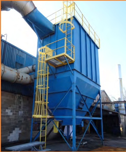
ADVANCED INTEGRATED RESOURCES DUST COLLECTOR