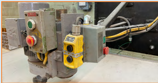
SEW-EURODRIVE DT80N2BM OVERHEAD FOAM ROUTER W/ HYDRAULIC SCISSOR LIFT TABLE

Visit www.bidspotter.com for complete specs, additional photos and videos of machinery in operation