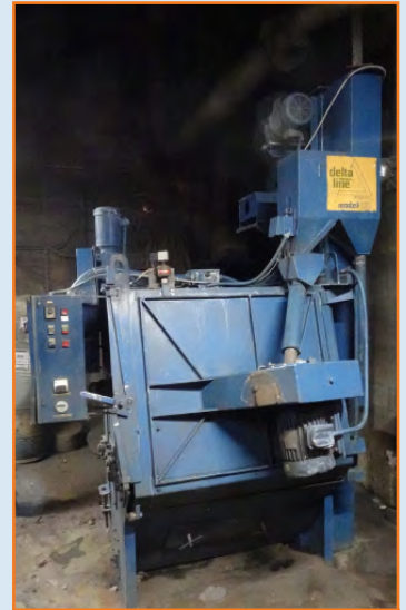
WHEELABRATOR DELTA LINE SHOT BLAST MACHINE

Visit www.bidspotter.com for complete specs, additional photos and videos of machinery in operation