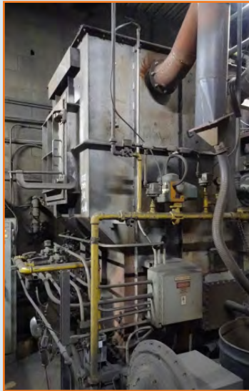
RECLAMATION UNIT S/S, 1000 LBS PER HOUR