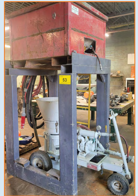
GUNNITE BLASTER REFRACTORIE

Location: 247 Colborne St. W. Brantford, ON, N3T 1M1