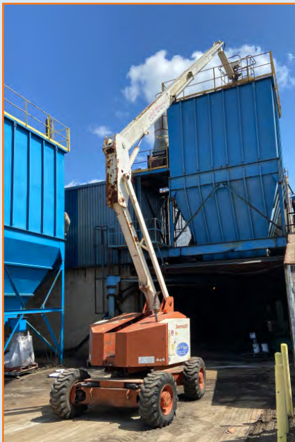
SNORKEL BOOM LIFT

Inspection: Wednesday May 25th 2022, 9am - 4pm or BY Appointment Only