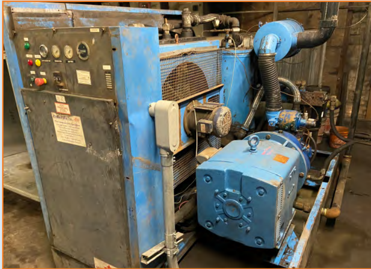
PNEUMEQUIP 6125AL, 125HP COMPRESSOR - MOTOR REBUILT/REWOUND 05/07/21