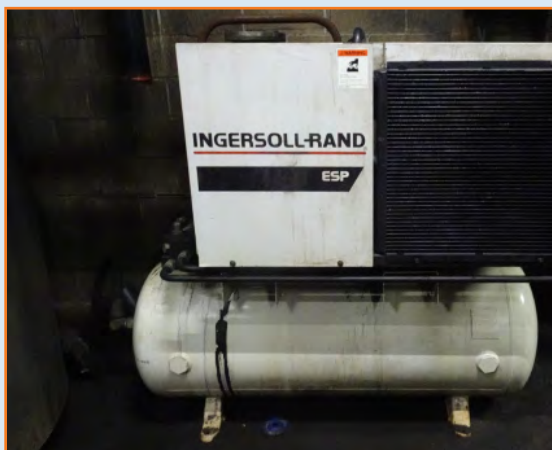
INGERSOLL-RAND EP30-ESP, 30 HP, COMPRESSOR