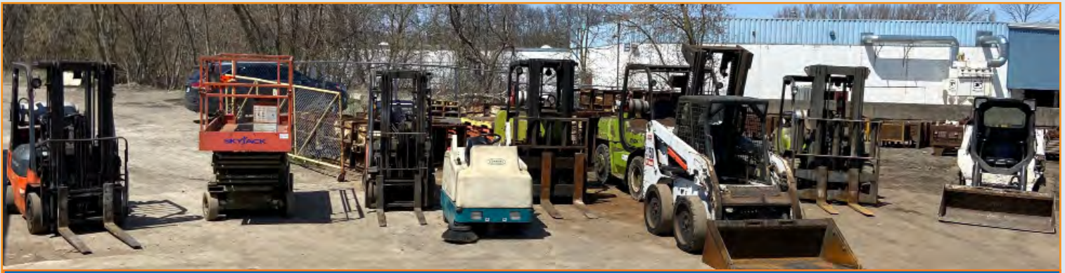
(3) TOYOTA FORKLIFTS, (3) CLARK FORKLIFTS, (3) BOBCAT SKID STEERS, SKYJACK, TENNANT 6200 CLEANER