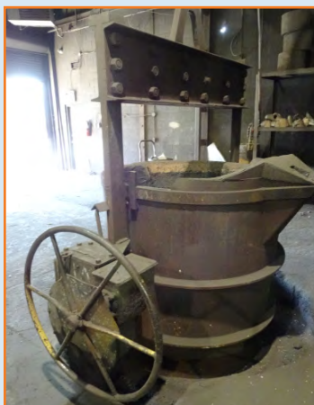
(9) TIPPING LADELS