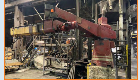
(5) FORDATH MOULD LOADERS