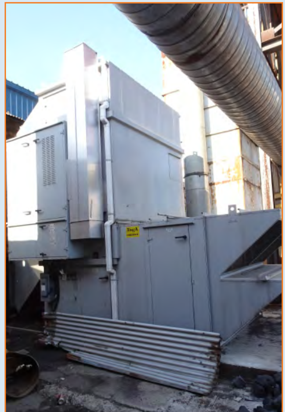
ENGA ENGINEERED AIR DS180/0