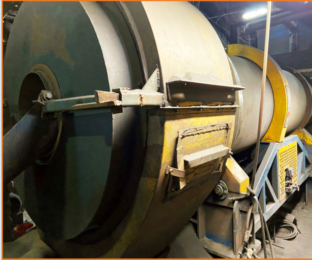
DIDION DM234 ROTARY LUMP CRUSHER/ SAND RECLAIMER