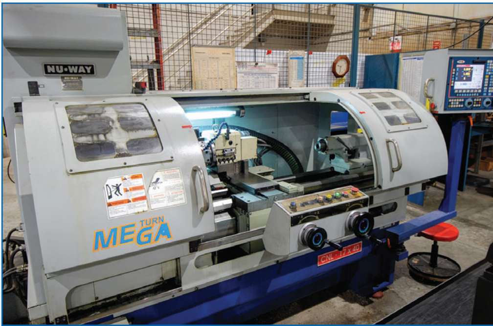
MEGATURN CNL-1740 CNC LATHE