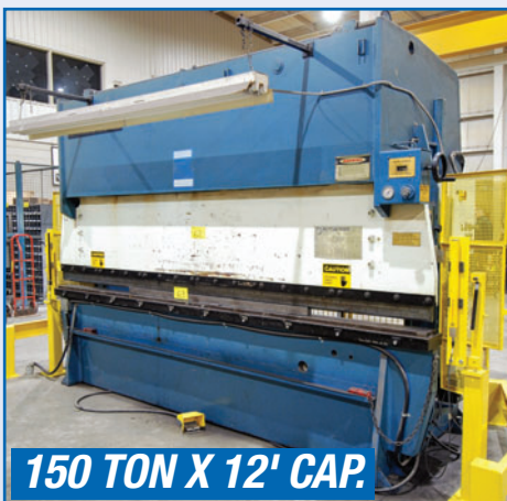
DARBERT AUTOBENDER P12-150 HYDRAULIC PRESS BRAKE