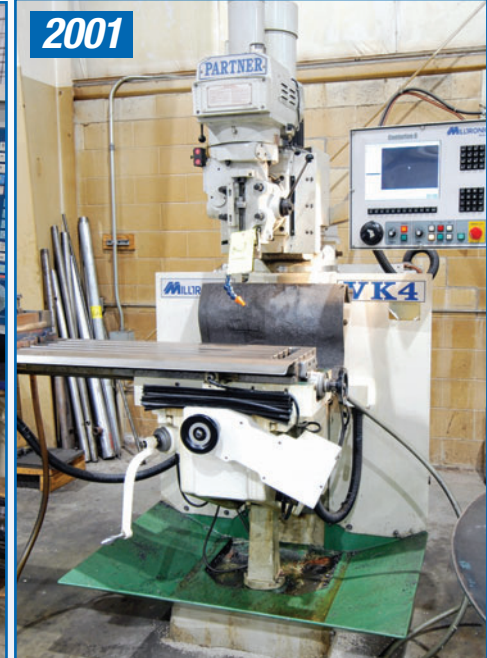
MILLTRONICS VKM4 CNC MILLING MACHINE