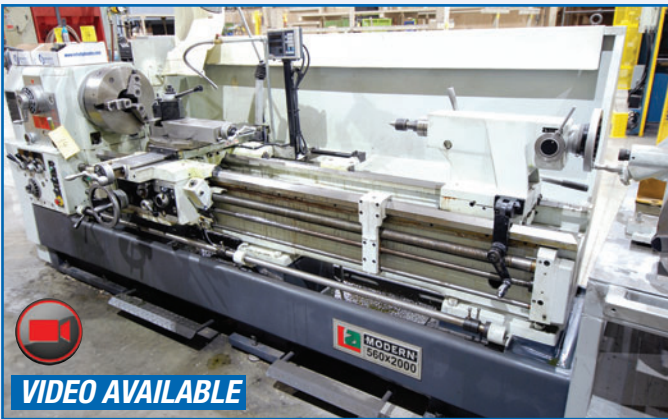
MODERN 560X2000 LATHE