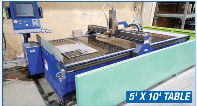
MACHITECH EC-300 PLASMA CUTTING TABLE