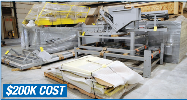
METAMAG MAGNESIUM RECYCLING SYSTEM

This brochure is meant merely as a guide. Infinity Asset Solutions makes no guarantee, expressed or implied, as to the accuracy of the information in this brochure. Buyers should inspect the goods beforehand to satisfy themselves.