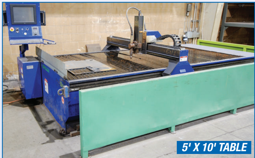
MACHITECH EC-300 PLASMA CUTTING TABLE