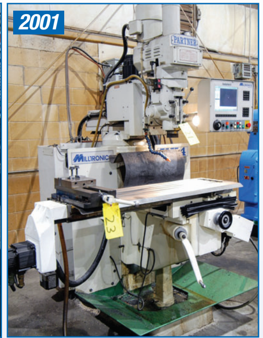
MILLTRONICS VKM4 CNC MILLING MACHINE