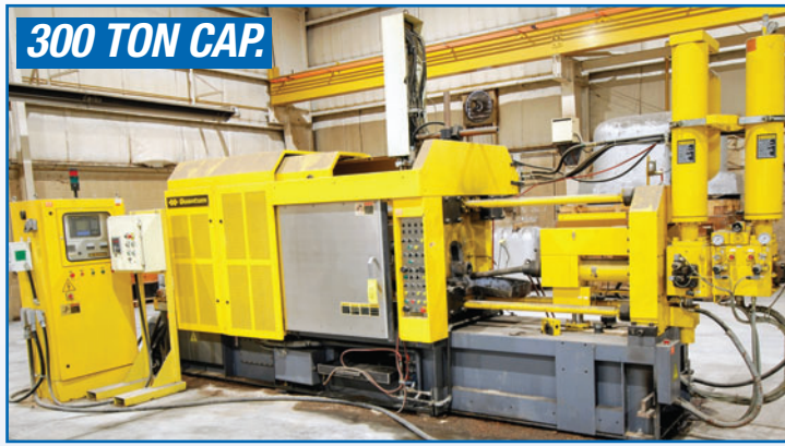
QUANTUM DIE CAST MACHINE