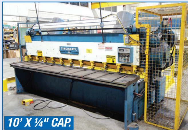
CINNINATI 1810 SHEAR