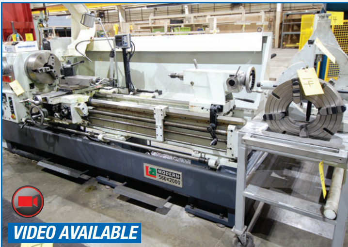
MODERN 560X2000 LATHE