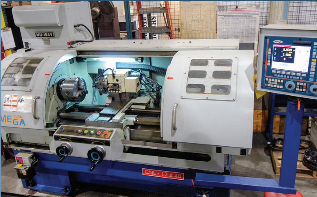
MEGATURN CNL-1740 CNC LATHE