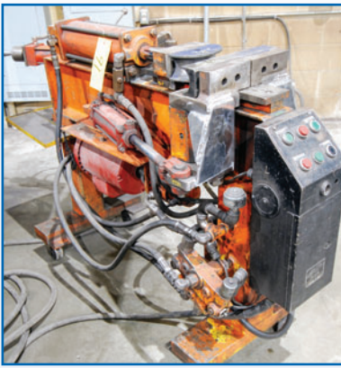
HUTH BEND-A-GRAPH 2000CA HYDRAULIC TUBE BENDER