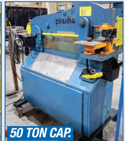
PIRANHA P3 IRONWORKER