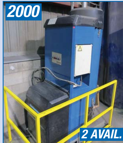
NEDERMAN E-PAK 300 EXHAUST