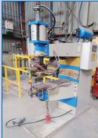
HERON 50KVA SPOT WELDER