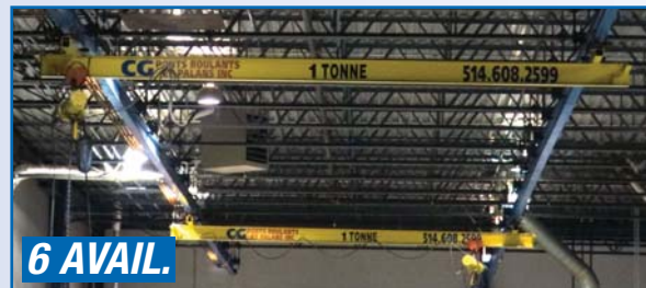
UNDERSLUNG CRANE SYSTEMS WITH 1 TON HOISTS

Bid Live Onsite & Online Via BidSpotter.com