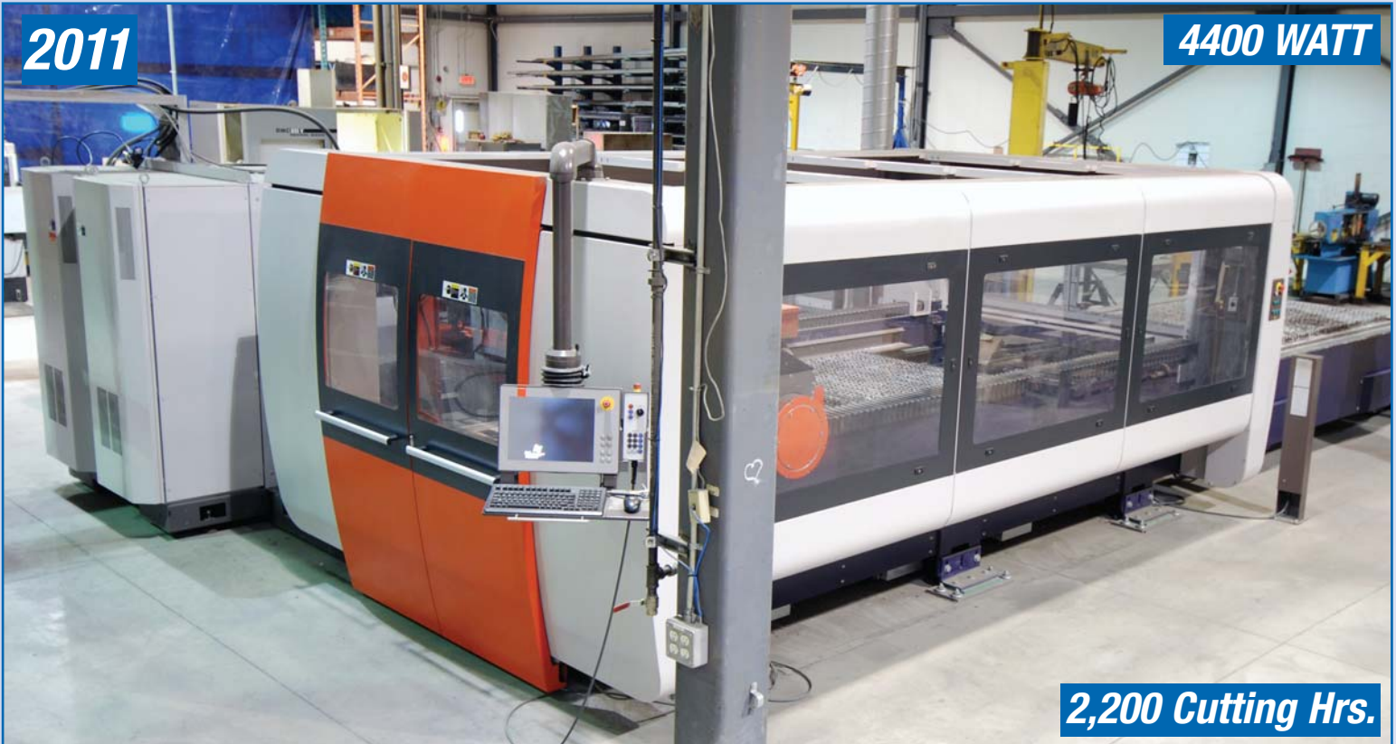
BYSTRONIC BYSPRINT PRO 3015 CNC LASER