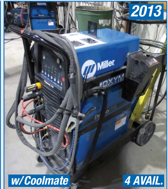
MILLER DYNASTY 350 TIG WELDERS WITH COOLMATE