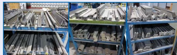
PARTIAL VIEW OF PRESS BRAKE DIES AND TOOLING