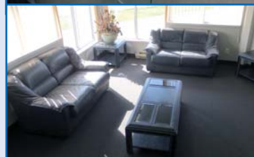
PARTIAL VIEW OF OFFICE FURNITURE