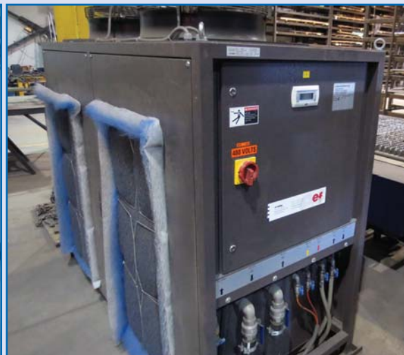
EF COOLER WKL 430

2011 BYSTRONIC BYSPRINT PRO 3015, 4400 WATT CNC Laser with ByVision CNC control, travels: X-120", Y-60", Z-2.75", positioning accuracy +/- .004", max work piece weight 1,654 lbs., max. positioning speed - parallel axis X,Y: 328 ft./min., max positioning speed - simultaneous axis X,Y: 460 ft./min., approx. weight 28,660 lbs., BYSTRONIC BYLASER 4400 WATT power source with 6,100/2,200 hrs., 7.5" & 5" cutting heads, automatic pallet shuttle table, EF COOLER WKL 430, s/n R1119369