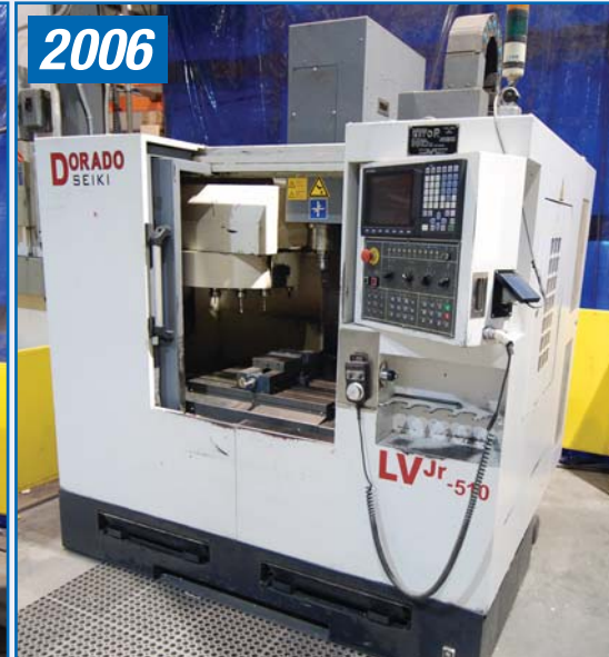
DORADO SEIKI LV JR-510 CNC VERTICAL MACHINING CENTER