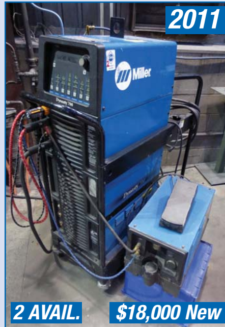
MILLER DYNASTY 700 TIG WELDERS