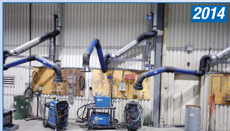
CPI SNORKEL EXHAUST SYSTEM

Bid Live Onsite & Online Via BidSpotter.com