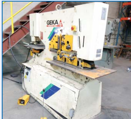
GEKA HYDRACROP 80/SD HYDRAULIC IRON WORKER