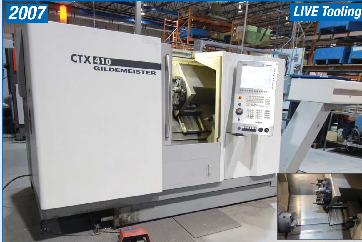
DMG GILDEMEISTER CTX410 CNC LATHE