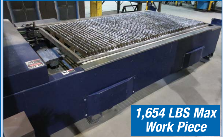
AUTOMATIC PALLET SHUTTLE TABLE