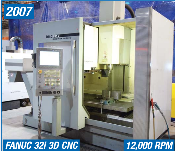
DMG DECKEL MAHO DMC 835V CNC VERTICAL MACHINING CENTER