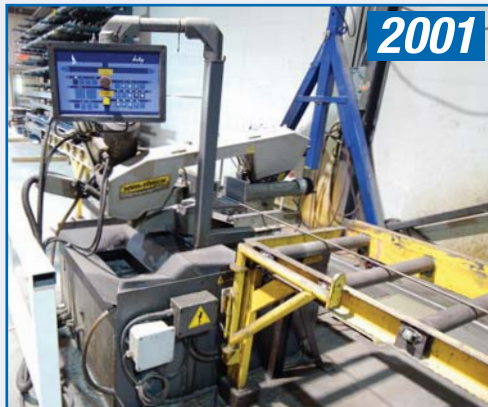
HYDMECH DM-10P HORIZONTAL SAW