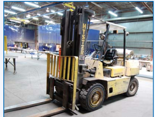
HYSTER H80XL2 LPG FORKLIFT