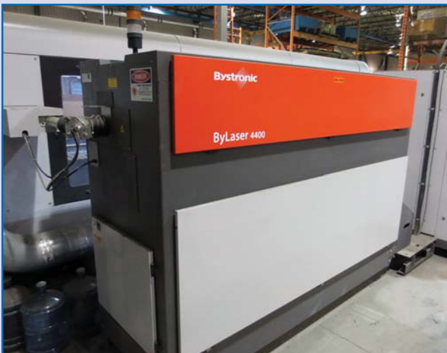
4400 WATT POWER SOURCE