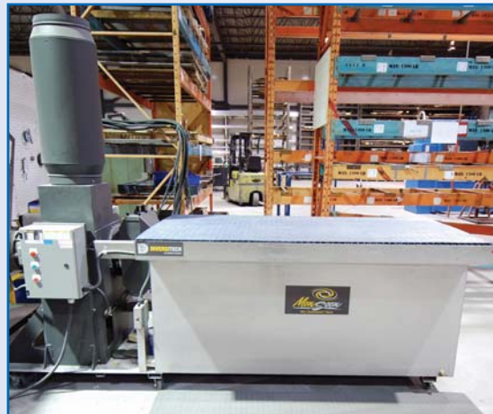
DIVERSITECH MONSOON WET DOWNDRAFT SANDING TABLE