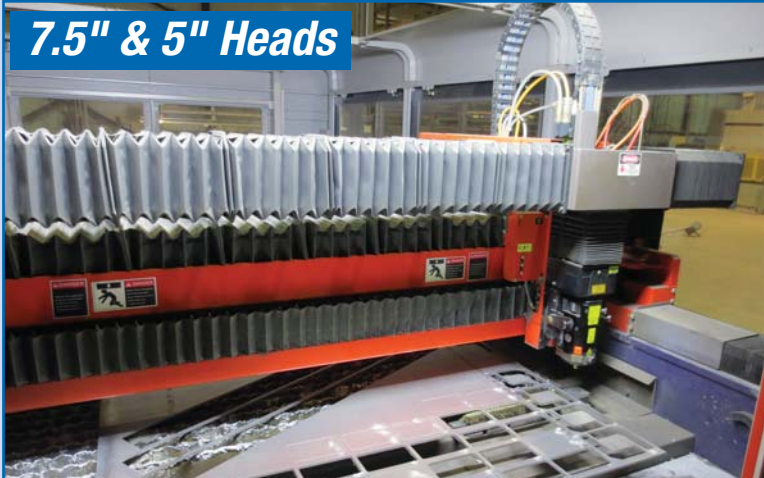
VIEW OF COLUMN AND CUTTING HEAD