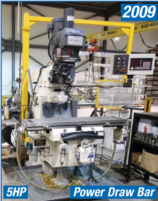
HYPERMILL K36VS VERTICAL MILL