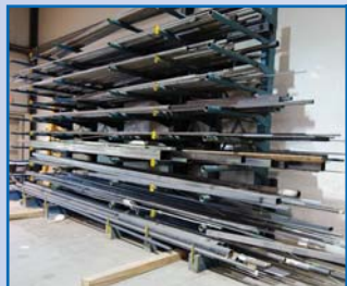
PARTIAL VIEW OF RAW MATERIAL

(2) MILLER DYNASTY 700 TIG welders with COOLMATE 3.5, welding capacity up to 1" aluminum, wireless foot control s/n LK0210762, LG200975L (4) MILLER DYNASTY 350 TIG welders with COOLMATE 3.5 welding capacity, wireless foot control, up to 5/8" aluminum s/n ME301034L, ME240570L, ME320275L, ME240572L HERON DN 50-001-0012 50 KVA spot welder with TE90 MARK II control s/n 213-0001