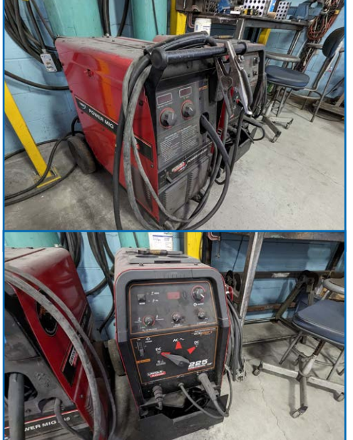
VIEW OF LINCOLN ELECTRIC WELDERS