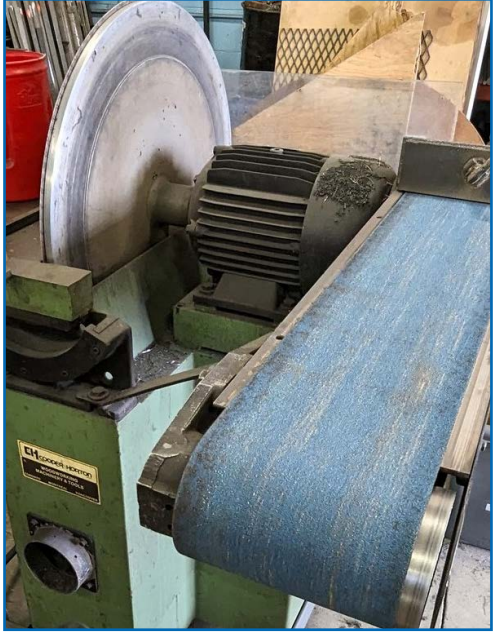
SAMCO DG/60 BELT/DISC SANDER