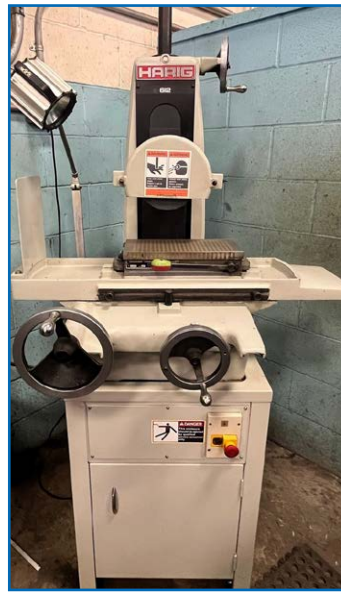
HARIG 612 SURFACE GRINDER