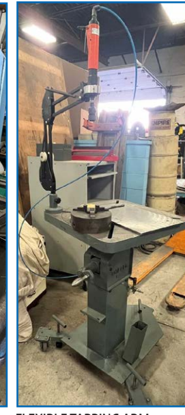
FLEXIBLE TAPPING ARM