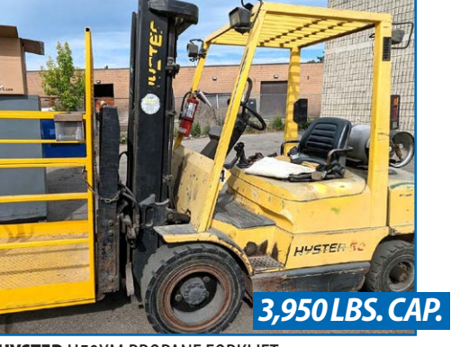
HYSTER H50XM PROPANE FORKLIFT