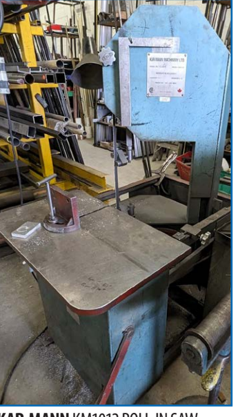
KAR-MANN KM1012 ROLL-IN SAW