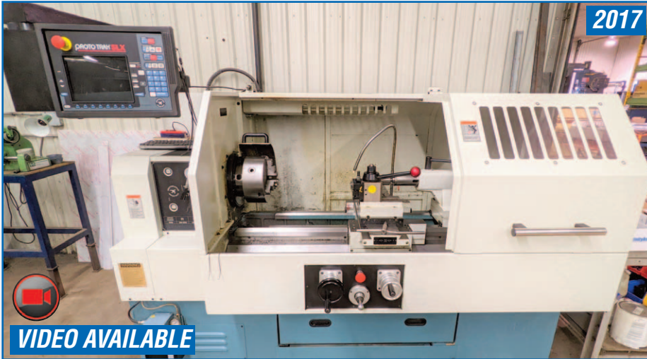
TRAK 1845SX CNC LATHE