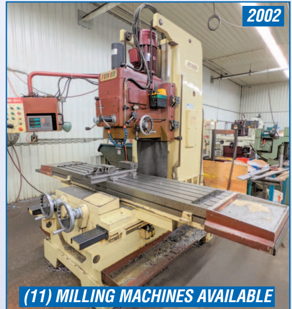
FORTWORTH VBM-5VL VERTICAL MILL

CLOSES: Thursday May 5 th , 11:00 AM (ET)