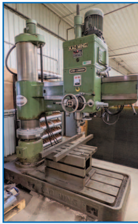
KAO MING KMR-12500DH RADIAL DRILL