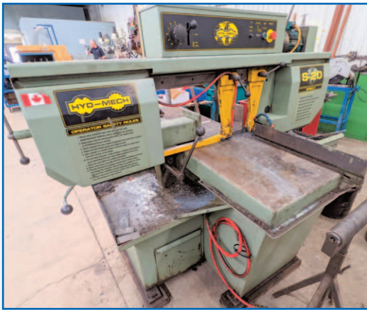
HYD-MECH S-20 BANDSAW