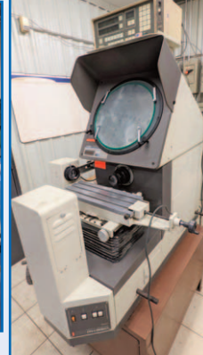
MITUTOYO PH350 OPTICAL COMPARATOR