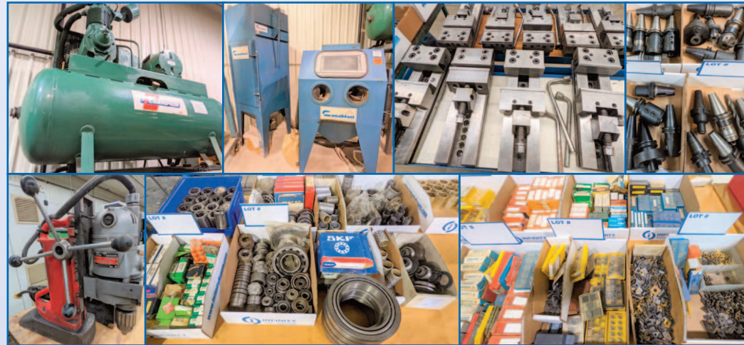
PARTIAL VIEW OF PLANT SUPPORT EQUIPMENT

Visit infinityassets.com for complete specs and additional photos