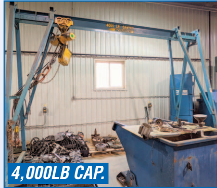
4,000LB CAP. MOTIVATION PORTABLE GANTRY