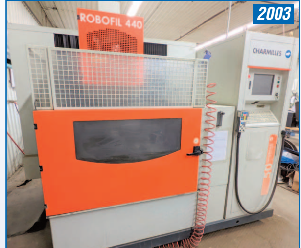
CHARMILLES ROBOFIL 440 CNC WIRE EDM