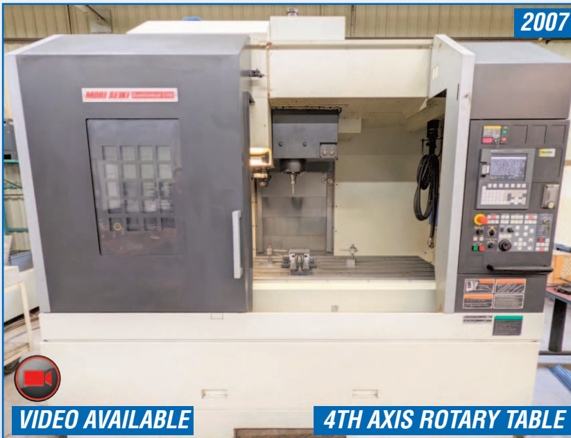
MORI SEIKI DUAL VERTICAL 5100 CNC VERTICAL MACHINING CENTER