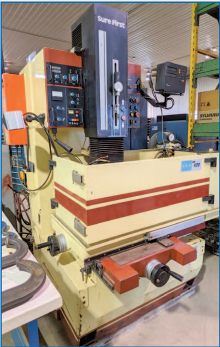
SUREFIRST DM-422 SINKER TYPE EDM

(2) CHEVALIER 618M Manual Surface Grinders, 6" x 18" Magnetic Chuck, s/n's A3846020, A3933017