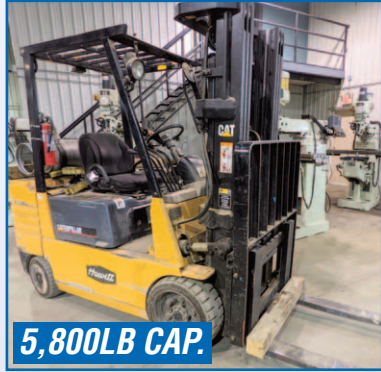
5,800LB CAP. CAT GC30 FORKLIFT

PLUS: LARGE QTY. of Pneumatic Supplies and Hardware, Brass, Copper, Stainless Steel, Mild Steel Raw Material, Roll Forming Dies, Torch Carts, Shop Presses, Tool Cabinets, Ladders, Precision Instruments, Micrometers, Verniers, Height Gauges, Granite Surface Plates, Sine Blocks, Power & Hand Tools, Hardness Testers, Rotary Tables, Arbor Presses, Shop Carts, Die Lifters, Machine Vises, Collets, Hold Down Kits, Tool Holders, Carbide Inserts, Drill Bits, End Mills, Reamers, Shop Vacs, Hydraulic Power Packs, Boring Bars, Chucks, Pallet Racking, Drill Sharpeners, Belt/Disc Sanders, Bench Grinders, Grinding Wheels, Fume Extractors, Dump Hoppers, Parts Washers, Drill Presses, Office Equipment & Much More!