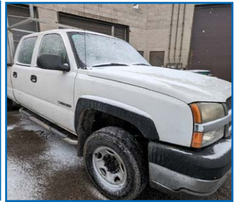
CHEVROLET 2500HD PICKUP TRUCK