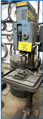
ARBOGA GM 2512 GEAR HEAD DRILL PRESS