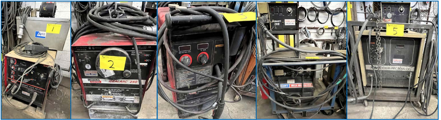
PARTIAL VIEW OF WELDERS