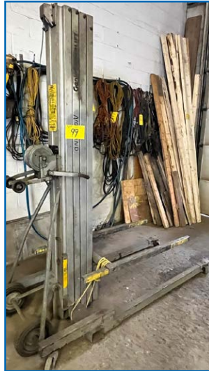
GENIE SUPERLIFT CONTRACTOR LIFT