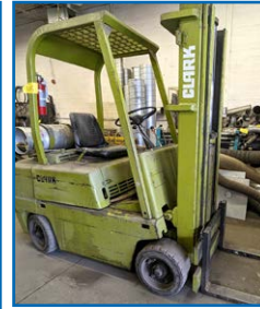
CLARK PROPANE FORKLIFT