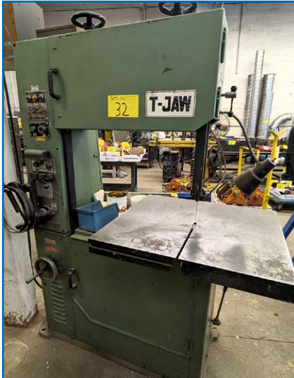
T-JAW VERTICAL BANDSAW