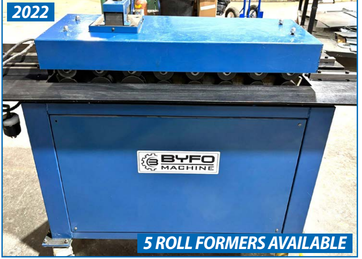
BYFO S LOCK FORMER MACHINE