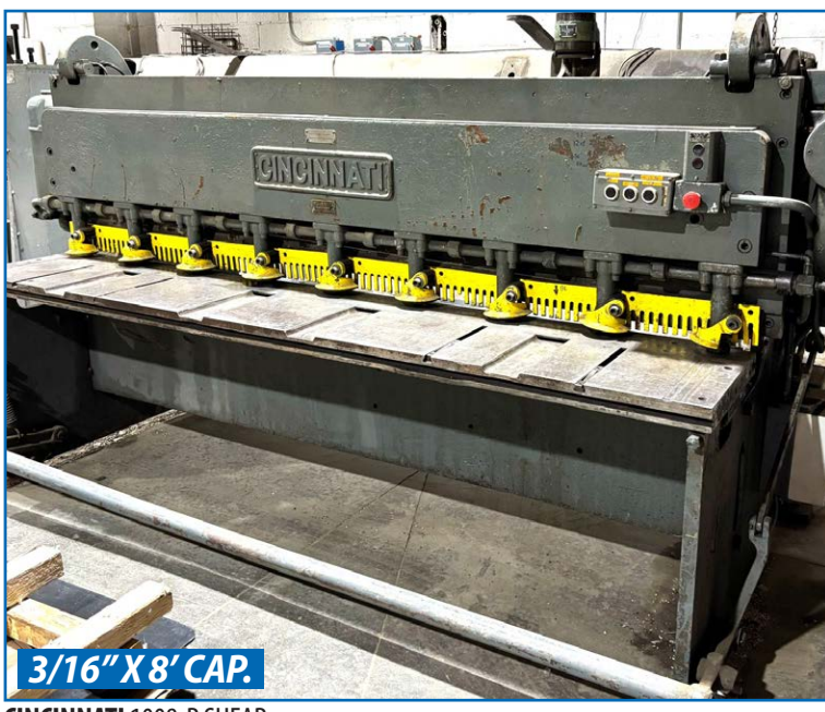
CINCINNATI 1008-R SHEAR