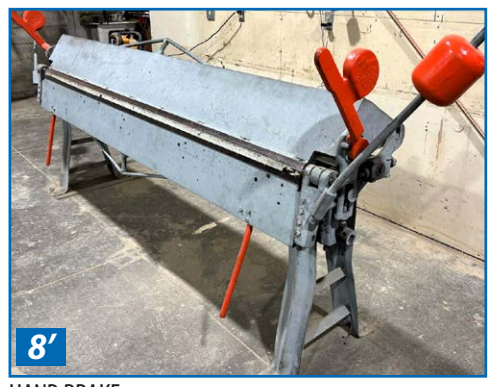
16 G A