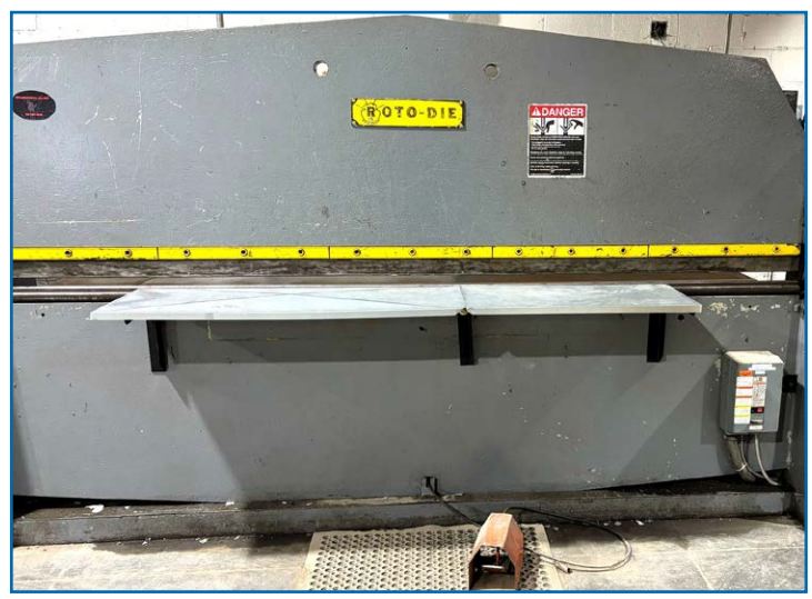
ROTO DIE MODEL 15 HYDRAULIC PRESS BRAKE