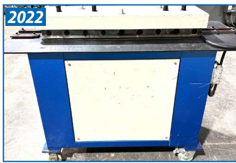
SD YSD-1.0 HVAC DUCT MACHINE