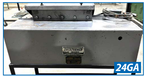
LOCKFORMER ROLL FORMER

PLUS: Miller Welder, Cleat Bender, Slip Roll, Pin Welder, Duro Dyne Air Hammer, Dump Bins, Metal Racks, Ladders, Power & Hand Tools, General Fabrication Equipment & Much More!