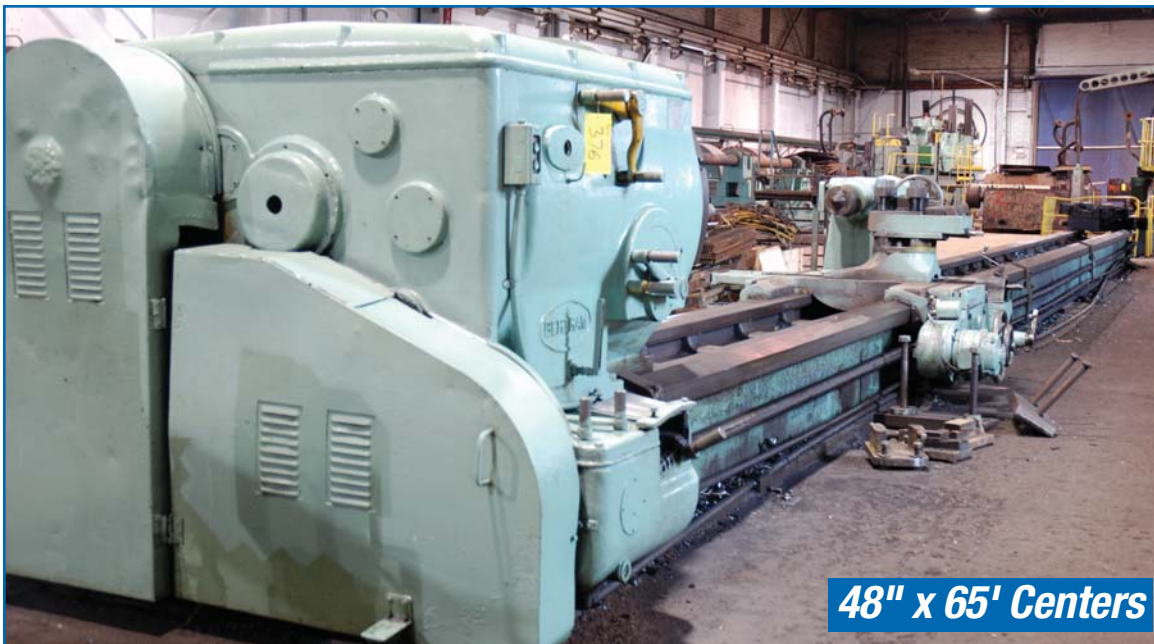
STANKO 1A670-12500 HEAVY DUTY ENGINE LATHE