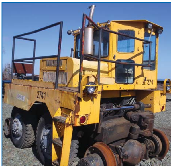
TRACKMOBILE 9TM RAIL SHUNT CAR