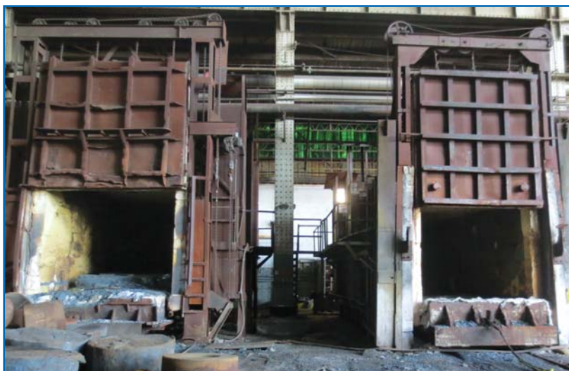
CAR BOTTOM FURNACES

(5) Heavy duty ingot tong handling attachments up to 75 ton capacity, various lifting magnets etc.