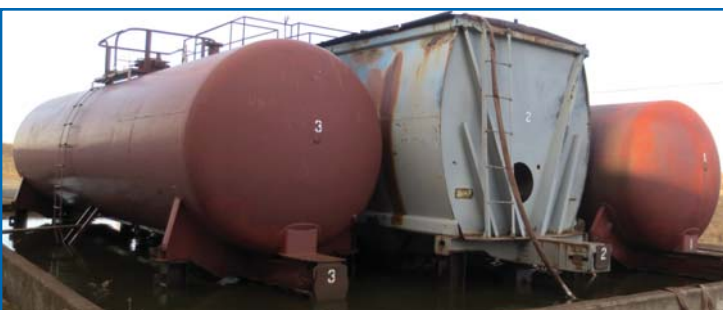
SINGLE WALLED STORAGE TANK, VARIOUS HOLDING TANKS

2010 Double Walled, Vacuum Sealed, 45,000 Liter Capacity storage tank Single walled storage tank, various holding tanks