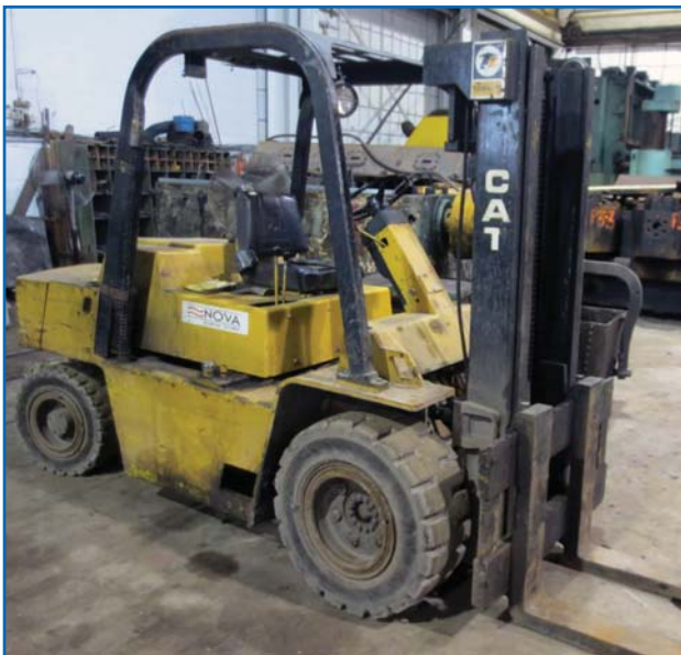
CAT 5,000 LB CAP. FORKLIFT, MODEL S60FT