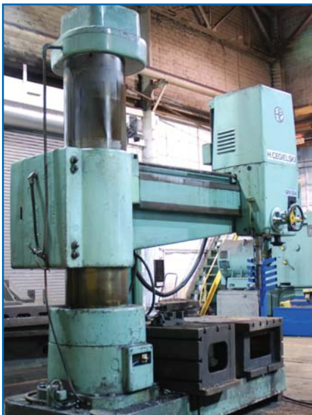
H.CEGIELSKI GRV554 RADIAL ARM DRILL