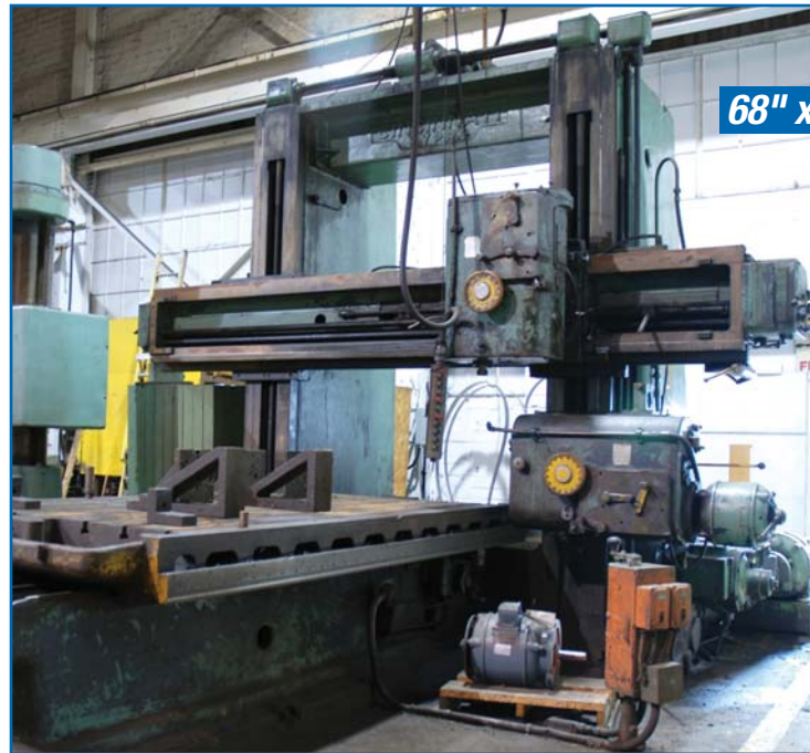
COLLET & ENGELHARD BF 115 HORIZONTAL FLOOR TYPE BORING