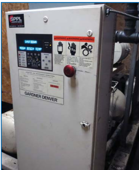
GARDNER DENVER 100HP ROTARY SCREW AC