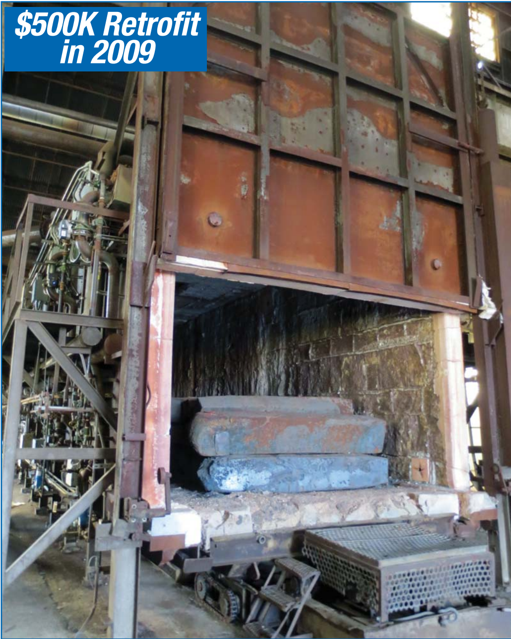
HEAT TREAT FURNACE CAR BOTTOM FURNACE

HEAT TREAT FURNACE recently upgraded 100 ton car bottom furnace with 19 million BTU/hr. @ 60 ambient air, up to 2300 deg F, 1 to 4 zone operating option, working dimensions – approx. 10ft x 10ft. x 60ft long, fibre walls, curb - hard refractory, sand car bottom seal, spare parts, Furnace #11