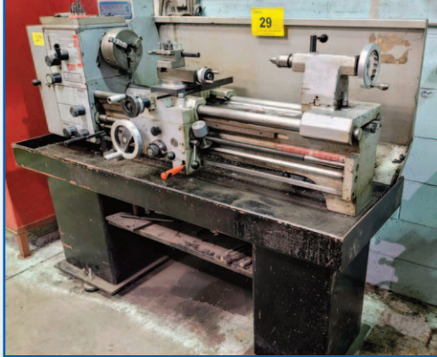
BAXTER APPRENTICE LATHE