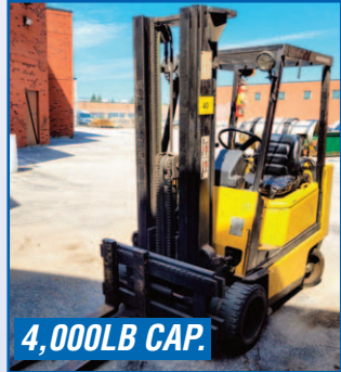
YALE PROPANE FORKLIFT