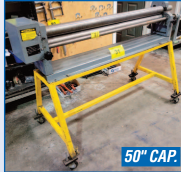
MILD STEEL SLIP ROLLS

BAXTER Apprentice Lathe, 14" x 40", 6" 3-Jaw Chuck, Tool Post, Tailstock