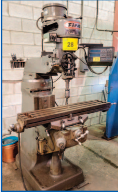
FIRST LC-1-1/2TM VERTICAL MILL

FIRST LC-1-1/2TM Vertical Milling Machine, 9" x 42" Table, ACU-RITE Millmate 2-Axis DRO, Speeds to 2,760 RPM, 2HP, 3 Phase, s/n 75067720