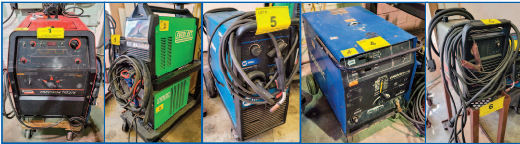
PARTIAL VIEW OF WELDERS

HACO PPM30135 Hydraulic Press Brake, 150-Ton x 10' Cap., s/n 58979, COMP-U-BEND 610 Plus CNC Back Gauge