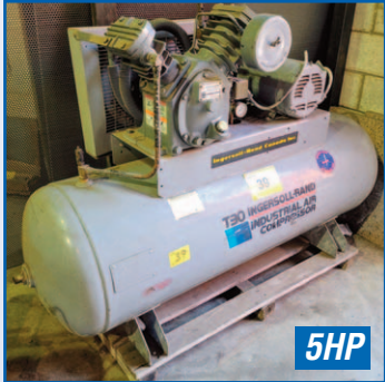
INGERSOLL-RAND T30 COMPRESSOR