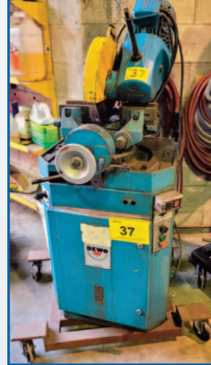
BEWO COLD SAW