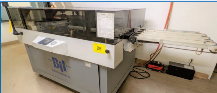
BURGESS INDUSTRIES INC. ACB2440-CTP ADJUSTABLE CUT OFF SEMI-AUTOMATED PUNCH/PLATE BENDER