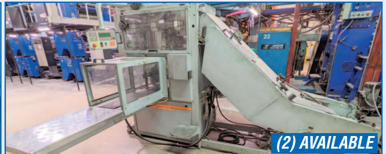
GAMMERLER STC-700 COMPENSATING STACKER