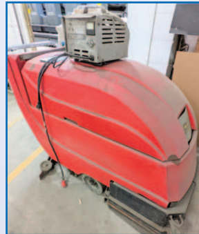
FACTORY CAT FLOOR CLEANER