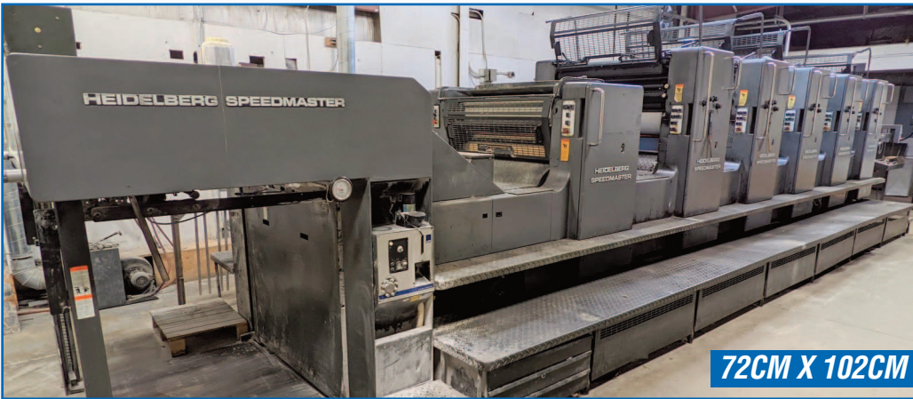
HEIDELBERG 102 FPL SPEEDMASTER OFFSET SHEET FED PRINTING PRESS