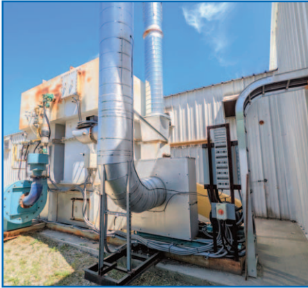
TANN L&E TR-390 REGENERATIVE THERMO OXIDIZER