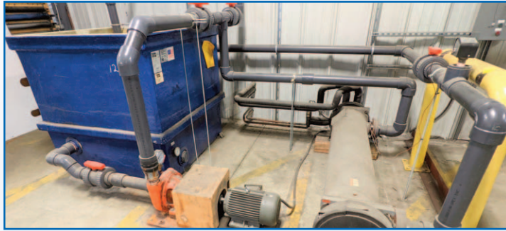
THERMAL CARE PTF500 CHILLER