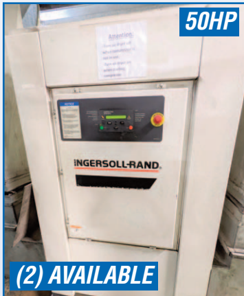
(2) AVAILABLE INGERSOLL-RAND SSR-EP50SE COMPRESSOR