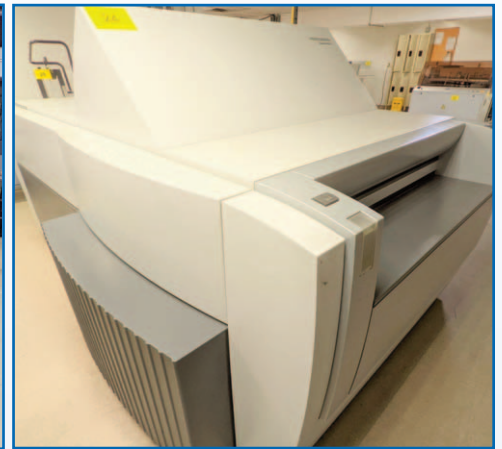
HEIDELBERG SUPRASSETTER 105 COMPUTER TO PLATE SYSTEM PLATESETTER