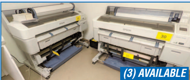
PARTIAL VIEW OF EPSON LARGE FORMAT PRINTERS