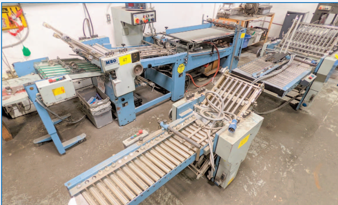
MBO B23-C CONTINUOUS FEED PAPER FOLDER W/ 2 RIGHT ANGLES, 32 PAGE FOLDER

KOMATSU FG25ST-14 Propane Forklift, s/n 592445A, 4,400lb Cap., 188" Max Lift, 3-Stage Mast, Side Shift, Solid Tires, Approx. 12,932hrs