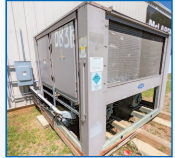
CARRIER 30GTN040-920GA CONDENSING UNIT