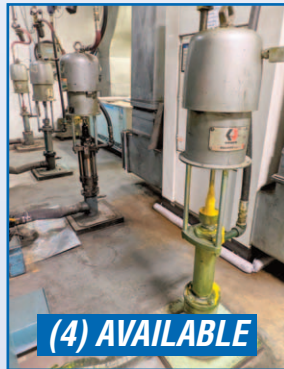
(4) AVAILABLE GRACO POWERFLO PUMPS