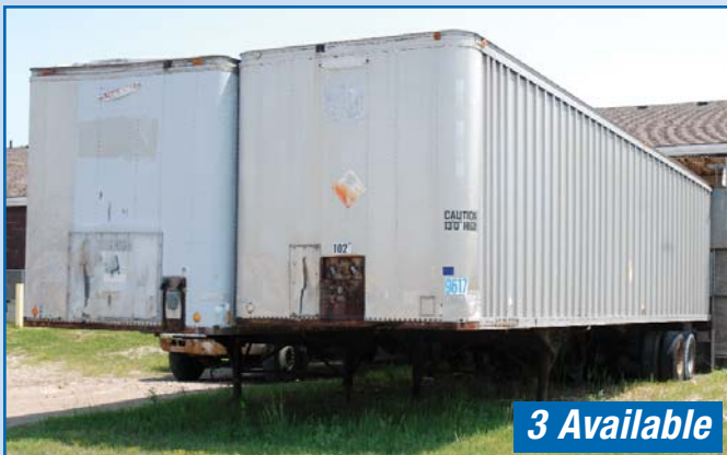
53' STORAGE TRAILERS