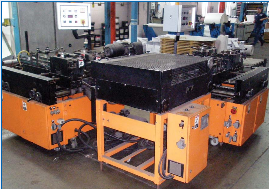
GAMMERLER 3 KNIFE INLINE TRIMMER-SEPARATE TRIMMING AND BUMP TURN UNITS MODEL RS92/530 SN 421, MODEL RS 530/ SN 426, MODEL 1530 SN 405