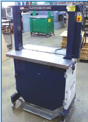
MOSCA MODEL RD-M-P2 PLASTIC BANDING MACHINE SN 56969