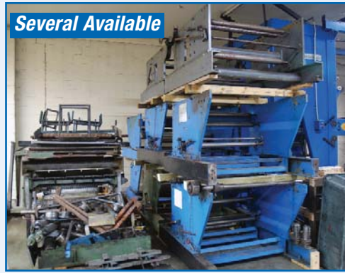
Several Available KING ROLL STANDS, 42" AND 50"