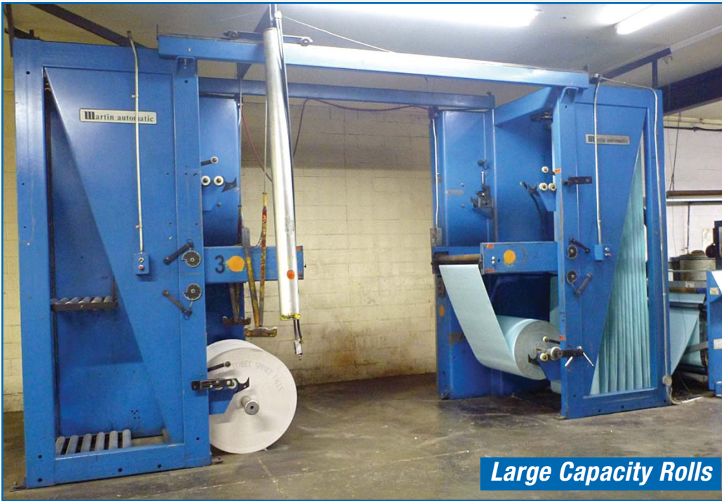
MARTIN AUTOMATIC SPLICER-DOUBLE 50" DIAMETER ROLLS