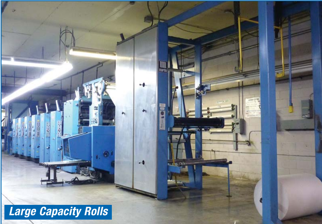
MARTIN AUTOMATIC SPLICER-SINGLE 50" DIAMETER ROLLS