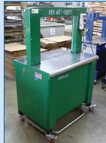
PPI PACKAGING PRODUCTS MODEL HS65-SERIES PLASTIC BANDING MACHINE SN 11039892