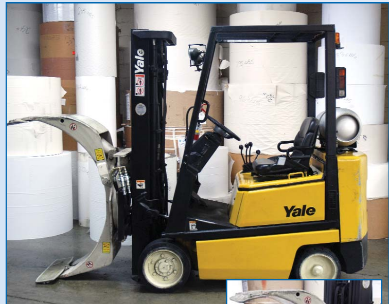
YALE 2500 LB PROPANE FORKLIFT, 3 STAGE, 2981 HOURS. 48" FORKS