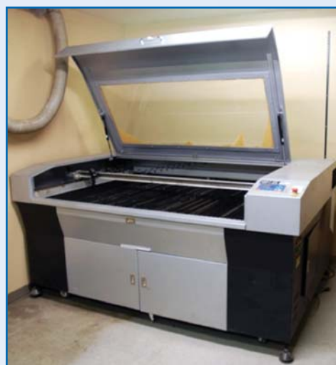
LASER ENGRAVING CUTTING SYSTEM MOD. 1612, 66" X 48" TABLE SIZE, TRAVELS: 63" X 47", 100 WATT, AIR PUMP S/N: 08042A028