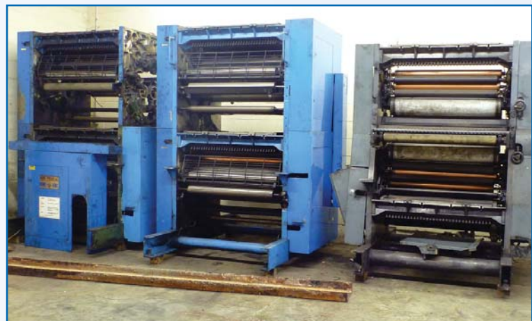
COLOUR KING AND NEWS KING PRESS UNITS PLUS A LARGE INVENTORY OF NEW AND USED PRESS PARTS