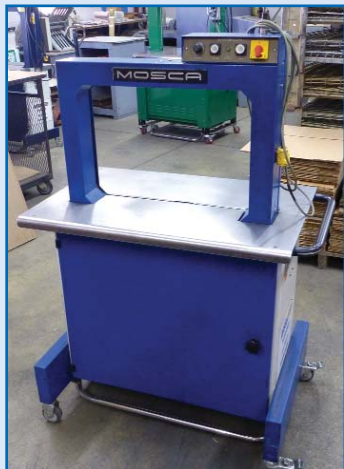
MOSCA MODEL RD-M-P PLASTIC BANDING MACHINE SN 38683