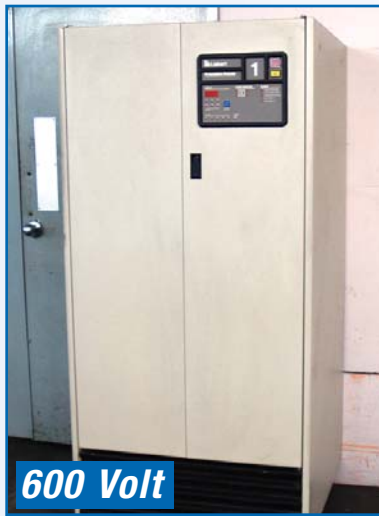
LEIBERT PRECISION POWER 1 600 VOLT POWER SUPPLY MODEL PPB050Q SN 15761A