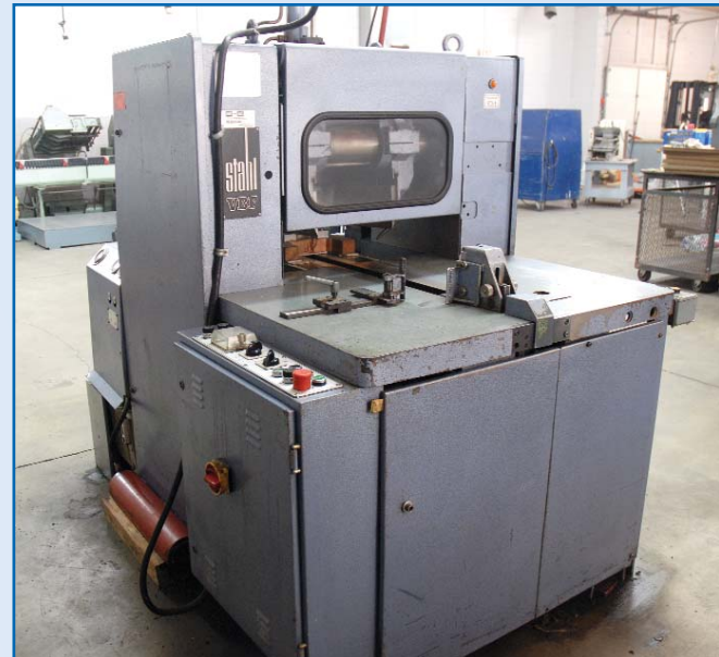
STAHL MODEL VBF [3 KNIFE] TRIMMER, BELT CONVEYOR, SN 716