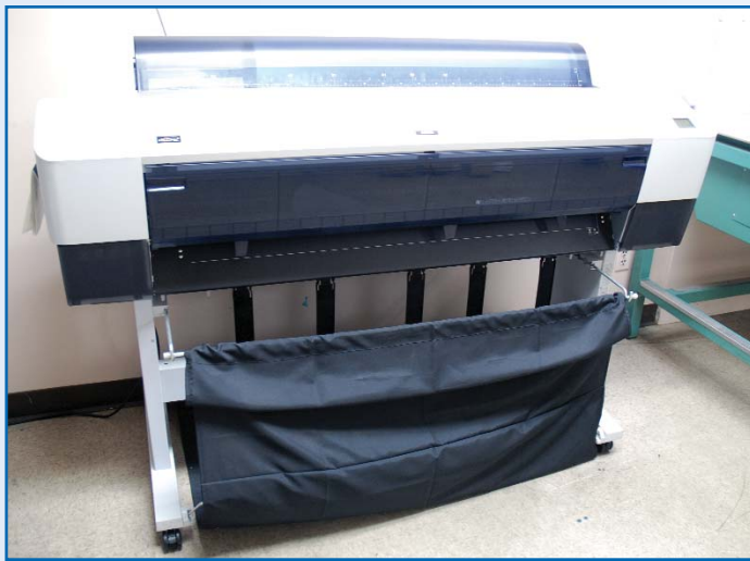
EPSON MODEL PRO9800 PLOTTER