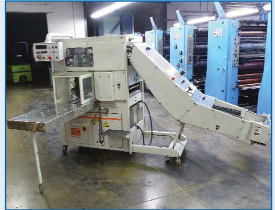
GAMMERLER STACKER KL501/1 WITH DENEX LASER COUNTER AND DUMP GATE, SN 094-5356