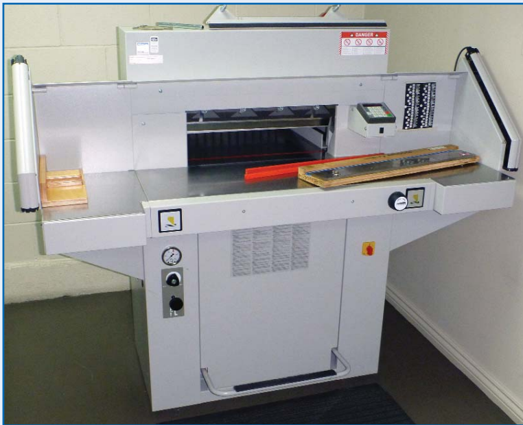
EBA GUILLOTINE CUTTER MODEL 551-06 WITH LIGHT CURTAINS AND SPARE BLADES, EBA PUSH BUTTON CONTROLS ALSO AVAILABLE: CAMPEOR-GERGEK GUILLOTINE PAPER CUTTER