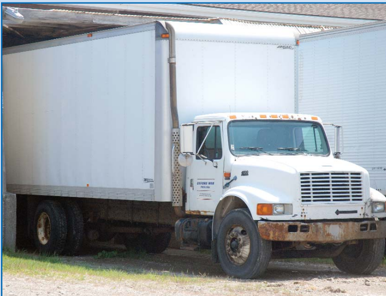
INTERNATIONAL 4700 DT466E STRAIGHT TRUCK, 250,000K