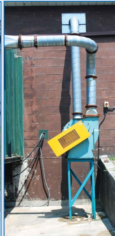
DUALTECH INDUSTRIES VACUUM SYSTEM WITH SPEED REGULATOR, CUSTOM DESIGNED FOR INLINE TRIMMERS, TB WOODS E-TRAC X2C AC INVERTER CONTROL