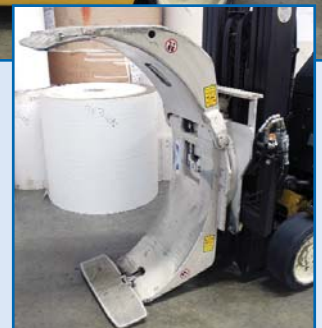
SS CRG+CASCADE PAPER ROLL CLAMP, MODEL 25F-RCF-06A, 37.5"