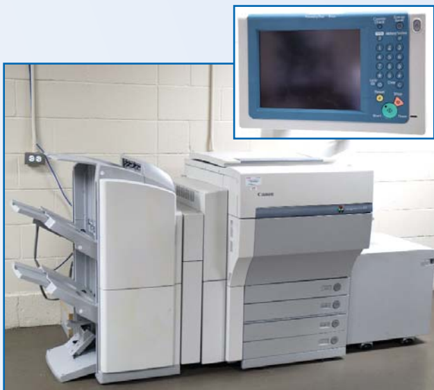
12X18 CANNON IMAGE PRESS PHOTOCOPIER C1 SN TKW01119