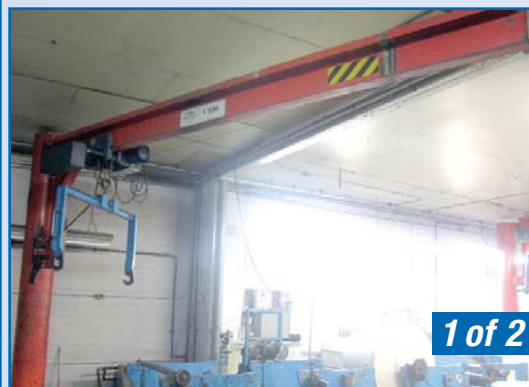
OBRIEN 1 TON JIBS 16" COLUMN, PENDANT CONTROLS