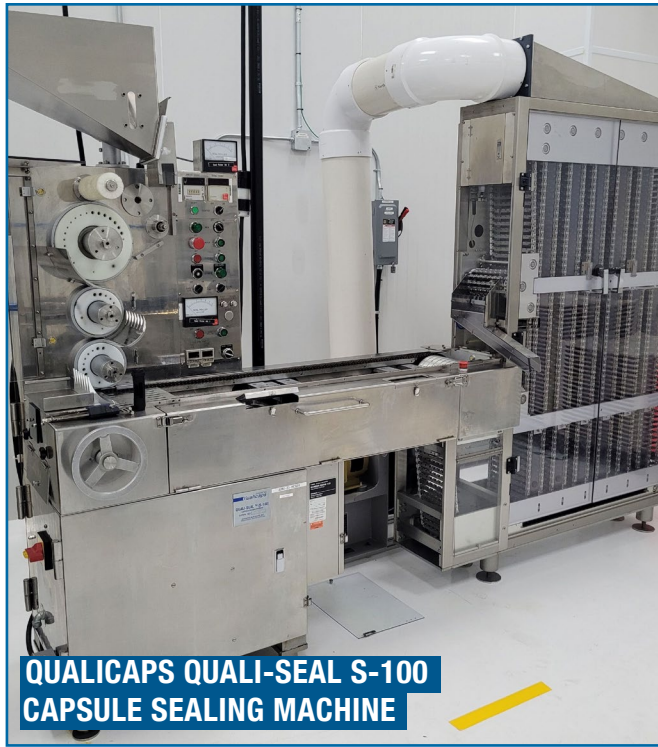
QUALICAPS QUALI-SEAL S-100 CAPSULE SEALING MACHINE