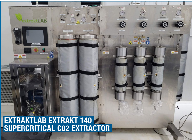
EXTRAKTLAB EXTRAKT 140 SUPERCRITICAL CO2 EXTRACTOR