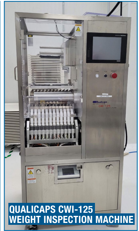
QUALICAPS CWI-125 WEIGHT INSPECTION MACHINE