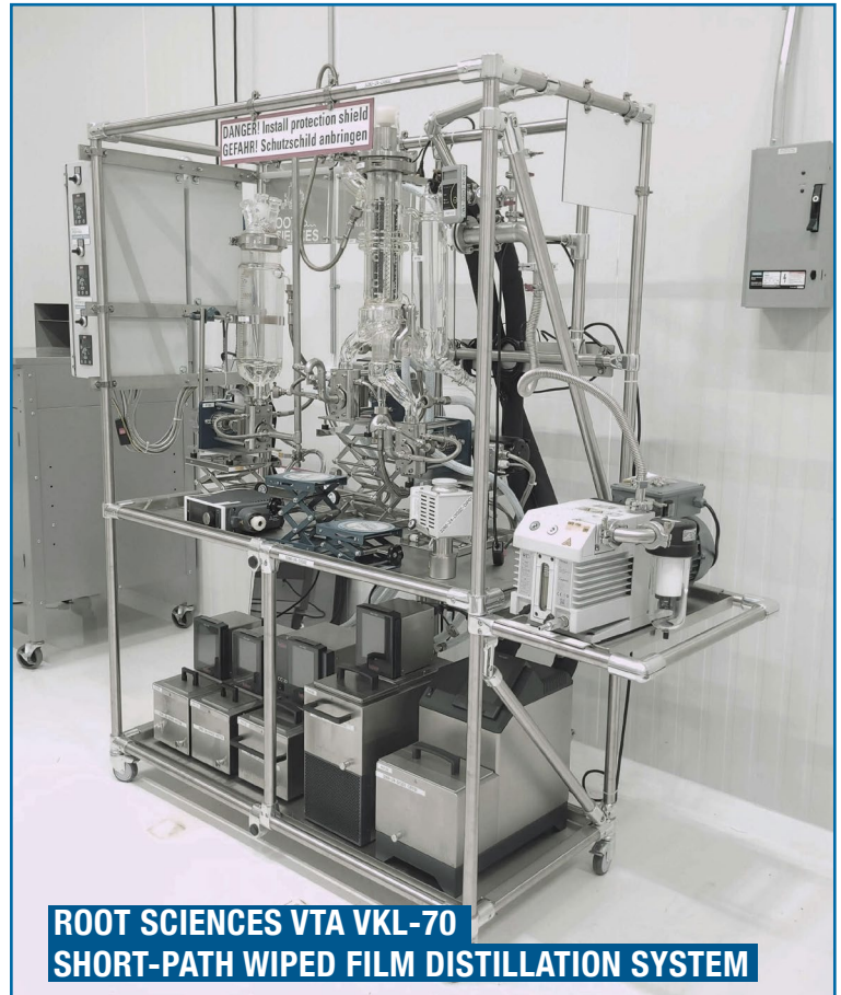
ROOT SCIENCES VTA VKL-70 SHORT-PATH WIPED FILM DISTILLATION SYSTEM