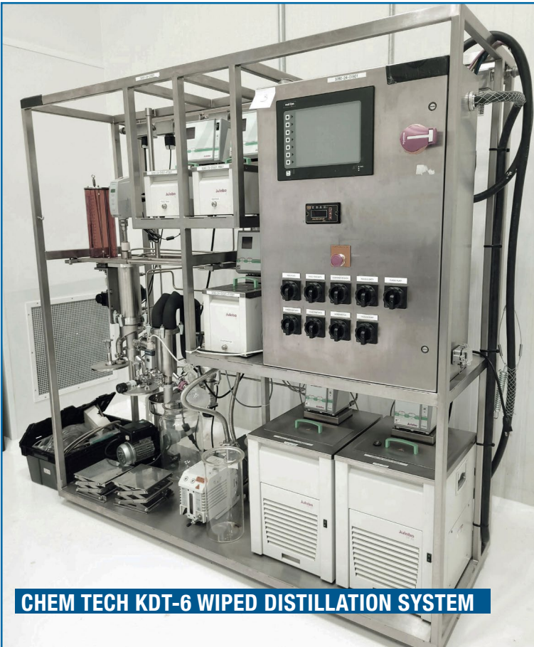
CHEM TECH KDT-6 WIPED DISTILLATION SYSTEM