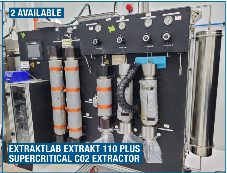
EXTRAKTLAB EXTRAKT 110 PLUS SUPERCRITICAL CO2 EXTRACTOR