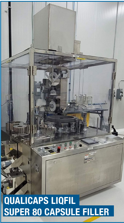
QUALICAPS LIQFIL SUPER 80 CAPSULE FILLER