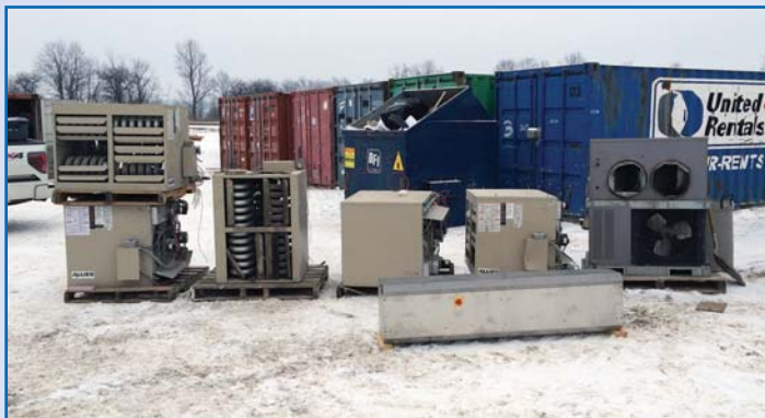
4 Heavy Duty Propane Heaters