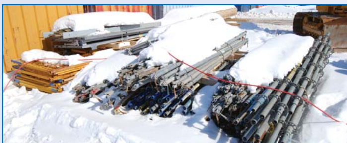
Partial View of Scaffolding