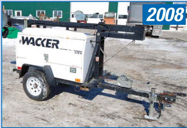
WACKER Plate Tamper, Model DPU4545, sn 10059371