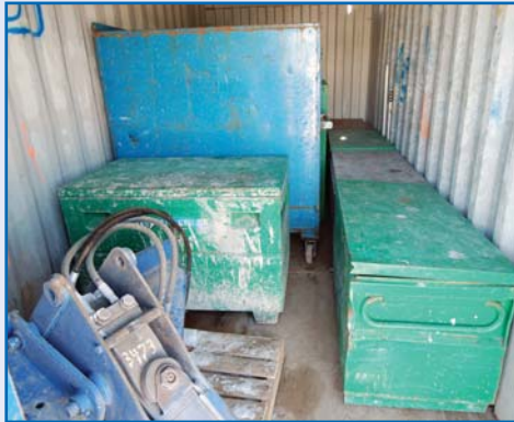
Greenlee Job Boxes