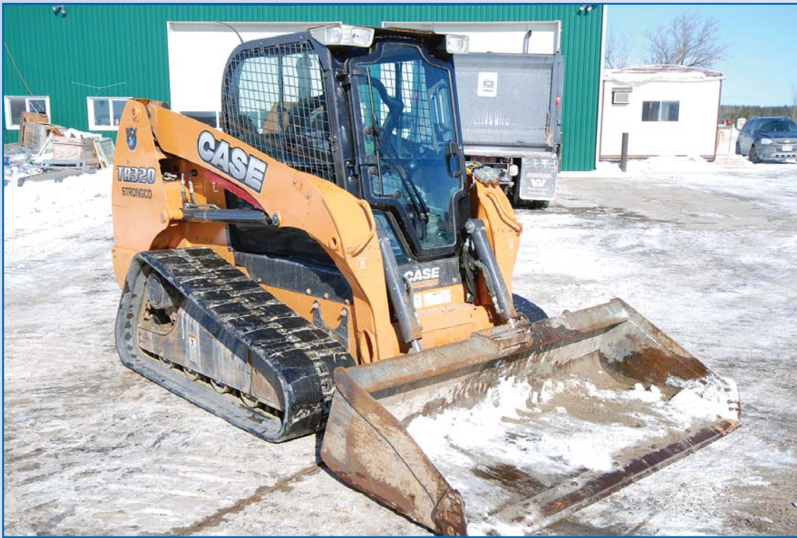
CASE Skidsteer Model TR320, Rubber Tracks, 1,635 hrs, sn NBM440290

This brochure is meant merely as a guide. Infinity Asset Solutions makes no guarantee, expressed or implied, as to the accuracy of the information in this brochure. Buyers should inspect the goods beforehand to satisfy themselves.