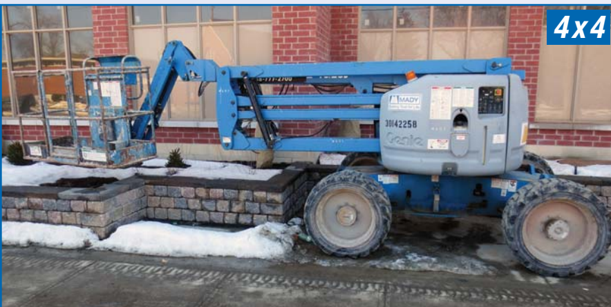
GENIE 4 WD Knuckle Boom, Model Z45/25J, 4x4, 2,574 hrs, sn 30142258