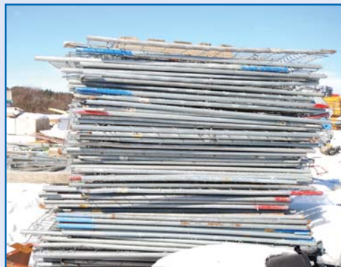
Partial View of Fencing