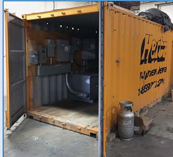
Electrical / Power Distribution Shipping Container with Breakers, Transformers Etc.