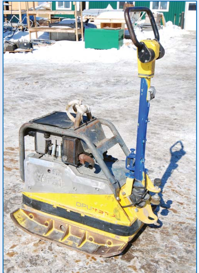
WACKER Plate Tamper, Model DPU4545, sn 10059371