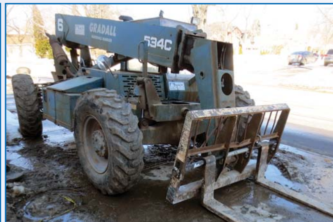
GRADALL Telehandler, Model 534C-6, 40' Lift, 6,000 lb Capacity, 6,236 hrs, sn 288352