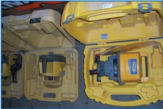
Partial View of Laser Levels