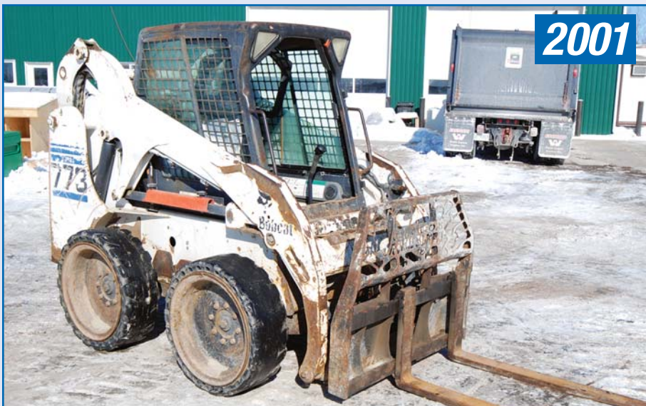
BOBCAT Skidsteer, Model 773 Turbo, Fork & Bucket Attachments, 4,762 hrs, sn 519023299