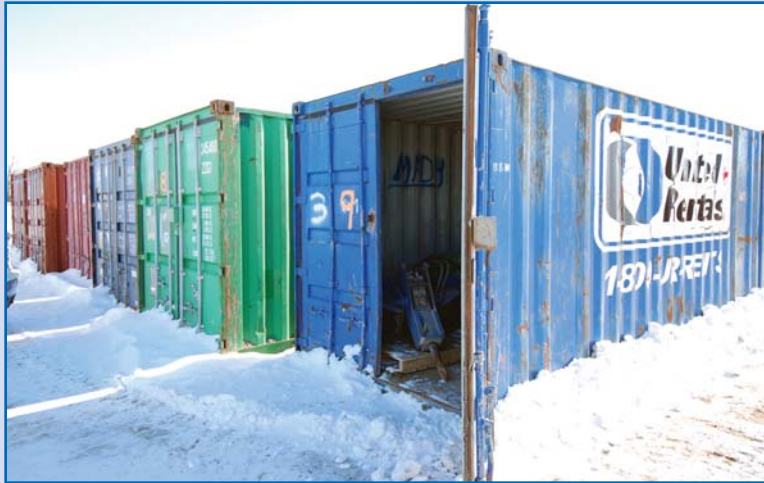
(18) 20' Shipping Containers, Approx: 33.2 CU.M., 1,170 CU.FT., Max Cargo 62,310 lb Cap.