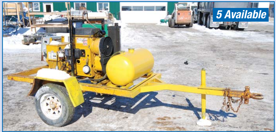
NEWAGE Generator, Model 2M4112, 1,866 hrs, Trailer Mounted