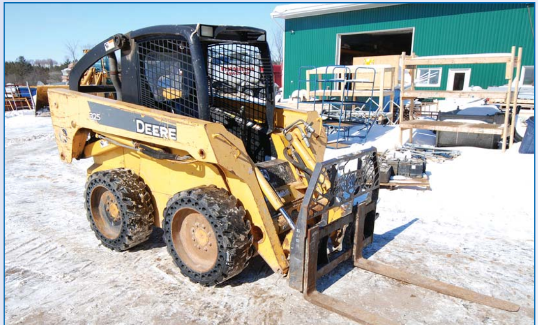
JOHN DEERE Skidsteer, Model JD 325, 2,344 hrs, sn T00325A103906

This brochure is meant merely as a guide. Infinity Asset Solutions makes no guarantee, expressed or implied, as to the accuracy of the information in this brochure. Buyers should inspect the goods beforehand to satisfy themselves.