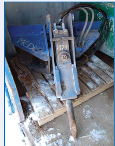
Hydraulic Jackhammer Attachment For Skid Steers