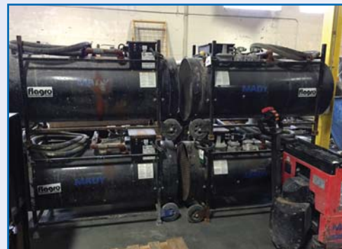
Partial View of 4 Gas Heaters