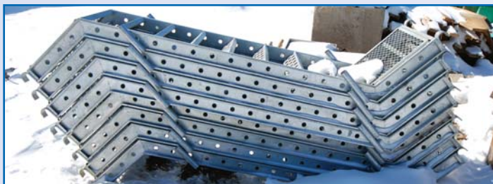
Partial View of Scaffolding Stairs