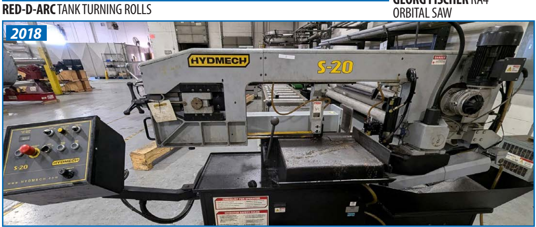
HYD-MECH S-20 BANDSAW