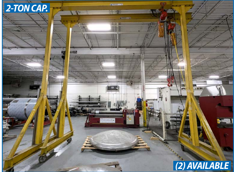
DRESSOR CRANE & HOIST PORTABLE GANTRIES