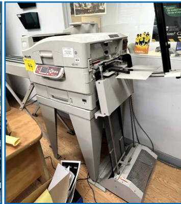
XANTE DIGITAL ENVELOPE PRESS