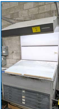
PARTIAL VIEW OF PLANT SUPPORT

PLUS: Hydraulic Lift Carts, Paper Juggers, Light Table, Conveyors, Pallet Racking, Paper Stock, Warehouse Ladders, Pallet Jacks, Workbenches, Scales, Compressor, Strapping Carts, Fireproof Cabinets, Office Furniture and Much More!