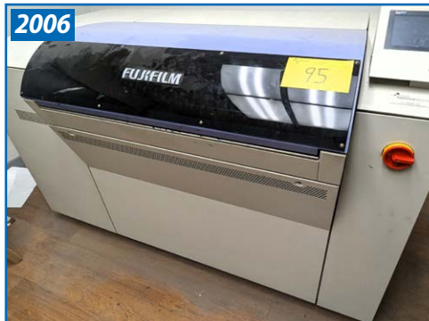
2006 SCREEN / FUJIFILM PT-R4100 CTP THERMAL PLATE RECORDER