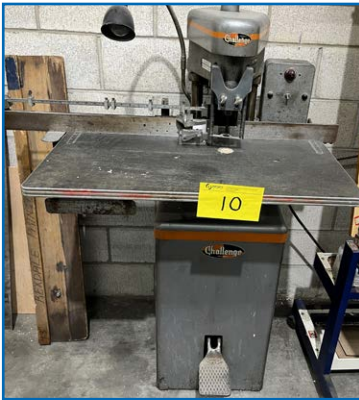
CHALLENGE SINGLE HEAD DRILL