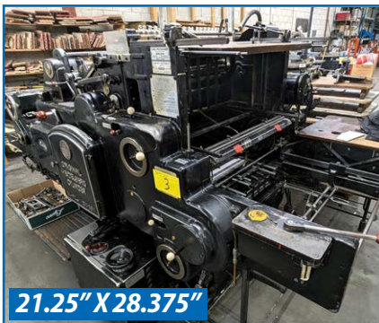
HEIDELBERG PRINTMASTER GTO 52 4-COLOUR SHEET-FED OFFSET PRINTING PRESS