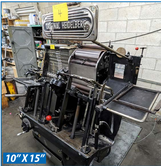
10" X 15" HEIDELBERG WINDMILL PRINT AND DIE CUT MACHINE