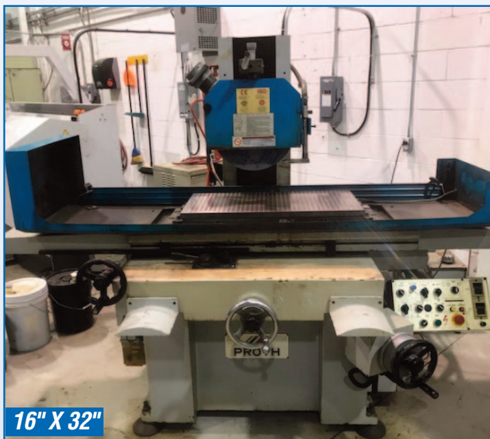
PROTH PSGS 4080AH AUTOMATIC HYDRAULIC SURFACE