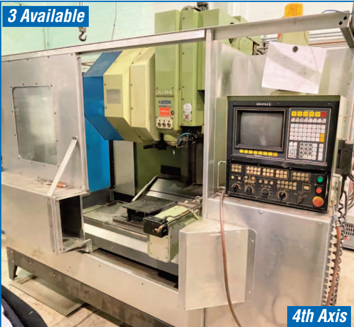
OKUMA MC-4VA CNC VERTICAL MACHINING CENTERS