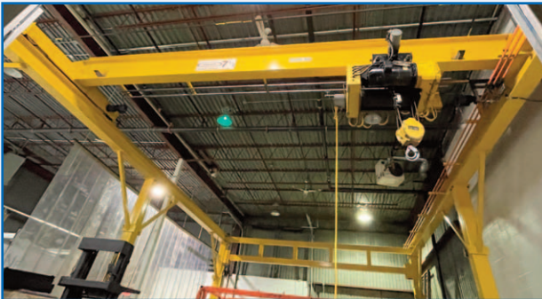
PARTIAL VIEW OF FREE STANDING CRANES