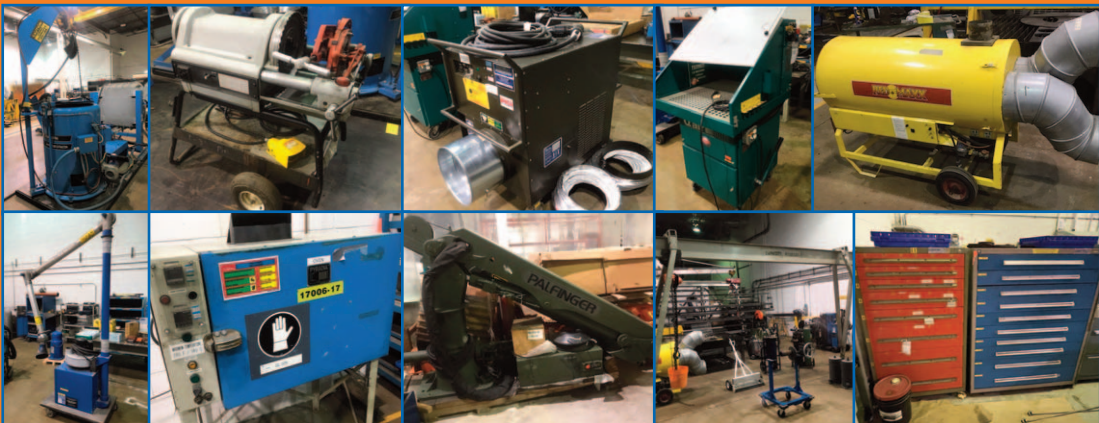
VIEW OF RIDGID PIPE THREADERS, WELDING POSITIONERS, CANTILEVER RACKING, HEAVY DUTY TOOL CABINETS

MASTEEL 220 Ton X 12' CNC Press Brake , Siemens SIMATIC PANEL Touch Screen Control MASTEEL 10500 Shear , 10' X 1/2" Cap., Siemens SIMATIC PANEL Touch Screen Control, s/n 0707001 2009 HAAS TL-2 CNC Lathe , CNC Control, 3-Jaw Chuck, Tailstock, Tool Post, s/n 0284 OPTIPRO SXL200 5-Axis CNC Machining Center , Fagor CNC Control OKUMA MC-4VA CNC Vertical Machining Center , OSP5000M-G CNC Control, 4th Axis, s/n 0101.9184 (2) OKUMA MC-4VA CNC Vertical Machining Center , CNC Control TOS SN 710S Engine Lathe , 28" X 157", Fagor DRO, 3 & 4-Jaw Chucks, Steady Rests, Tailstock, Tool Post, s/n 71007140060071