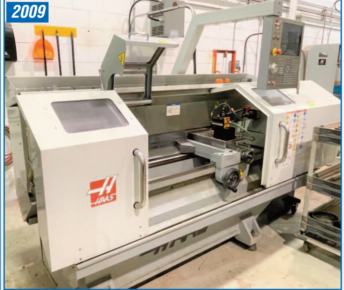
HAAS TL-2 CNC LATHE