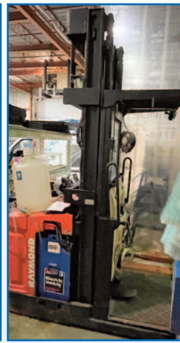
RAYMOND 150-OPC30T ELECTRIC ORDER PICKER