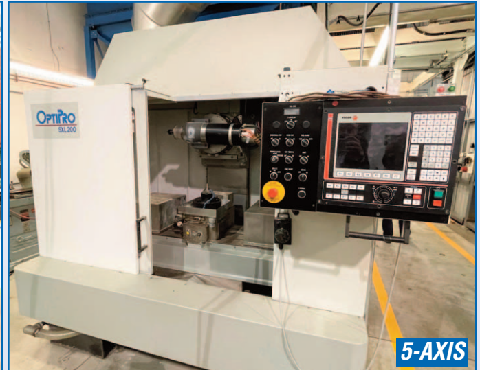
OPTIPRO SXL200 CNC MACHINING CENTER