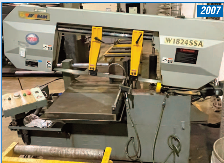
WAYTRAIN W1824SSA SEMI-AUTOMATIC HORIZONTAL BANDSAW