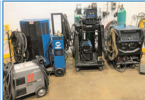
PARTIAL VIEW OF MILLER WELDERS