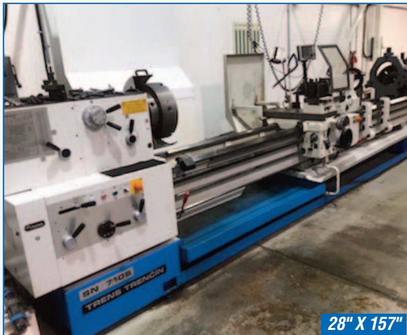
TOS SN 710S ENGINE LATHE