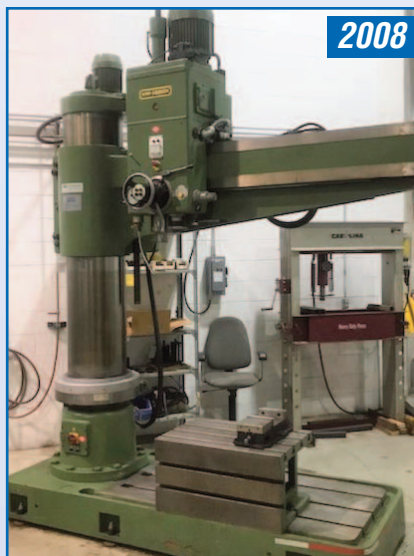
KAO MING KMR-1600DH RADIAL DRILL