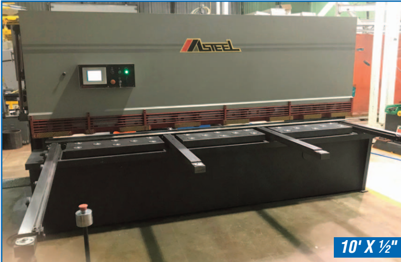
MASTEEL 10500 SHEAR