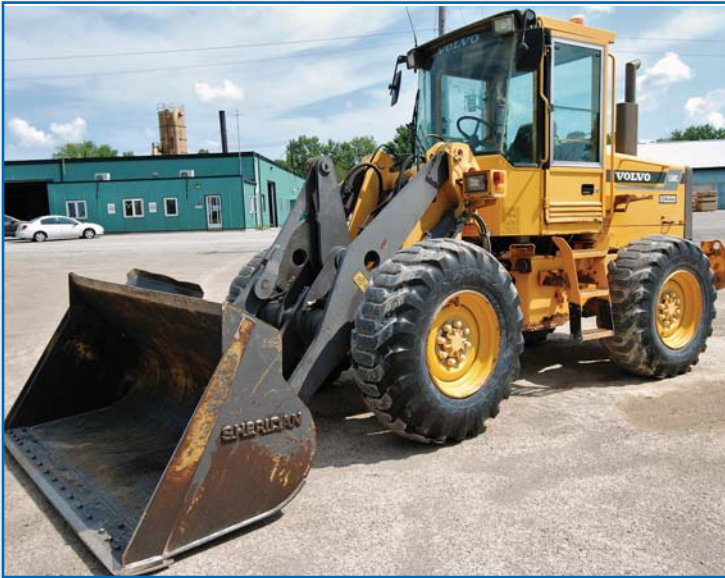
VOLVO L50C WHEEL LOADER