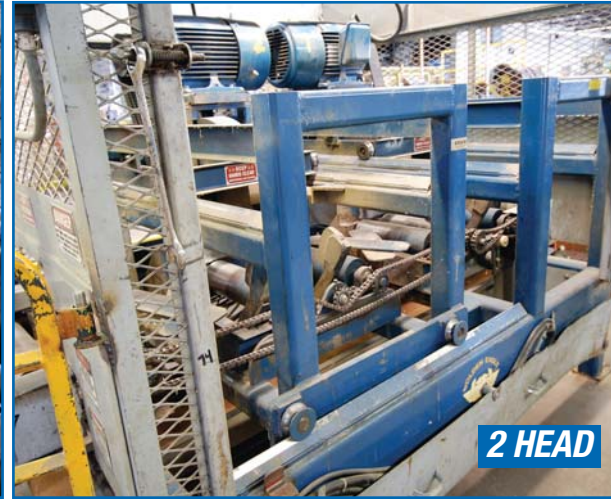
BREWER INC. BR-169T-U SAW