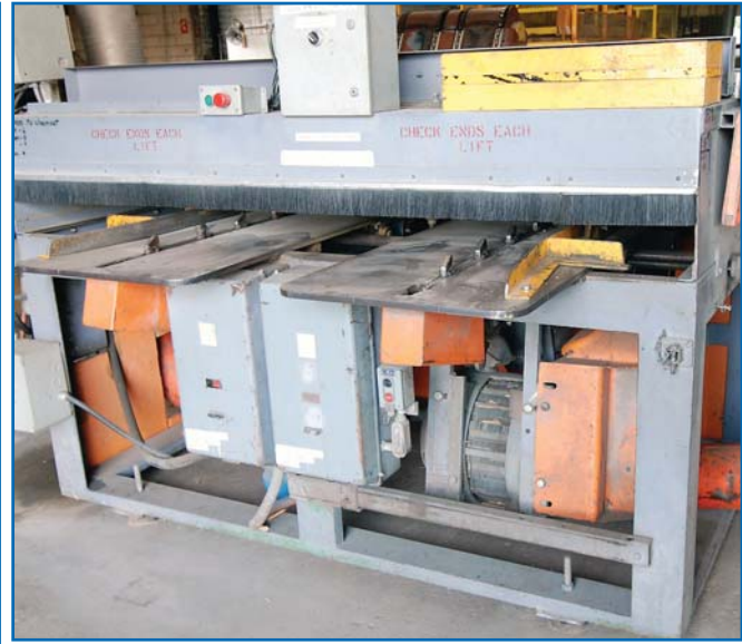
KENWELL 3072A NOTCHER