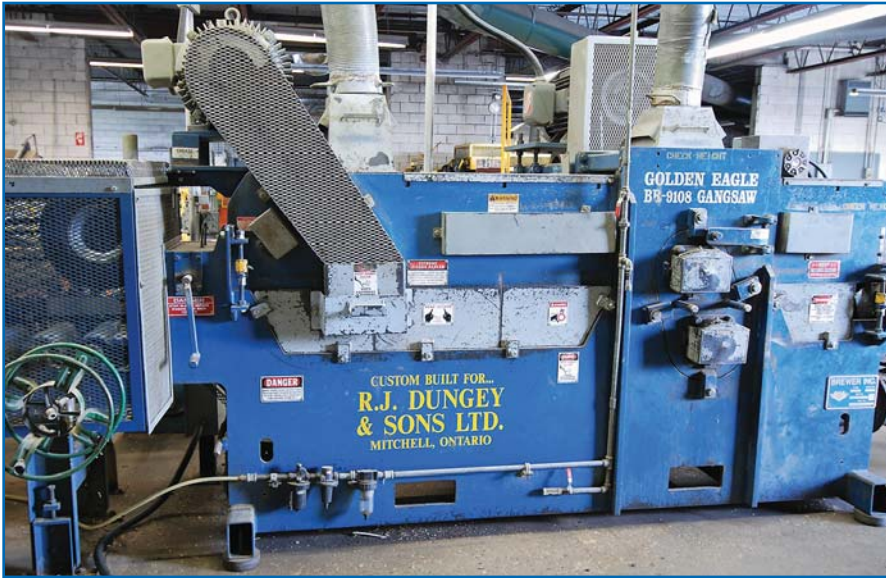
BREWER INC. BR-9108 GANGSAW