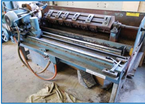
HANCHETT KNIFE GRINDER