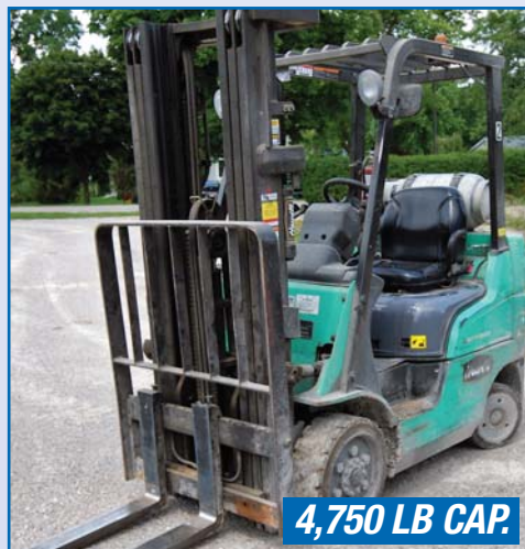
MITSUBISHI FGC25N-LP FORKLIFT

VOLVO L50C Wheel Loader, s/n L50CP11378, Approx. 7,333hrs (2) 2007 LIFT KING LK 8M42 Diesel Forklift, 8,000lb Cap., 14' Max Lift, Side Shift, Cascading Forks, Outdoor Tires, Cab, 4 Wheel Drive, s/n's LT 1670, LT 0392 2000 JCB 940 Diesel Forklift, s/n SLP94004YE0822631, 8,000lb Cap., 30' Max Lift, Side Shift, Outdoor Tires, Cab (2) CATERPILLAR 2P5000 Propane Forklift, 4,500lb Cap., 188" Max Lift, 3 Stage, Side Shift, Outdoor Tires, Cab, s/n's AT3530195, AT3531530 MITSUBISHI FGC25N-LP Propane Forklift, s/n AF82F20370, 4,750lb Cap., 187" Max Lift, 3 Stage, Side Shift, Outdoor Tires 2002 INTERNATIONAL 4400 DT466 Dump Truck, Approx. 298,000kms 2002 FREIGHTLINER FL70 Dump Truck, VIN# 1FVABUAK83HK35276, Approx. 375,000kms (2) WABASH 53' Trailers, VIN#'s 1JJV533W64L895806, 1JJV533W44L895805