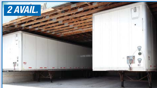
WABASH 53' TRAILERS