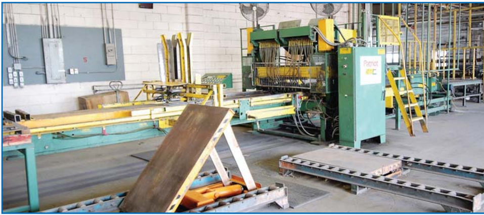
GBN PATRIOT PALLET NAILING LINE