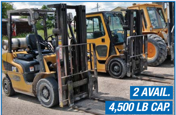
CAT 2P5000 LP FORKLIFTS