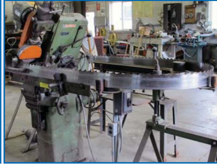
VOLMER CANA73 BANDSAW BLADE SHARPENER