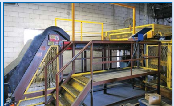
GBN REDI-STAK STACKER