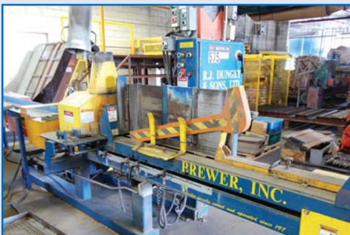
BREWER INC. GE-2000-CF CHAMFER SAW