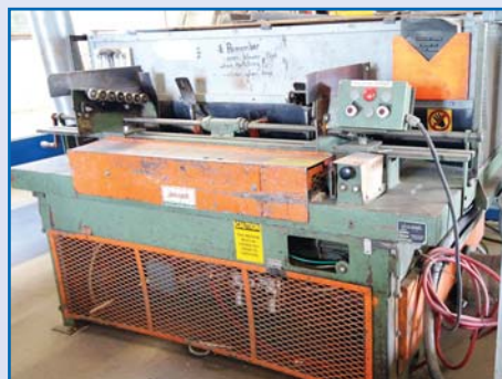
HAZELDINE J92 NOTCHER