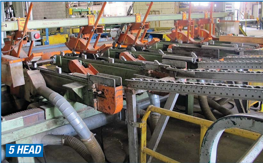
NELSON & ATKINSON MT-165 MULTI-TRIM SAW