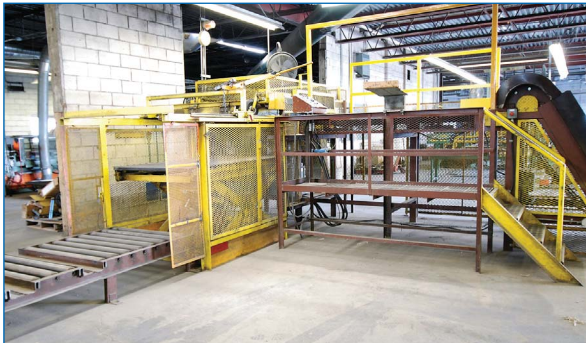
GBN REDI-STAK STACKER