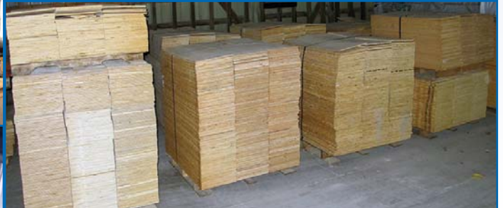
VIEW OF PALLETS, TOOLS, RAW MATERIAL

Bid Live ONSITE or ONLINE at BidSpotter.com