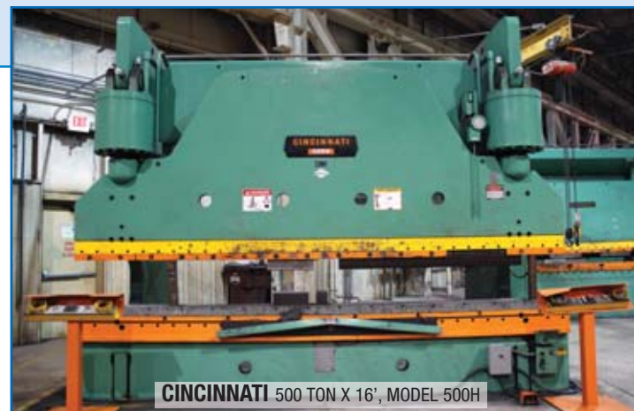
CINCINNATI 500 TON X 16', MODEL 500H

RAPID ENGINEERING Cure Oven, Approx. 10'6" Width x 11' Height x 95' Length, Natural Gas, 30 Mins Min Pre-Ignition Purge, Max Temp 400 Deg. F., 3,850,000 BTUH, Digital Temp & Discharge Limit Readouts, 4,200 CFH Input Rate, 14" Min Supply Pressure, 1 PSI Max Supply Pressure, 0.2-0.5" WC Burner Chamber Negative, 2.2" WC Diff, Burner Gas Pressure, OP II 435 Burner Type, 40 HP Recirculating Fan, 1 HP Burner Fan, ¾ HP Oven Exhaust Fan, Honeywell Control, Galab Timer, 460V, sn 072038