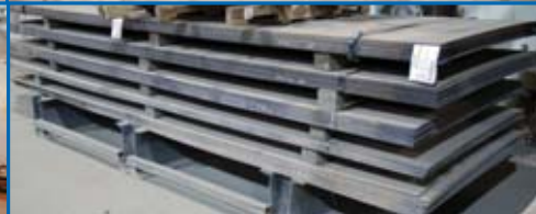
PARTIAL VIEW OF ASSORTED RAW MATERIAL + OFFCUT INVENTORY