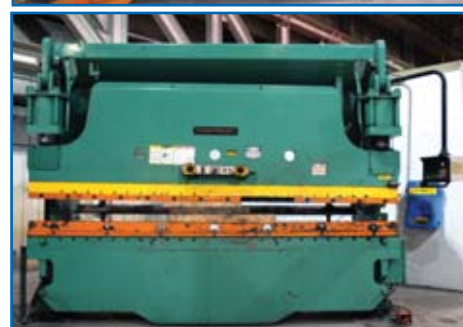
CINCINNATI 230 TON X 14', MODEL CB230