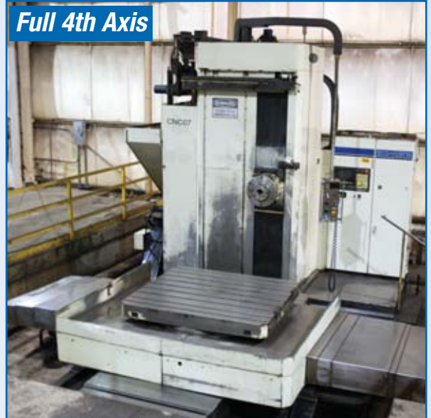
TOSHIBA SHIBAURA BTD 11E R16 CNC HORIZONTAL BORING MILL