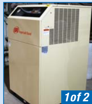
INGERSOLL RAND 100 HP ROTARY SCREW AIR COMPRESSOR