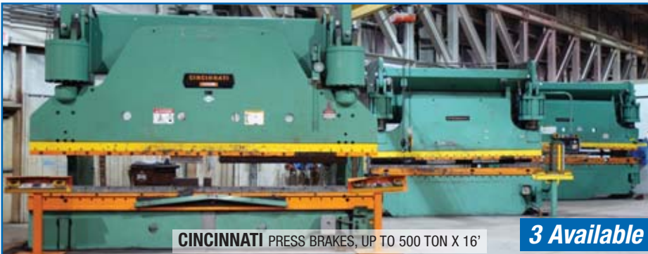
CINCINNATI PRESS BRAKES, UP TO 500 TON X 16'