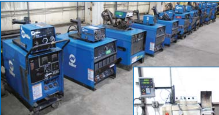
VIEW OF 9 MILLER WELDERS