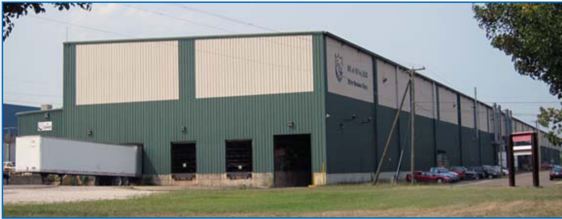
6.82 ACRES OF REAL ESTATE AVAILABLE FOR SALE, BUILDING DIMENSIONS: 88' X 1,138', 48' CEILING, (3) 10 TON CRANES, RIVER & RAIL ACCESS.