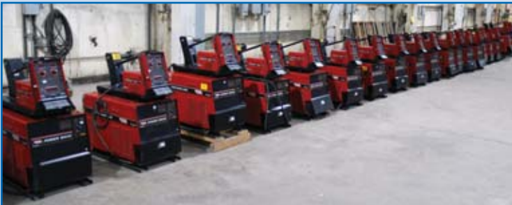
VIEW OF 20+ LINCOLN ELECTRIC WELDERS

(20) 1 Ton Column Mounted Jib Cranes, 20'-23', Most with Electric Chain Hoists