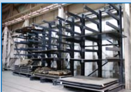
PARTIAL VIEW OF HEAVY DUTY RACKING