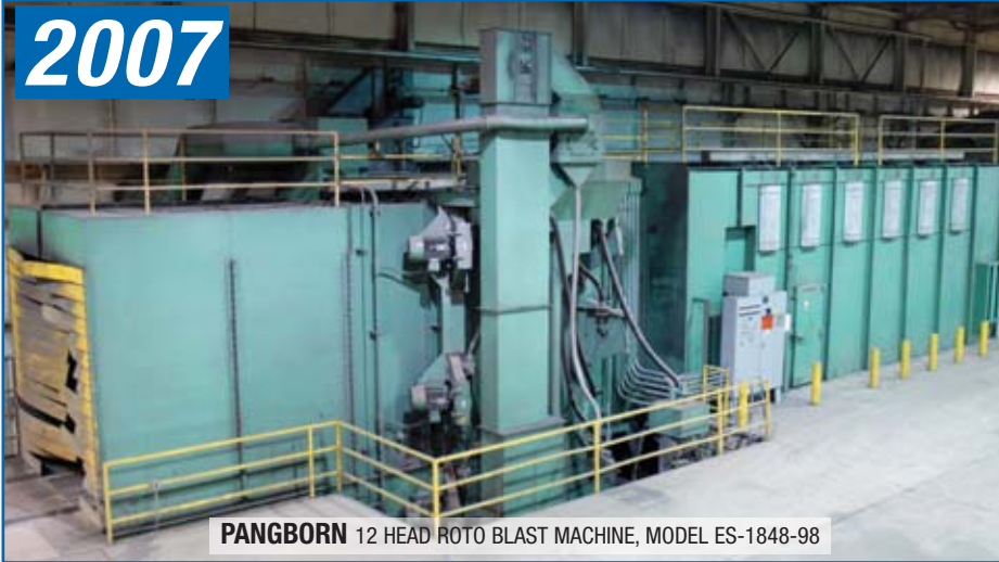
PANGBORN 12 HEAD ROTO BLAST MACHINE, MODEL ES-1848-98