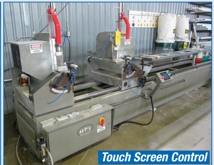
Touch Screen Control

EMMEGI TRD450 16" DUAL AUTOMATED PVC MITRE SAW