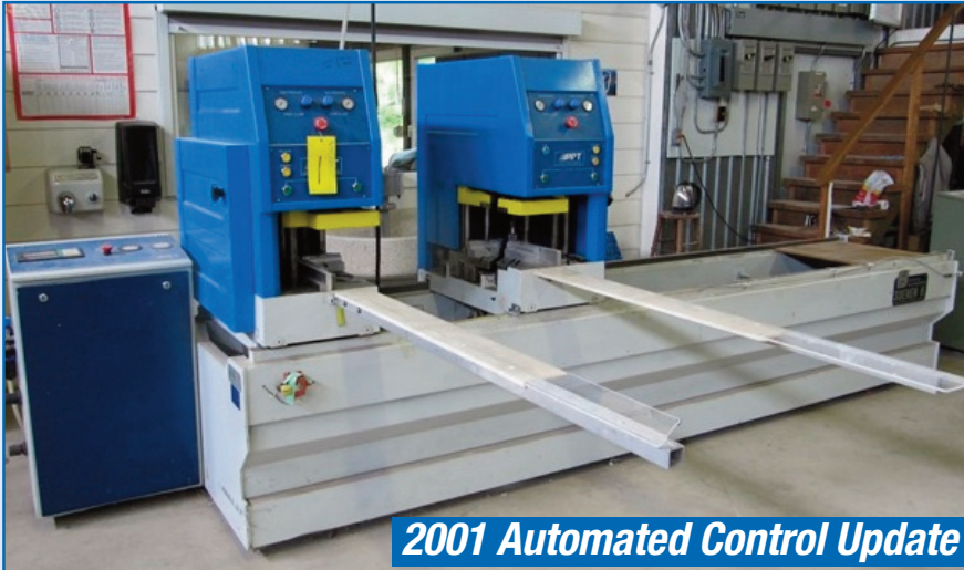
2001 Automated Control Update

85 Coldwater Road, Waubauskene, Ontario, Canada