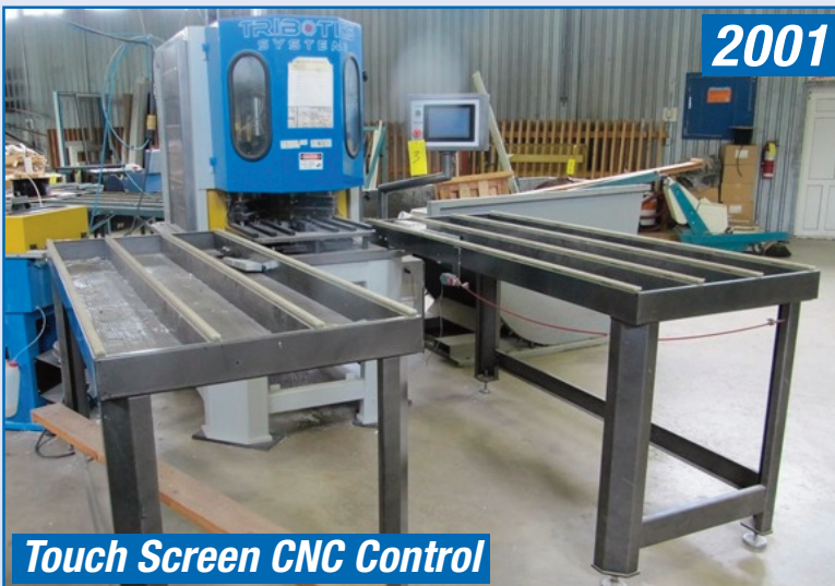
2001 Touch Screen CNC Control

2006 PERTICI UNIVER ML1231/EP HORIZONTAL END MILL