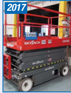
SKYJACK SJJIII 3219 SCISSOR LIFT