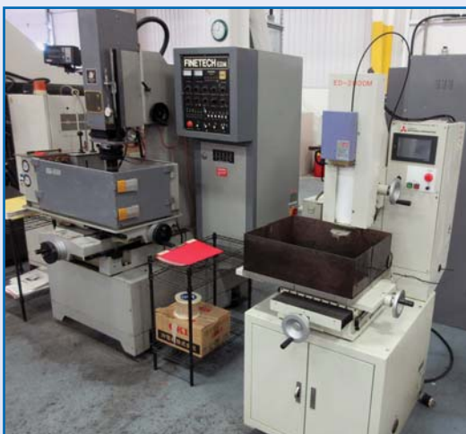
MITSUBISHI & FINETECH EDM'S