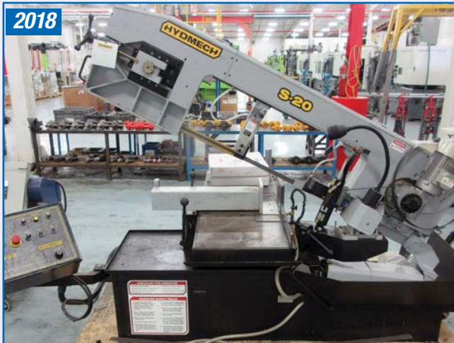
2018 HYD-MECH S-20 HORIZONTAL BANDSAW