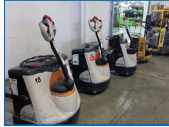
CROWN & YALE WALK BEHIND LIFTS