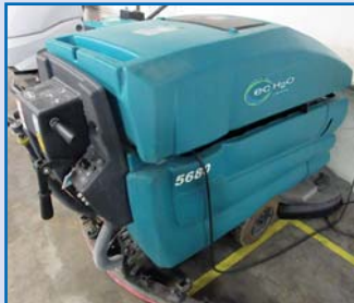
TENNANT 5680 FLOOR SCRUBBER