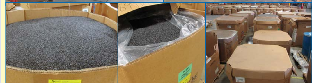
VIEW OF RESIN RAW MATERIAL IN TOTES