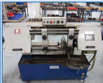
VIEW OF BANDSAW