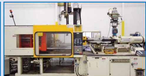
ENGEL 250 TON INJECTION MOLDING MACHINE