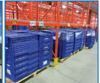
VIEW OF PLASTIC TOTES