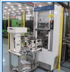
ADAPTO 318-A PARTS FEEDER SYSTEM