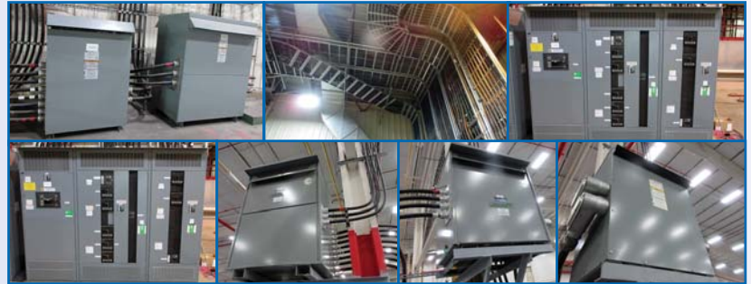
VIEW OF ELECTRICAL GEAR