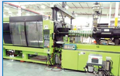
ENGEL 500 TON INJECTION MOLDING MACHINE