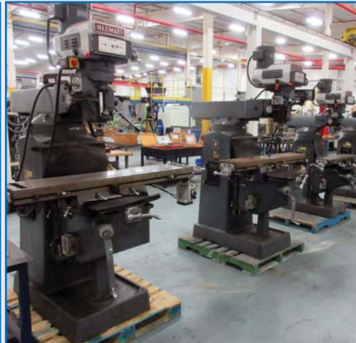
MAXIMART MILLING MACHINES