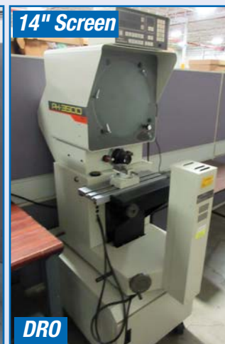
MITUTOYO PH3500 PROFILE PROJECTOR