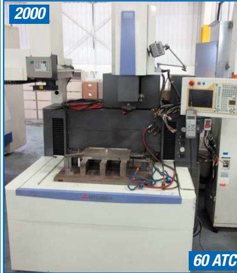
2000 MITSUBISHI EA22E-FP60EA CNC EDM