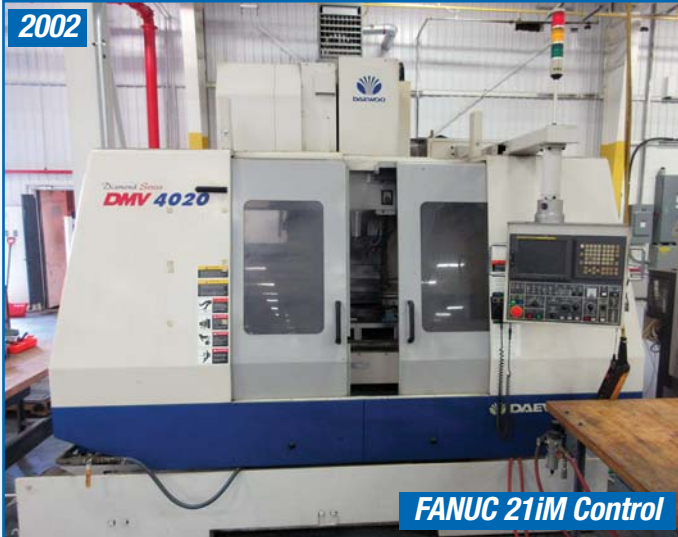
2002 DAEWOO DMV-4020 CNC VERTICAL MACHINING CENTER