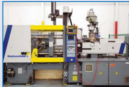
165 TON BATTENFELD INJECTION MOLDING MACHINE