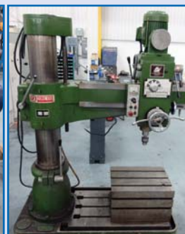
TONE FAN RD-900 RADIAL DRILL