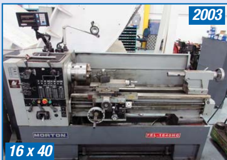
2003 MORTON ENGINE LATHE