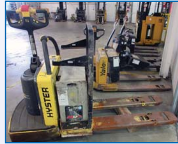
HYSTER WALK BEHIND LIFTS