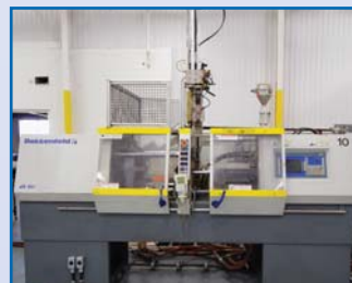
50 TON BATTENFELD