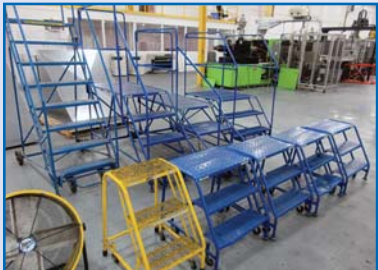
WAREHOUSE STEP LADDERS

Also: LINCOLN welders, Pallet Trucks, Carts, Cabinets, Tooling, Fans, Office Furniture and more