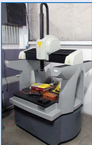
BROWN & SHARPE ONE 7.7.5 CMM